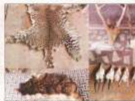
Retired colonel, 60, is seen with the seized items.

MEERUT At least 117 kg of meat of wild animals, birds and animal parts and arms were seized during raid at the residence of a retired colonel in Meerut. Officers of the Department of Revenue Intelligence (DRI), Forest Department and Wildlife Conservation Department raided the home of a retired colonel in Meerut on Tuesday. The raid was conducted in the presence of the District Collector, Meerut, and the District Forest Officer, Meerut. The raid resulted in the seizure of 117 kg of meat of wild animals, birds and animal parts, and arms. The raid was conducted in the presence of the District Collector, Meerut, and the District Forest Officer, Meerut.