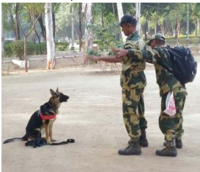
Wildlife sniffer dog in training