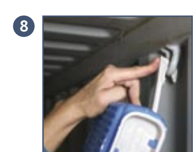
Once the hook is pulled down into the loop...