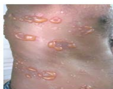
Figure 1: Urticated plaque with blister, Figure 2: String of pearl arrangement