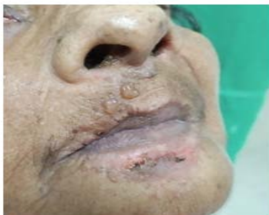
Figure 4: Facial involvements in BP

32% of patients gave history of chronic drug intake. 23% of them were on multiple drugs (antihypertensives, oral hypoglycemic agents and statins). 6% of patients were on Amlodipine alone and 3.6% of patients were on Glimipiride.