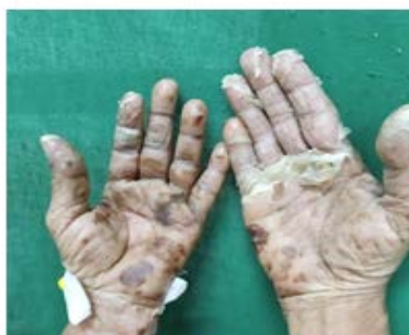
Figure 3: Dyshidrosiform type of BP