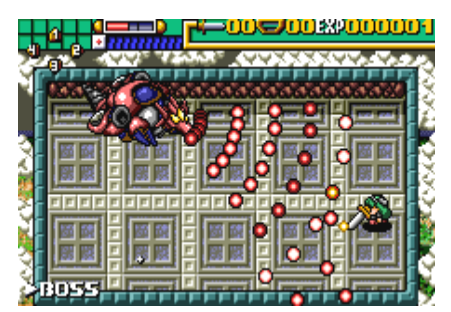
These two games were released as standard cartridges. They are slightly upgraded versions of the two WWGP winners. Judgement Silversword Rebirth Edition was released on February 5<sup>th</sup> 2004 (priced 4800 Yens) while Dicing Knight was released on May 31<sup>st</sup> 2004 (priced 4200 Yens).