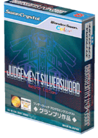
Judgement Silverword Rebirth Edition