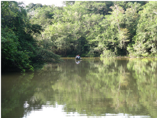
FIGURE 3. Locality where Astrodoros sp. (CIACOL 419) was captured in the Amacayacu National Park, Colombia.

Kner's (1853) description of A. asterifrons was accompanied by an illustration of the gas bladder showing a simple posterior (terminal) diverticulum. Eigenmann (1925) recognized variation in the external morphology of gas bladders he examined in specimens captured in Jutahy [Jutaí] and Santarém, Brazil. Specimens from Jutahy [Jutaí] had a gas bladder characterized by a pair of posterior diverticula with laterally divergent "sausage-shaped" horns (similar to the Colombian specimens in Figure 1C); while those from Santarém had a short, simple posterior diverticulum (similar to the one illustrated by Kner). Based on this and other morphological differences currently under study by Sabaj Pérez and Sousa ( personal communication ), specimens having a gas bladder with paired posterior diverticula, including those captured in Amacayacu National Park, belong to a new and undescribed species of Astrodoros .