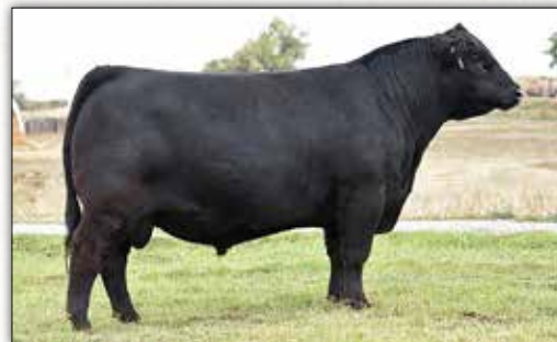
Poss Maverick Embryos sell as Lot 228.