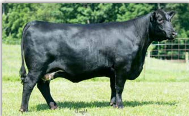
Trowbridge Forever Lady 719

This impressive daughter of Connealy Thunder is the dam of Lot 253.