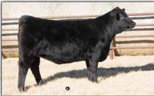
LHR-BAR Rita 1782-6375

A $10,000 maternal sister to Lot 31 at Rooney Angus Ranch.