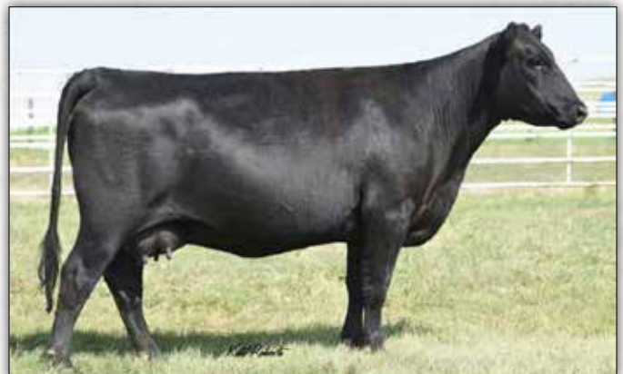
KR Lady May 6584

The $50,000, second high selling female of the Krebs Angus dispersal and maternal sister to Lot 37.