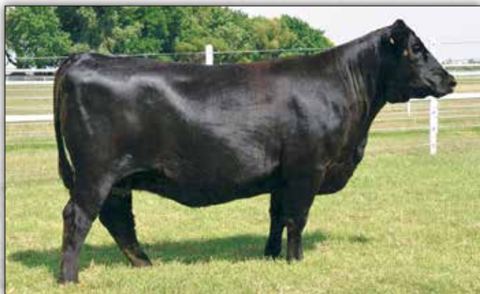
EXAR Lady Blanche 9056 The dam of Lot 205.