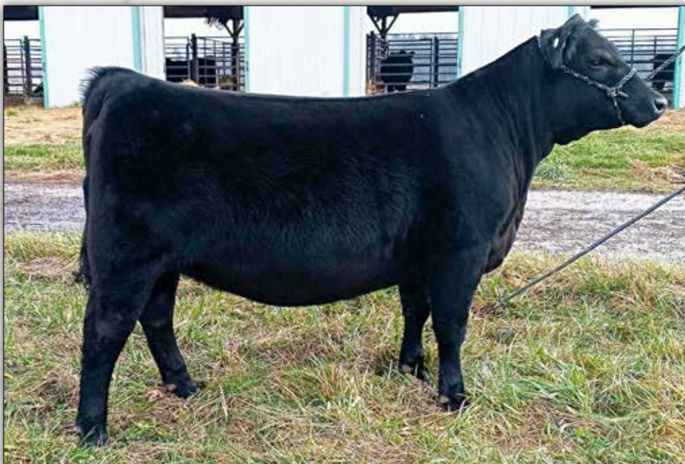
WCC Forever Lady H301 She sells as Lot 54B.