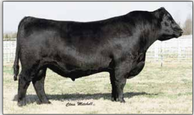
Plattermere Weigh Up K360