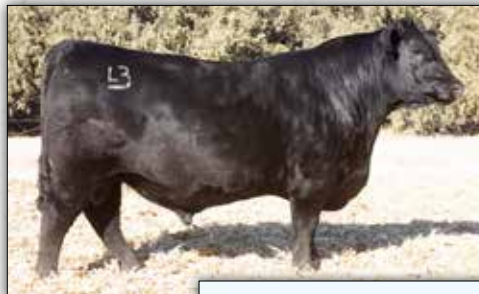
Mill Brae A Plus 9008