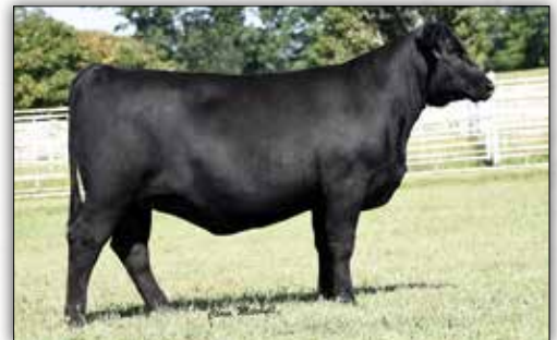
Deer Valley Barbara 96142

This time-tested sire is a maternal brother to the dam of Lot 6.