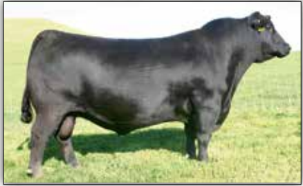
SAV Pioneer 7301