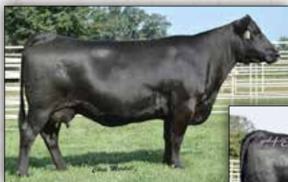
Deer Valley Rita 1126 An embryo sells in the Lot 207 package.