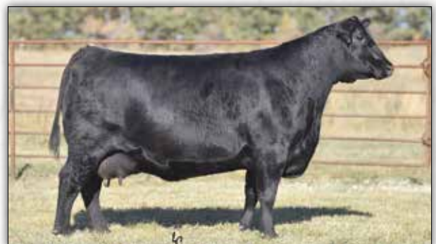
EA Primrose 3149