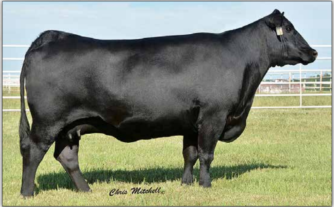
Bobo Rita 1559

The powerful maternal granddam of Lot 39.