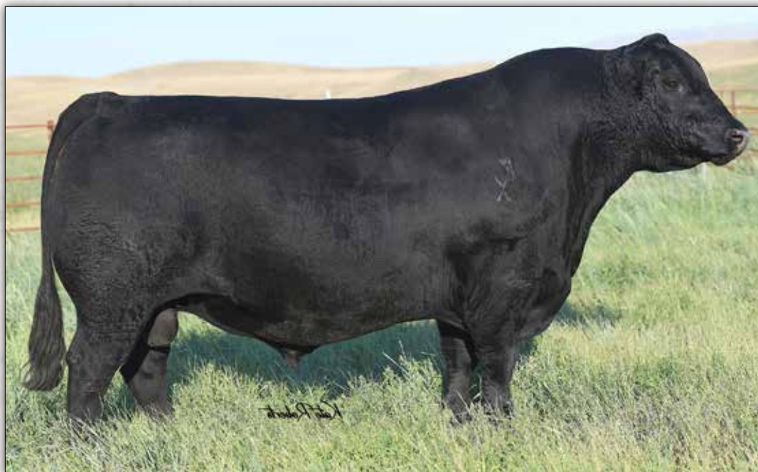
EXAR Monumental 6056B A daughter of this $80,000 one-half interest sire sells as Lot 45.