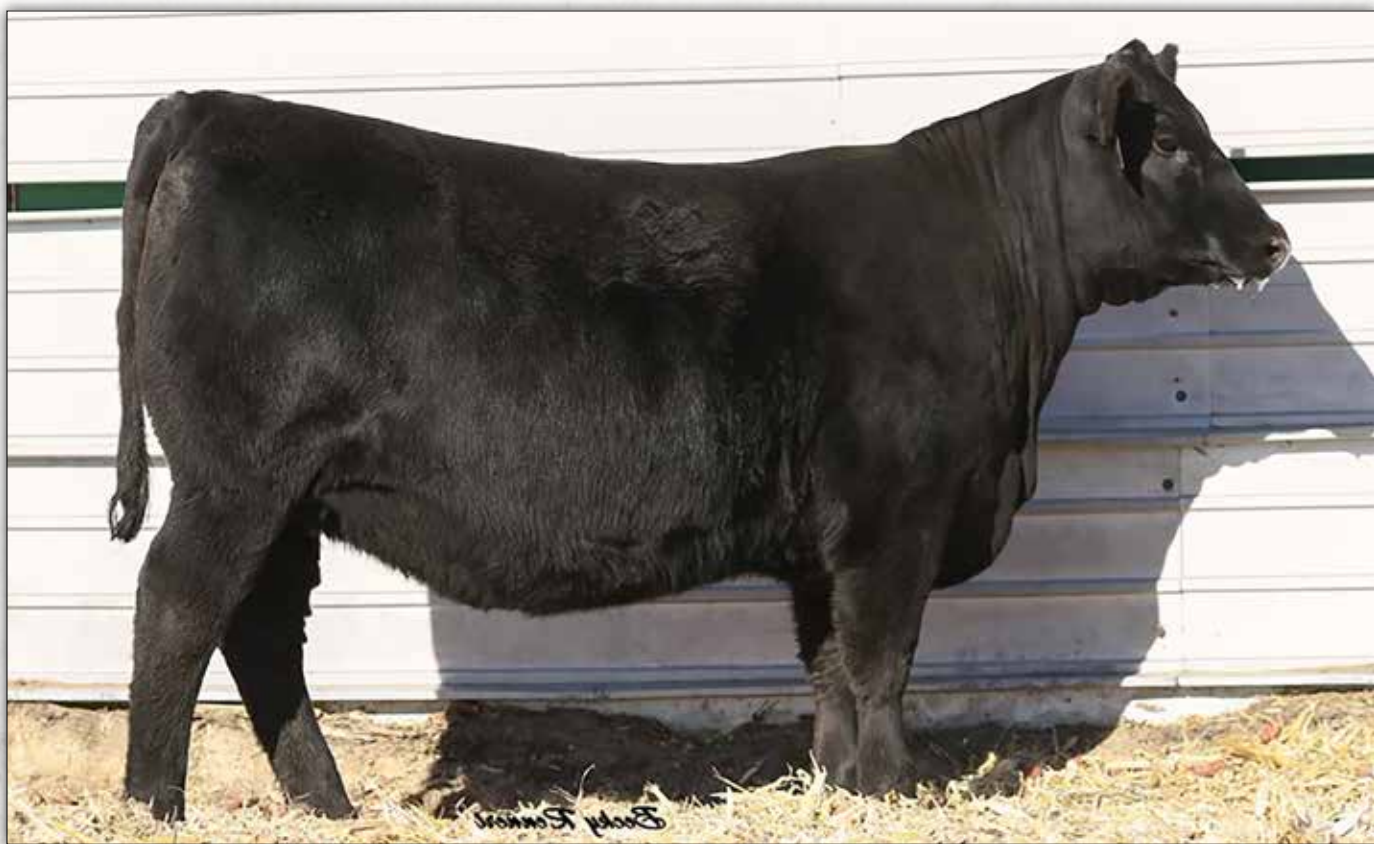
T/D Blackcap Empress 09

This extreme performance daughter of B/R MVP 5247 sells as Lot 48.