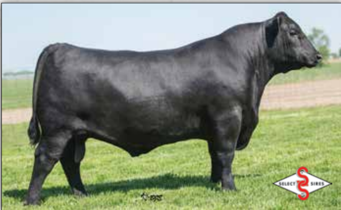
S S Niagara Z29

This extremely popular Select Sires AI sire is a maternal brother to Lot 42.