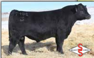
G A R Home Town Sire of Lot 47.

This phenomenal daughter of Connealy Impression is the dam of Lot 47.