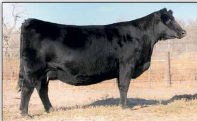
Baldco Trowbridge Emulota 684

This full sister to Traction is the dam of Lot 251 and 252.