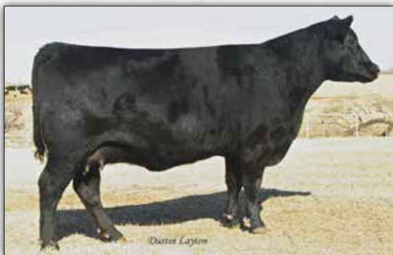
E&B Lady Precision 310

Two very impressive, curve-bending growth daughters of Deer Valley Growth Fund and the very best produced in 2020 from the DVAR program.