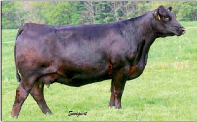
Gaffney Lady 337