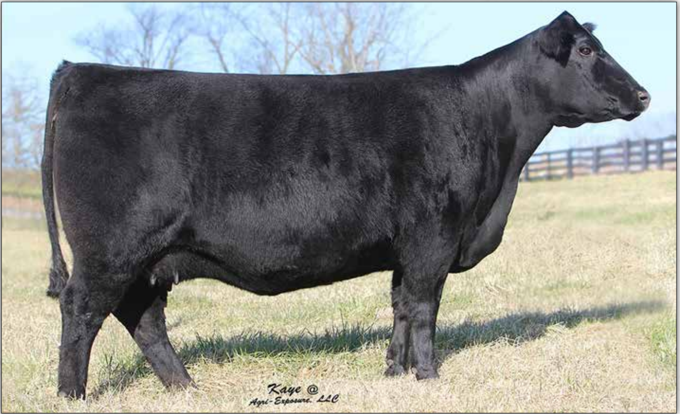
Thomas Butterfly 4742 The dam of Lots 3A and 3B.