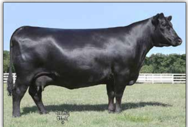
VAR Blackcap 9319

The $171,000 maternal granddam of Vintage Blackcap 5417.