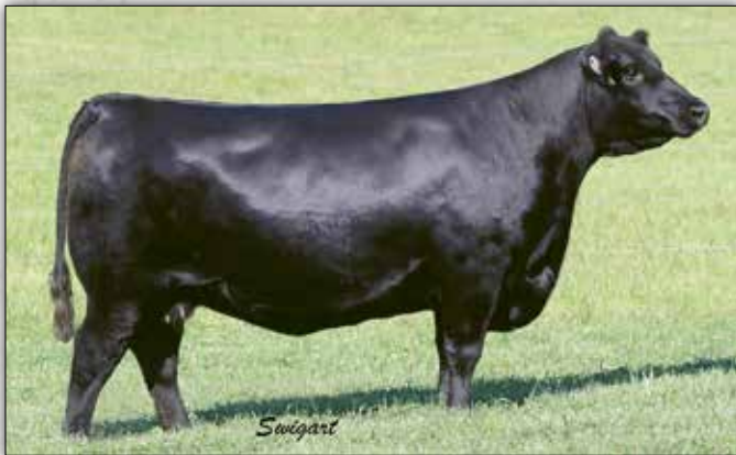
RB Lady Standard 305-02

The influence of this $170,000 breed legend sells through the Gaffney embryo offering.