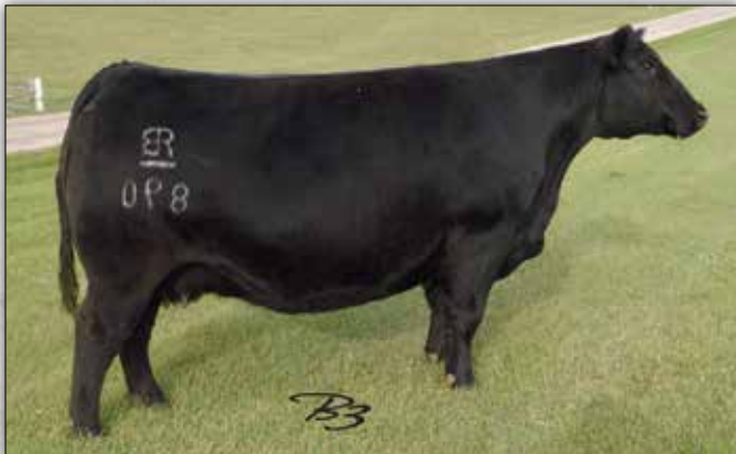
RB Lady Standard 305-890

The influence of this $170,000 breed legend sells through the Gaffney embryo offering.