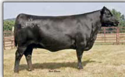
Rita 5F56 of 1198 FD The $62,500 foundation dam of Lot 30.

This $20,000 selection of Katie Colin Farm in the Spring 2020 LHR sale is a maternal sister to Lot 30.