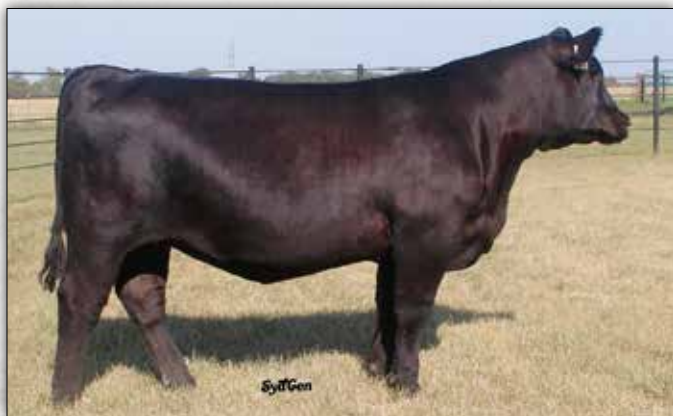
SydGen Rita 7878 The dam of Lot 233.

These Jet Black embryos are produced from a donor dam who is one of the coolest designed, most beautiful fronted, high-marbling females to be found, and she also has an impressive progeny ultrasound record of %IMF 11@107 and UREA 11@104.