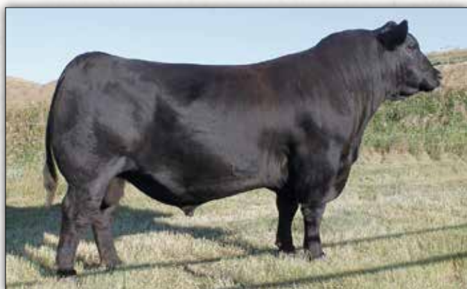
Hoover No Doubt

Several embryo packages sell from this rare sire.