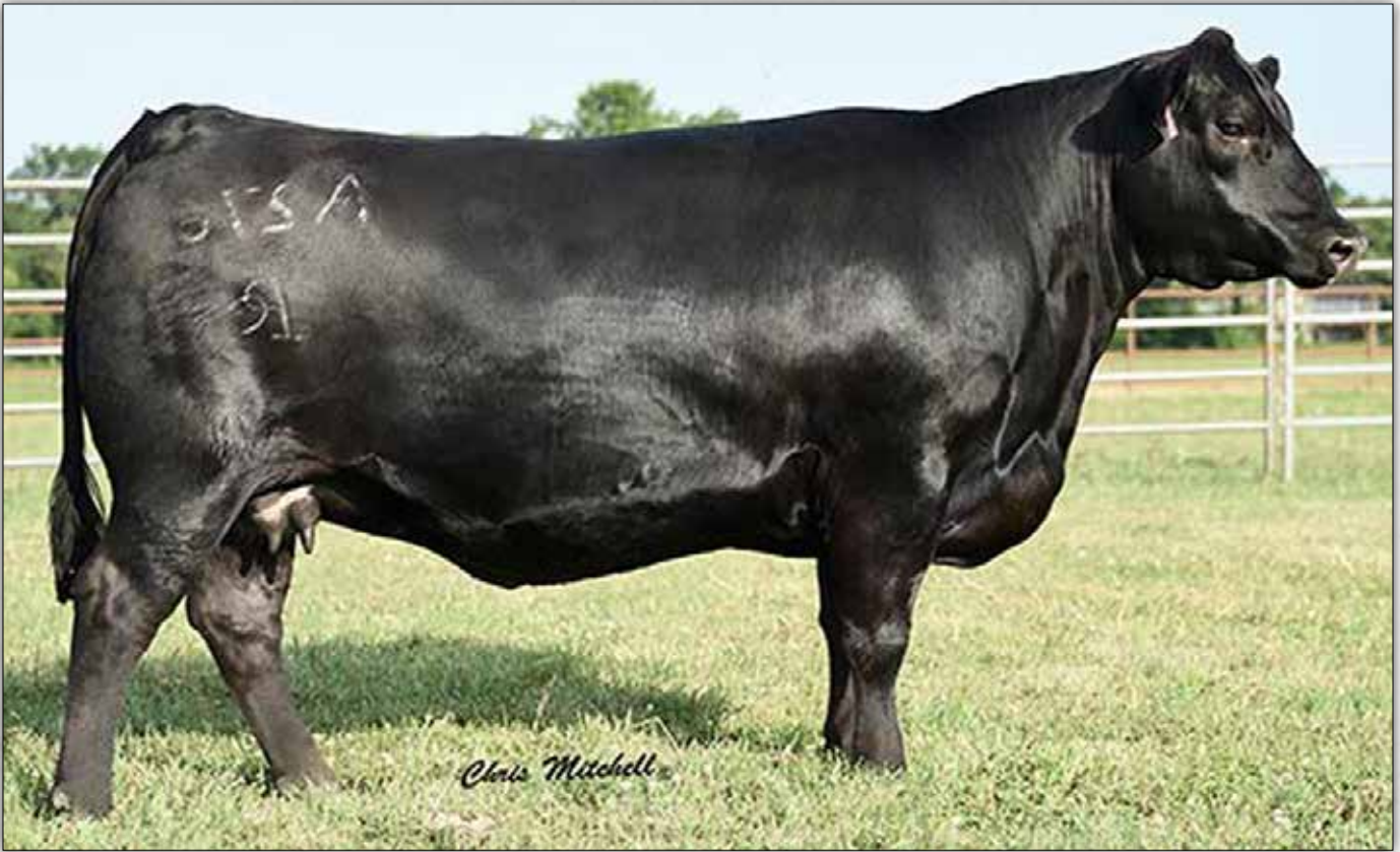
HPCA Sunrise A276