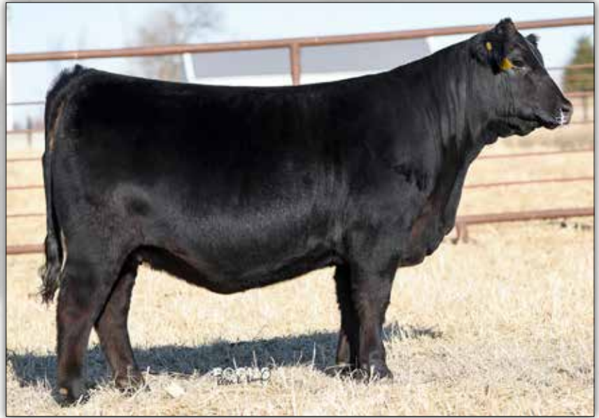
Bullerman Emblynette 0034 She is offered as Lot 4C.