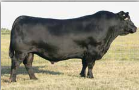
SAV 8180 Traveler 004