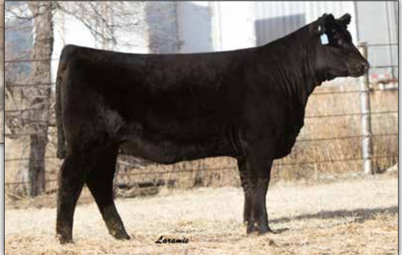
DVAR Blackcap 532 045X She sells as Lot 10.