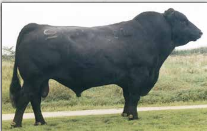
DHD Traveler 6807