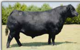
Baldridge Alternative E125

A $55,000 maternal sister to the dam of Lot 41.