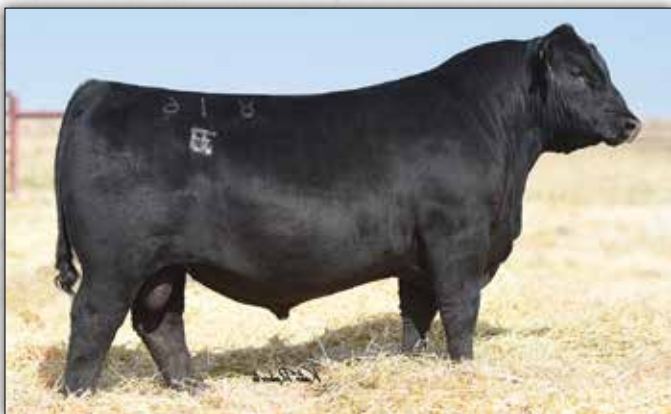
E&B Plus One