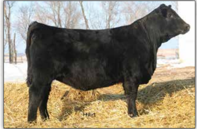
Hart Mamie 9570 The dam of Lots 210, 211, 212 and 213

• A combination of the $60,000 ST Genetics sire Connealy Clarity with a dam sired by Jindra Acclaim, produced from a female bred in the BJ program in Kansas tracing to a long line of females from the 2 Bar program in Texas.