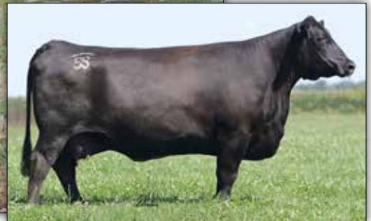
Jet S S X144

This maternal sister to S S Niagara Z29 sells as Lot 42.