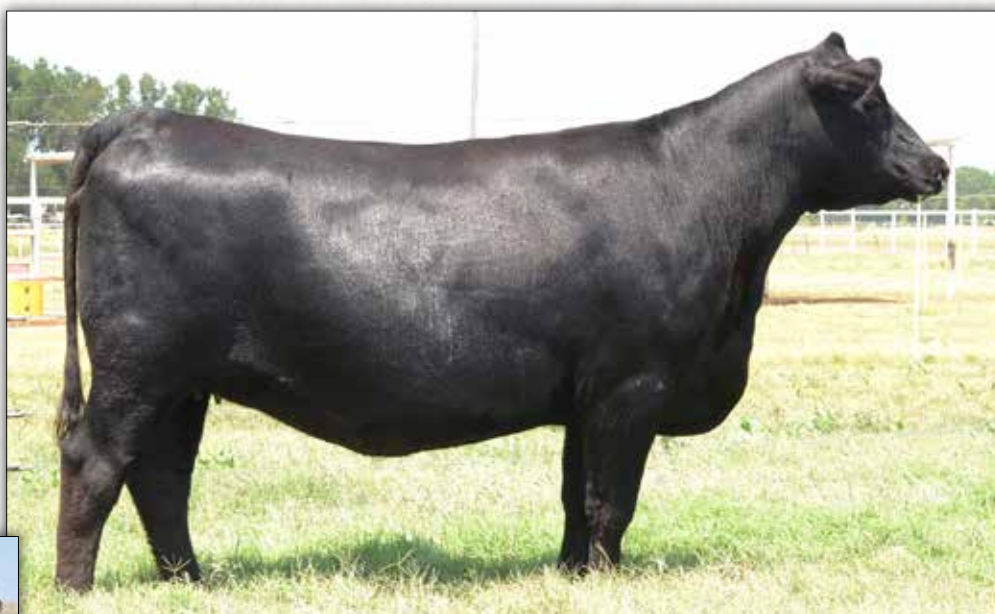
EXAR Blackcap 6189

The $100,000 one-half interest dam of Lot 19.