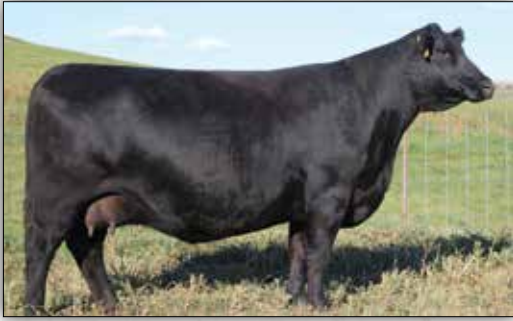
SAV Emblynette 3164 The dam of Lot 4C.