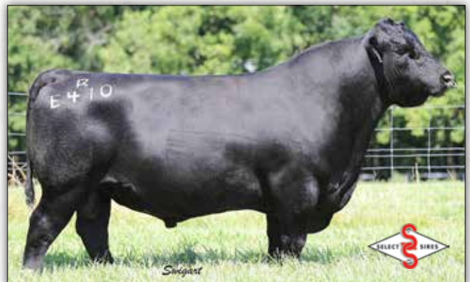
Tehama Bonanza E410