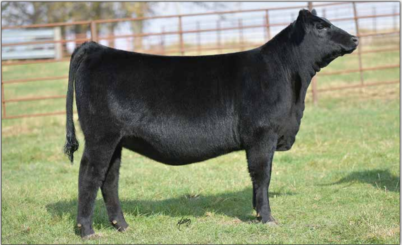
SA Lady May 7860

This outstanding daughter of Hoover No Doubt sells as Lot 37.