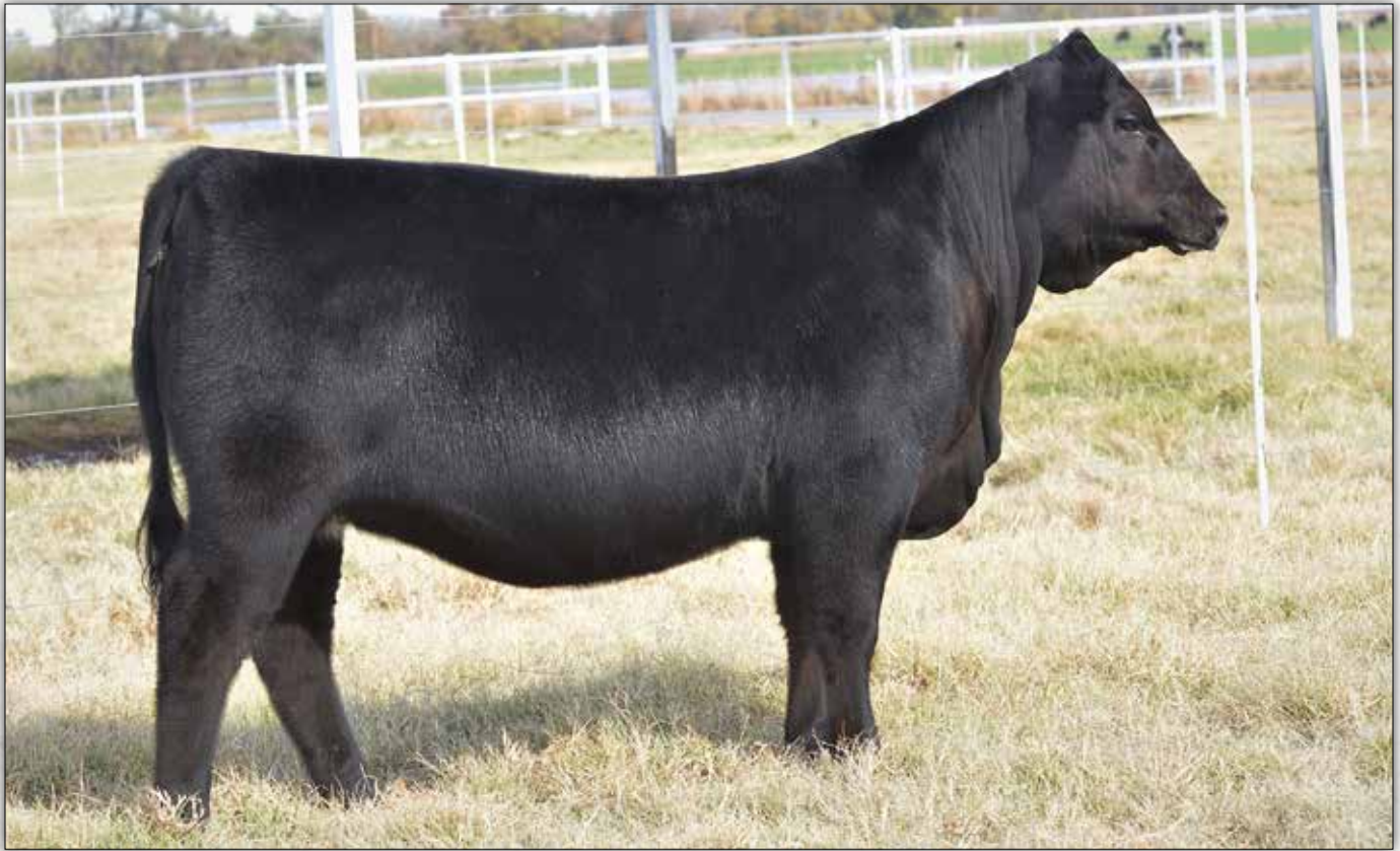
EXAR Rita 0251

This daughter of Plus One sells as Lot 18.