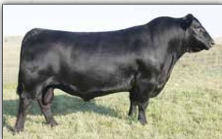
SAV 004 Density 4336