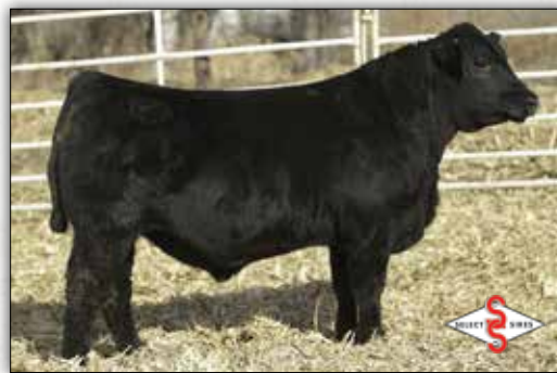
Baldridge Movin On G780