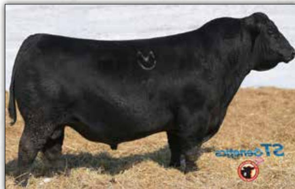
B/R MVP 5247

The highly productive maternal grandam of Lot 48.