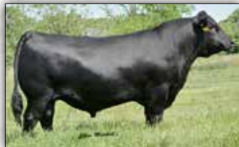
KCF Bennett Citation