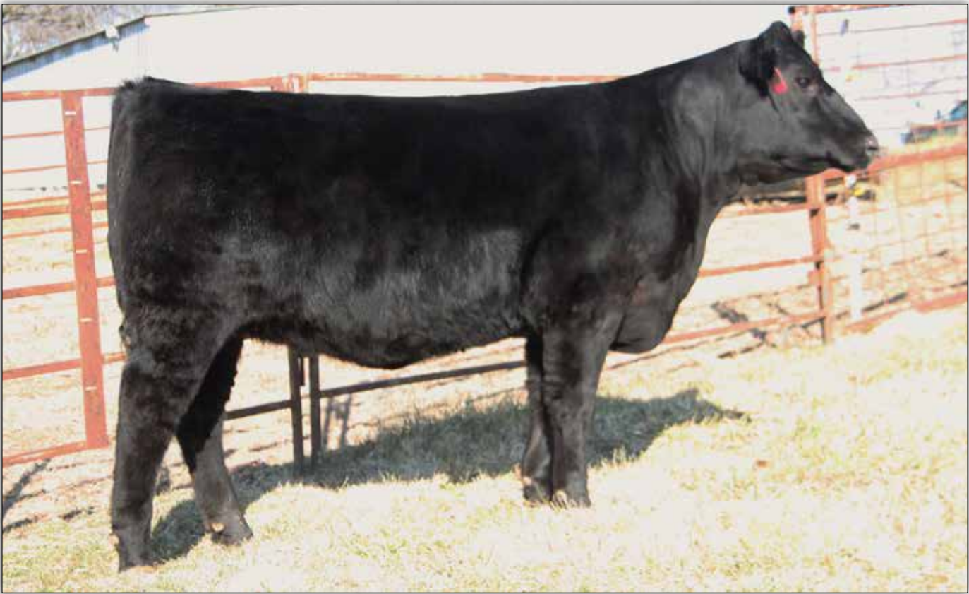
GDD Emerald Rita H104

This unique Connealy Emerald daughter sells as Lot 24.