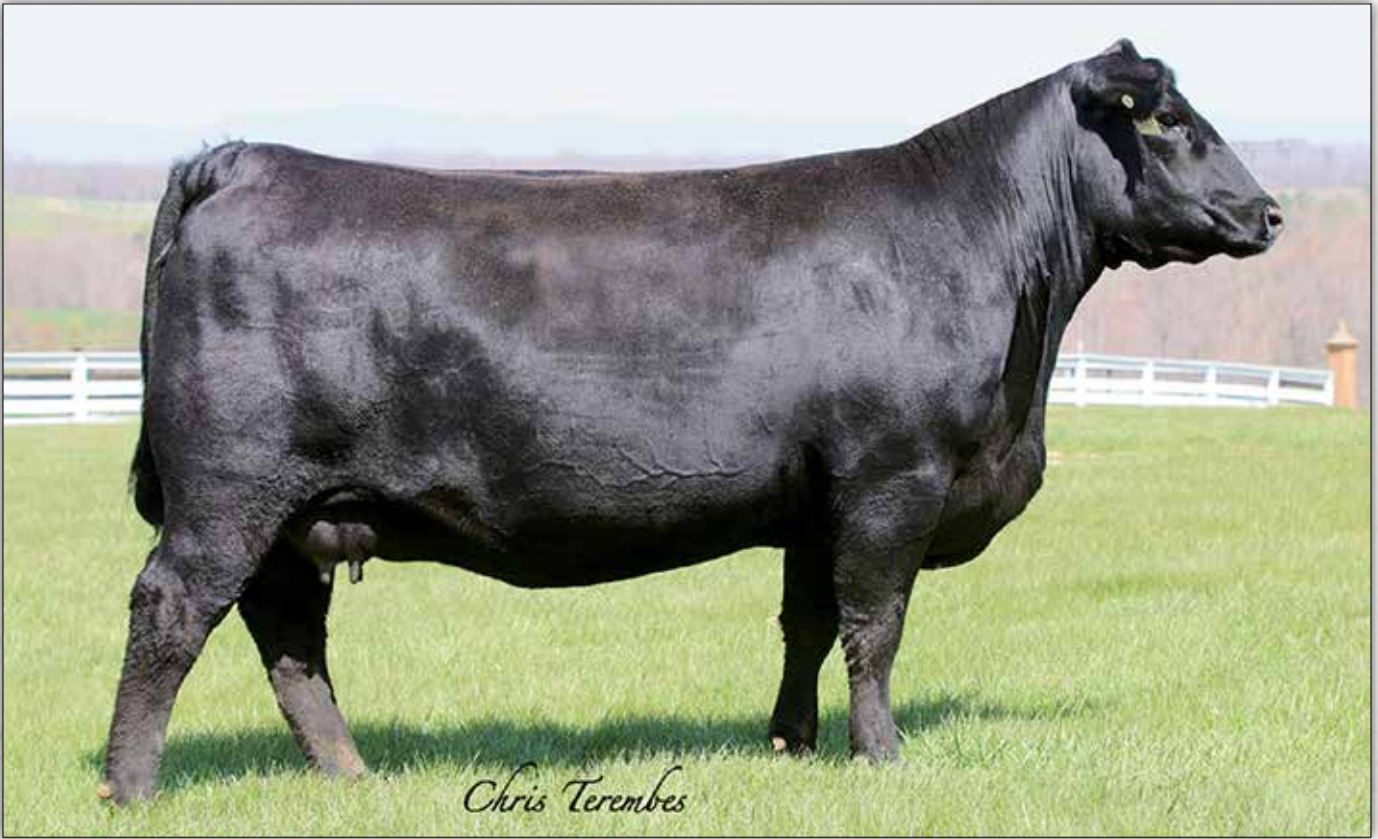
Wild Wind Black Cap 5K61

This powerful Connealy Black Granite daughter is the donor dam of Lots 26 and 26A.