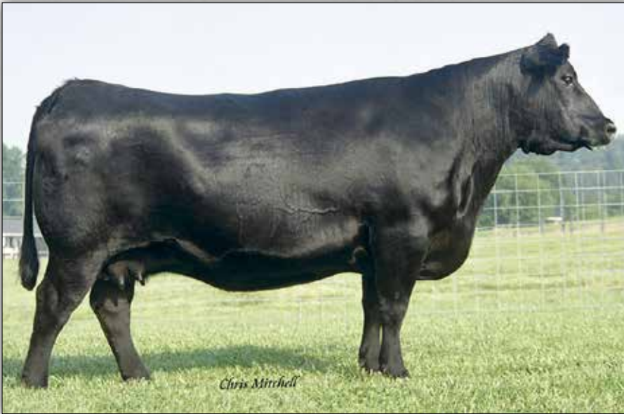
GAR EXT 614