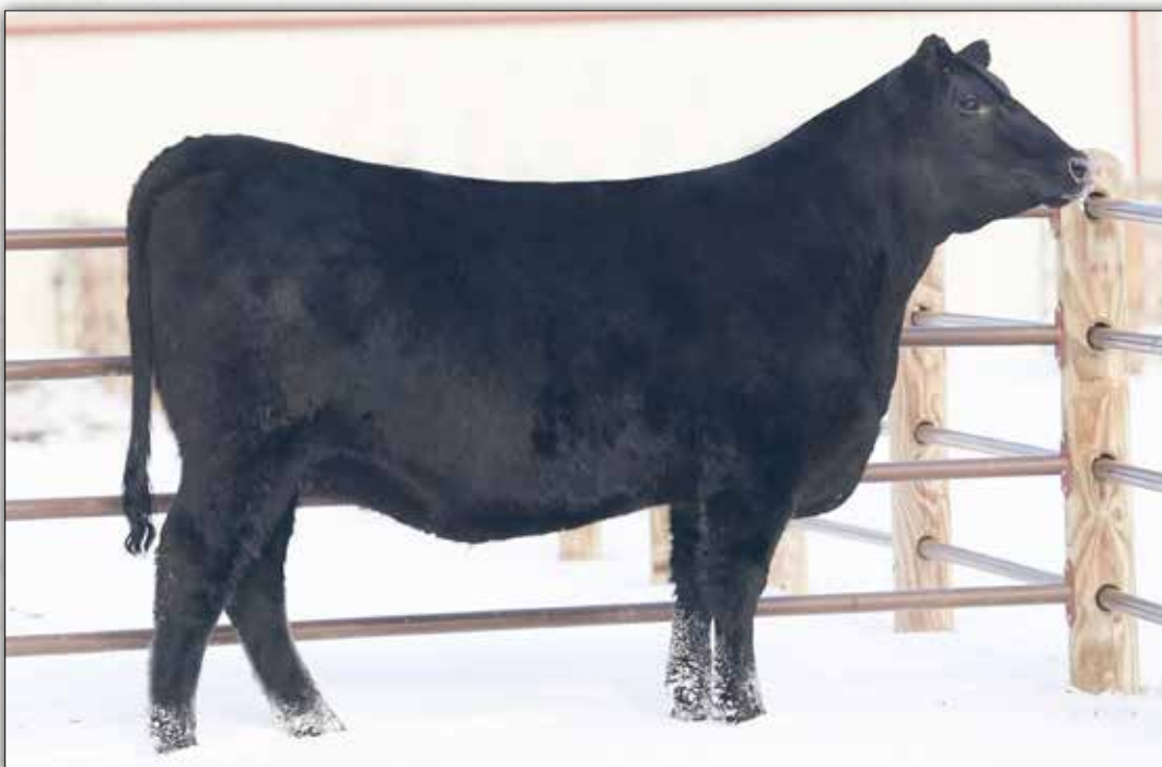
XLAR Rita 8533 The dam of Lot 105.