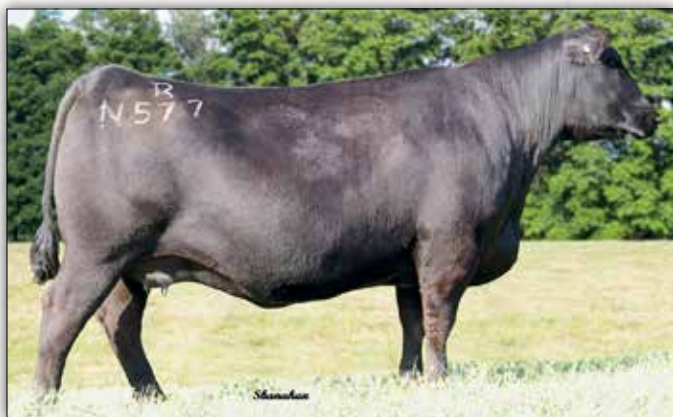
Tehama Blackcap N577 The dam of Lot 204.