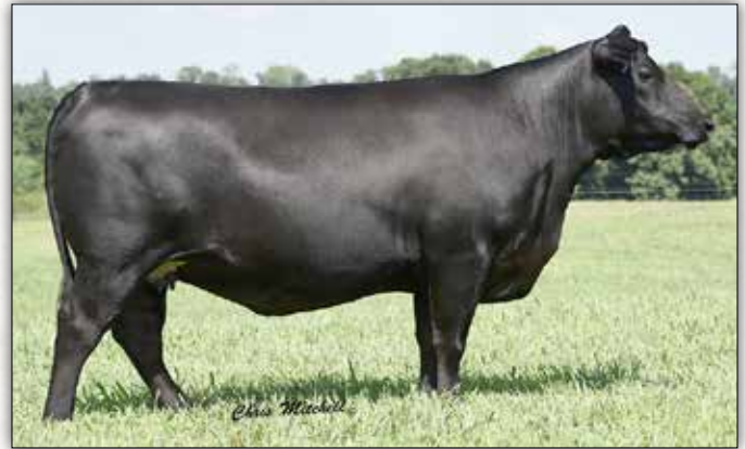
Williams Prop Erica 255 110 The maternal granddam of Lots 228 and 229.