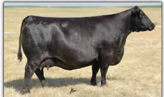
Baldrige Isabel Y69

The multi-million dollar producing dam of Lot 1.