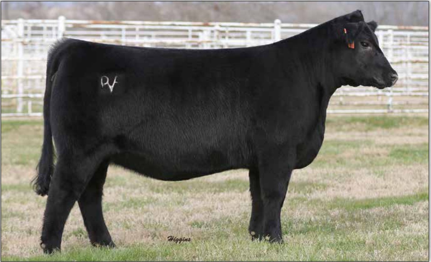
Deer Valley Rita D1144

This daughter of Woodhill Blueprint sells as Lot 5.