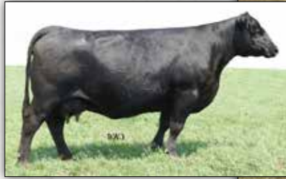
BA Lady 6807 308 The maternal granddam of Lot 22.