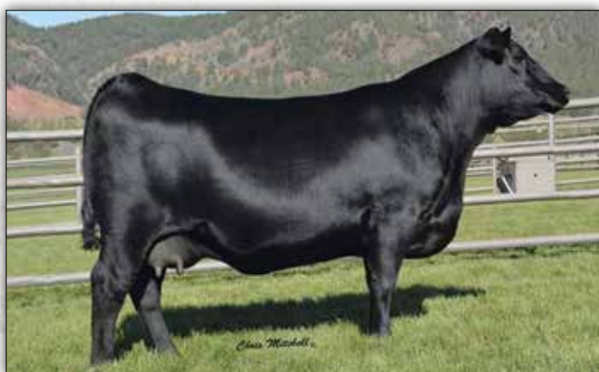
2 Bar Cash 3502 The dam of Lot 232.

This package of embryos is sired by the popular Black Magic is produced from the $35,000 HR Blackcap 6647, and the next dam is the powerful full sister to Quaker Hill Rampage 0A36 who now has twenty-eight daughters in production combining for WR 3@103.