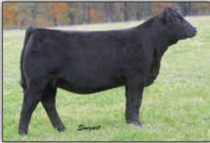
Linz May Active 2397-6004 The $57,500 dam of Lots 43A and 43B.