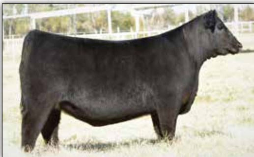
Spruce Mtn Butterfly 0073

This feature of Bases Loaded is a granddaughter of Thomas Butterfly 4742.