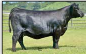
Baldridge Isabel E239

One of the breeds most influential donors and maternal grandam of Lot 35.