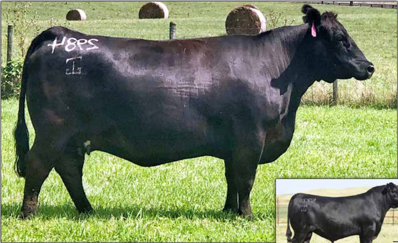
GAR Prophet 2984

The dam of GAR Inertia and also the dam of Lots 33A and 33B.