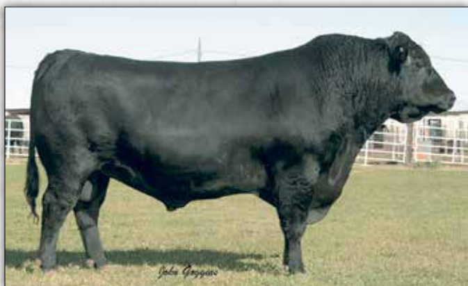
Wulffs Ext 6106