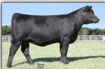
Vintage Blackcap 6073

A $55,000 maternal sister to the dam of Lot 41.