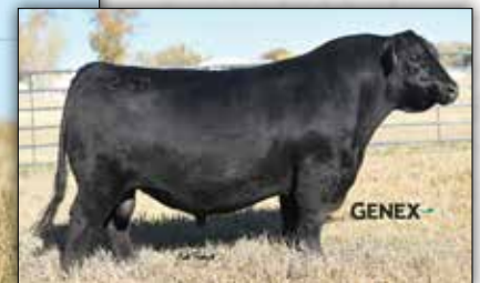
GAR Ashland A daughter sells as Lot 23.