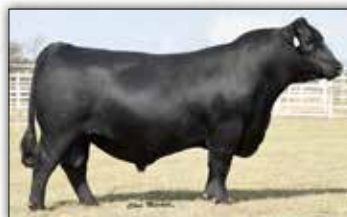
Deer Valley Citadel 8128