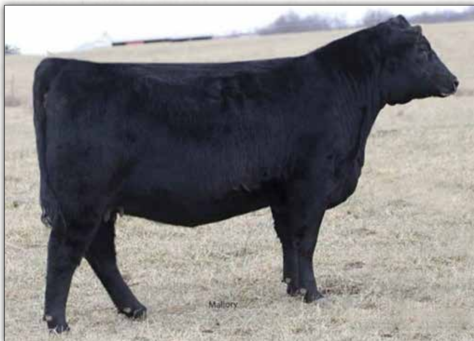
Panther CR Rita 669 The dam of Lot 104.