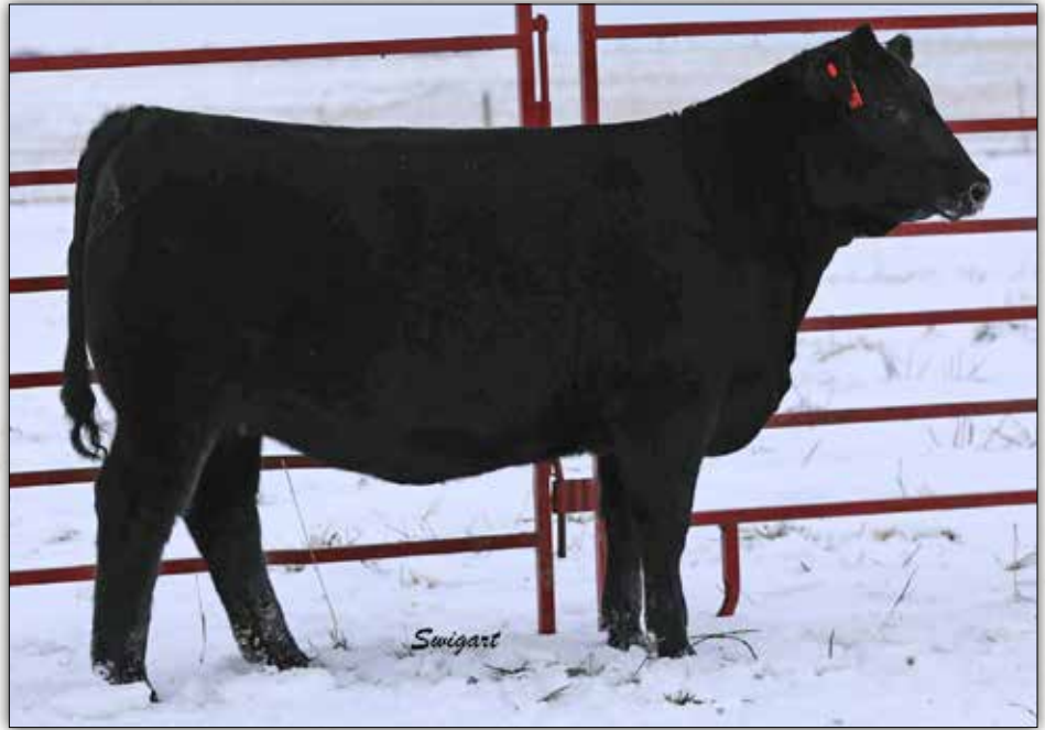
Stone Creek Onyx May 2035 She sells as Lot 43B.