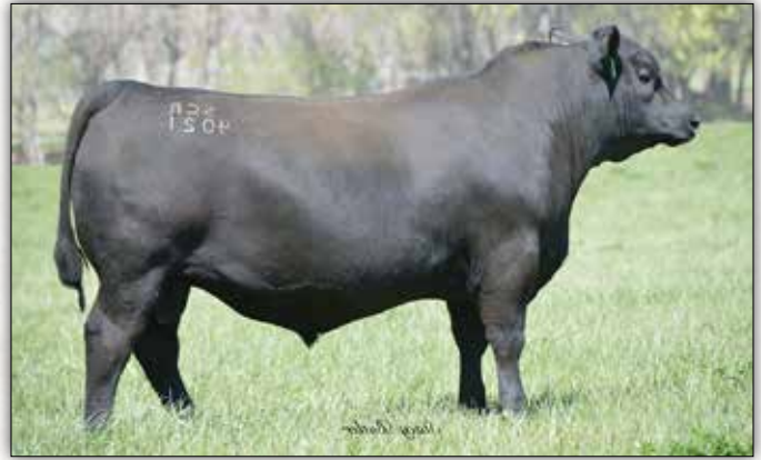
Spring Cover Reno 4021