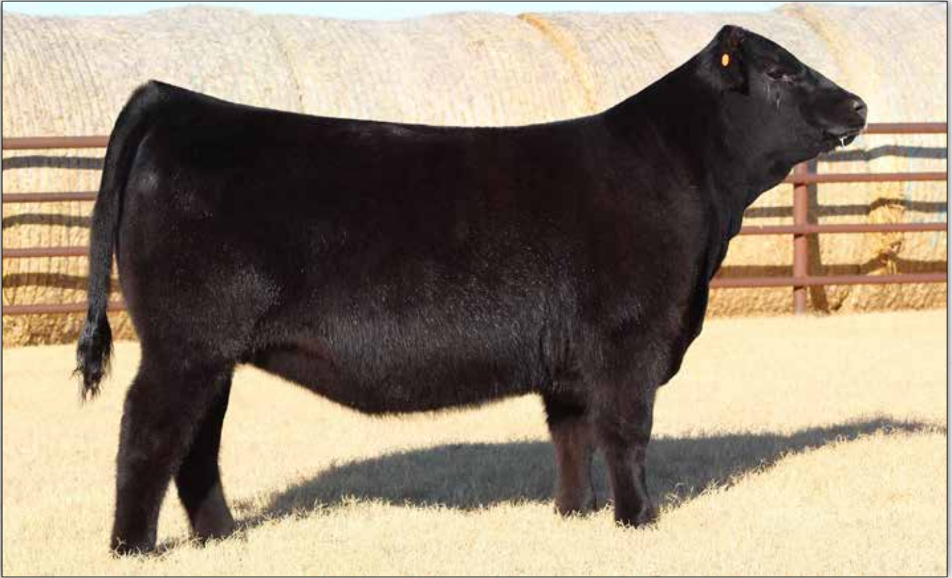
LHR Blackcap A0840-0143 She sells as Lot 30.