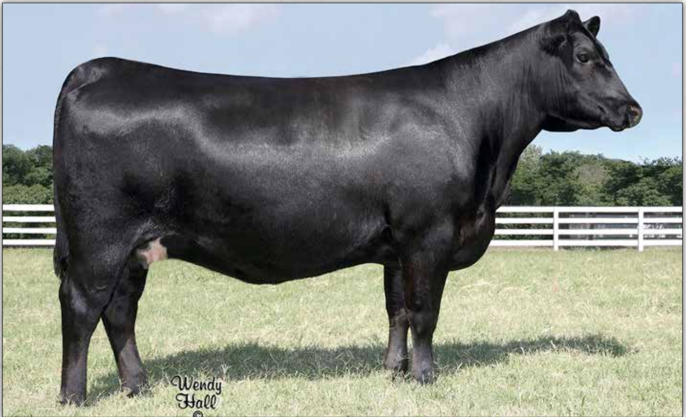
Vintage Blackcap 5417

The $120,000 one-half interest dam of Lot 41.