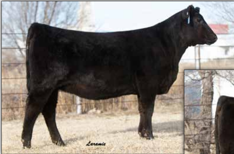
DVAR Lady 5004 009 She sells as Lot 9.