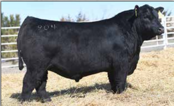
Sterling Pacific 904 This sire of Lot 26.