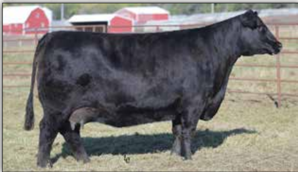
EA Primrose 5083