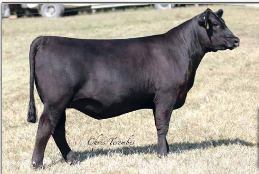
Quaker Hill Blackcap 4PT3