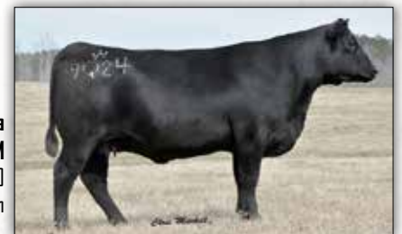
Rita 9Q24 of Rita 5F56 GHM The $28,000 maternal granddam of Lot 30.