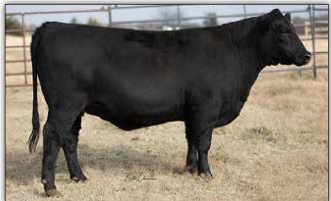
Jetset Glory 6042 The dam of Lot 222.