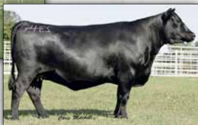
GAR Objective 2345 Her influence sells in the Lot 207 package.