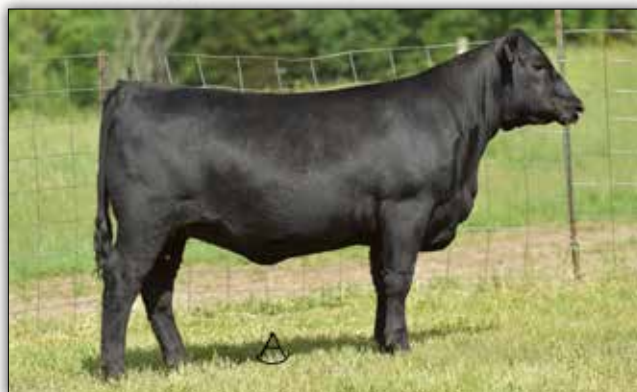
Trowbridge Elba 6100 The dam of Lots 256 and 257.