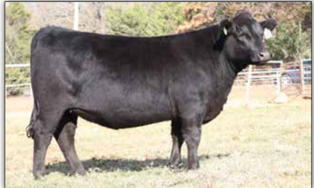
Jetset Glory 9073 The dam of Lot 221.