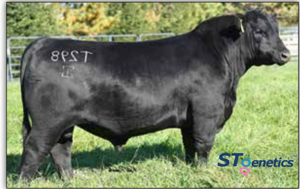
GAR Greater Good