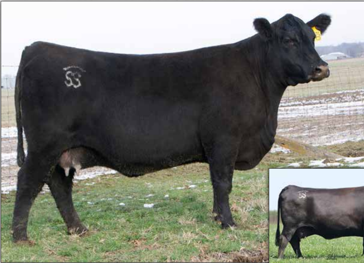
Jet S S G8

This maternal sister to S S Niagara Z29 sells as Lot 42.