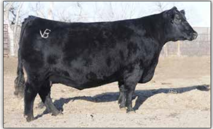
JMB Emulota 013

The influence of this powerful and proven dam of Traction sells in these embryo matings.