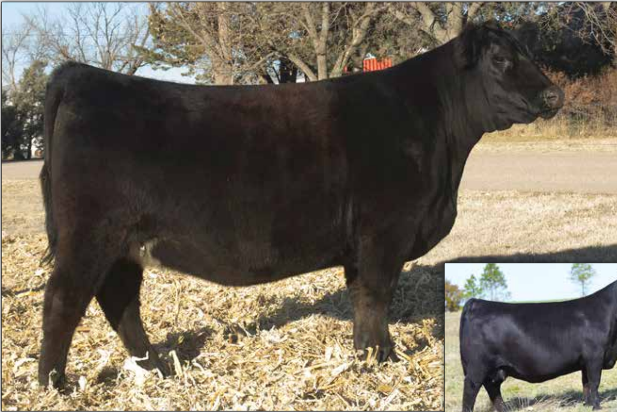
Vision Lady 950

This outstanding bred heifer sells as Lot 49.