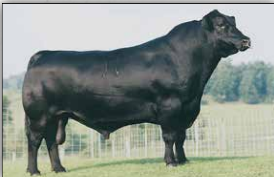
Leachman Saugahatchee 3000C