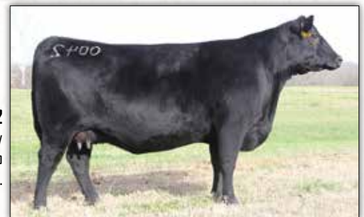
SJH Objective of 6108 0042

This $9,000 selection by Sydenstricker Angus is a maternal sister to Lot 31.