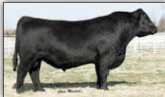
Plattemere Weigh Up K360

This member of the DVF pen bulls is a flush brother to Lot 6.