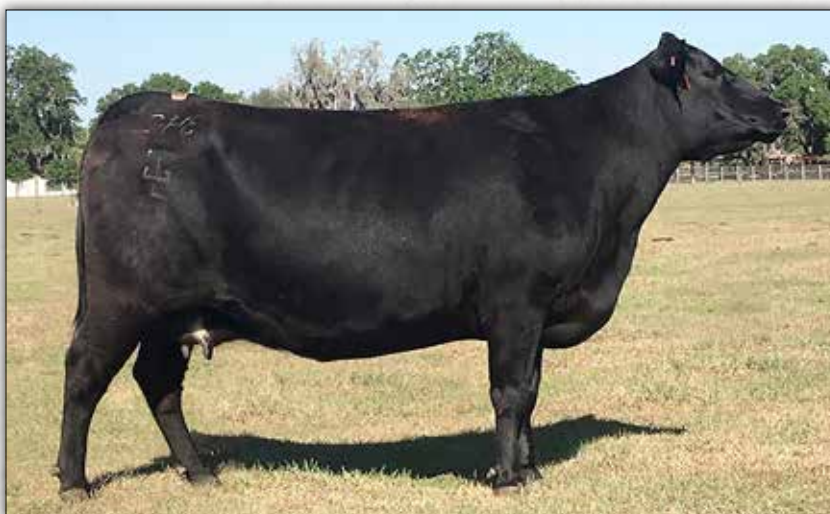
GAR Day Break 342 This proven dam of GAR Genuine is also the donor dam of Lots 225, 226 and 227.