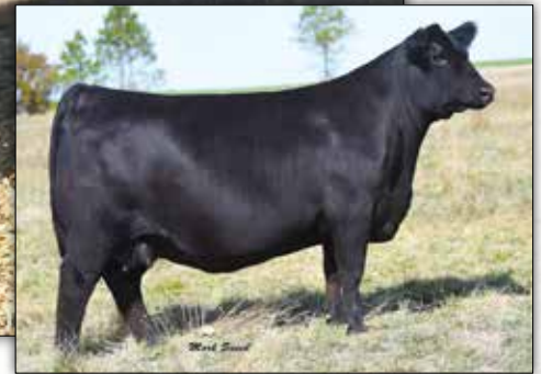
Vision Lady 432

This outstanding bred heifer sells as Lot 49.