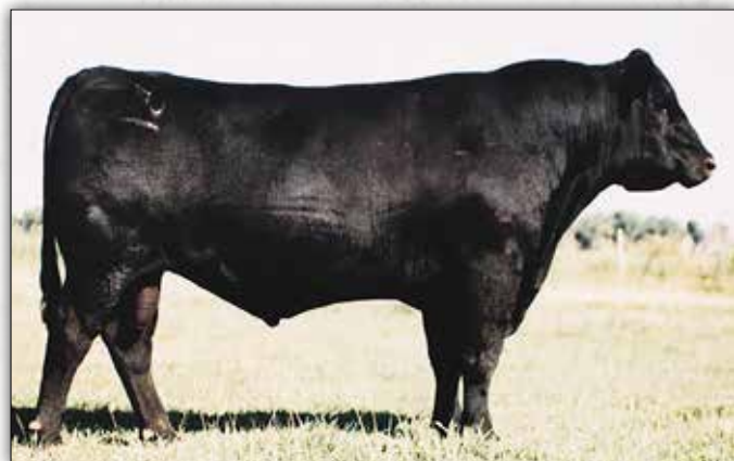
G D A R Traveler 71