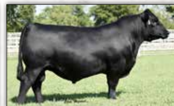
Deer Valley Ditka 81183