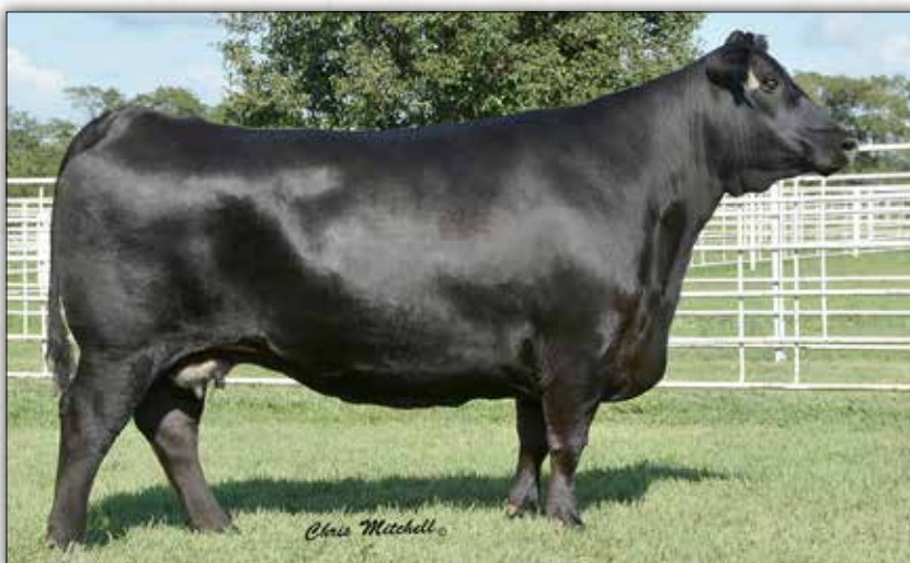
GAR Progress 830 The breed influencing maternal granddam of Lot 224.