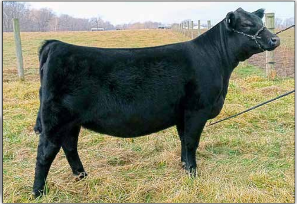
WCC Forever Lady H300 She sells as Lot 54A.