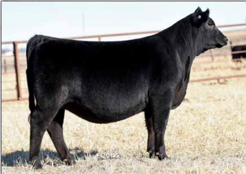
Bullerman Queen 0079 She is offered as Lot 4D.