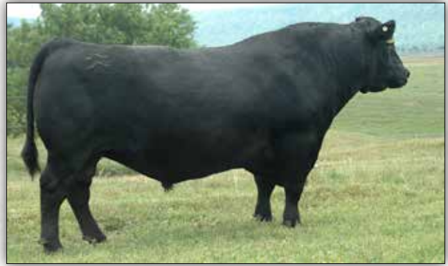
Sinclair Emulation XXP