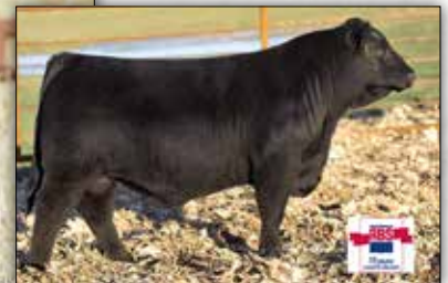
Bullerman Jackson 1560 This member of the ABS Global Stud is from the same family as Lots 4A and 4B.

• Tremendous growth and performance in this stylish daughter of 4M Ace 709 who posted a weaning ratio of 105 and is backed by a dam who is a maternal sister to the dam of Lot 4A recording WR 6@105 and YR 5@106.