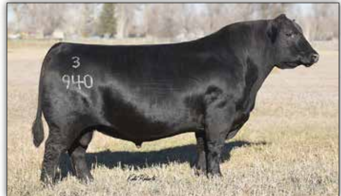
Connealy Confidence Plus