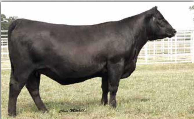
Deer Valley Rita 2164

The $65,000 one-half interest maternal granddam of Lot 17.