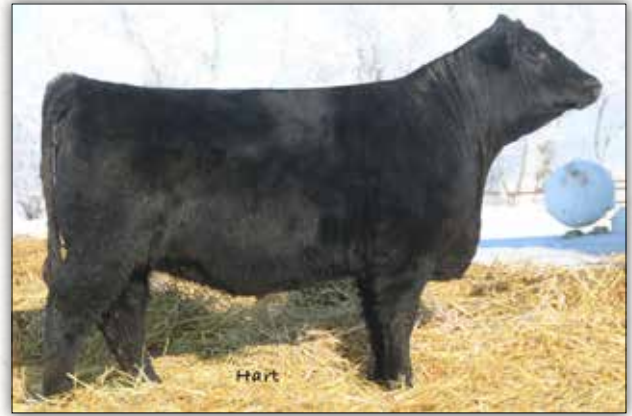
Hart Mamie 9560 The dam of Lots 208 and 209

• An embryo package blending the $140,000 ST Genetics sire Poss Rawhide with a donor sired by Jindra Acclaim, offering calving ease with extreme growth and super-solid carcass values. In addition, the maternal granddam of these embryos records WR 2@103 with %IMF 27@100 and UREA 27@101.