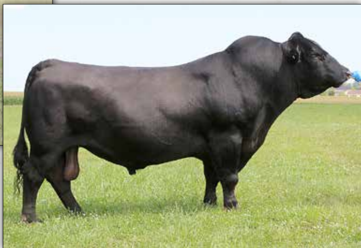
Quaker Hill Rampage 0A36

The $150,000 dam of Quaker Hill Rampage 0A36 and the foundation dam of Lot 55.