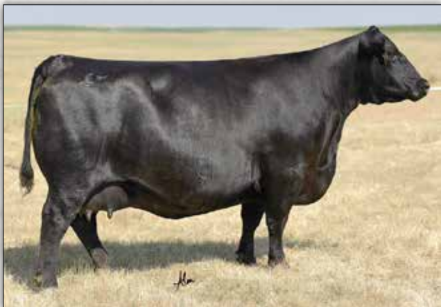
Baldridge Isabel Y69

One of the breeds most influential donors and maternal grandam of Lot 35.