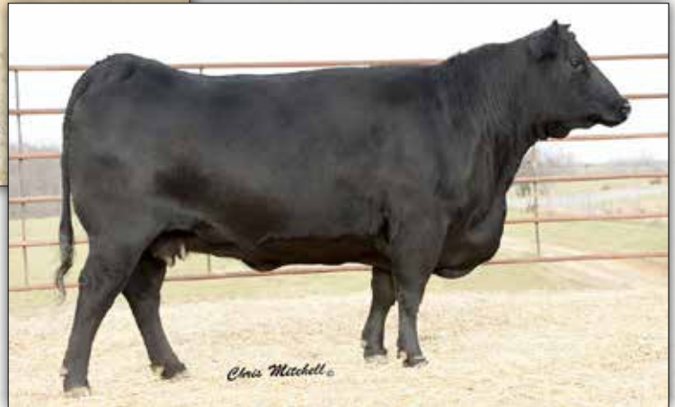
GAR 5050 New Design 1782

The $150,000 record selling female of the 2019 Foundation Female sale to Wallstreet Cattle Co. is a maternal sister to the pregnancy selling at Lot 31.