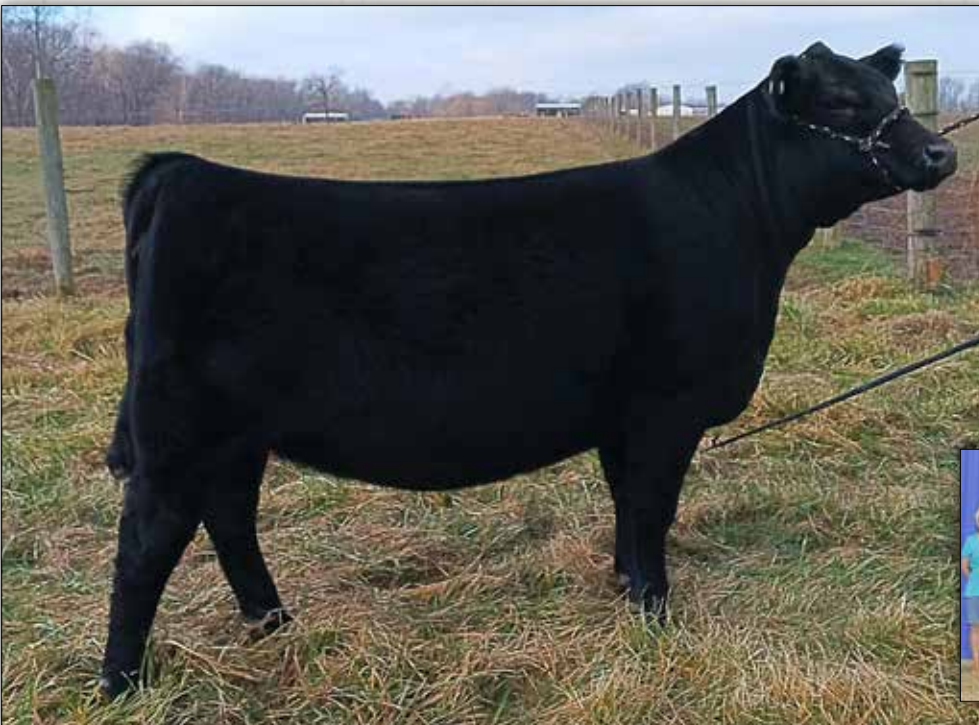
WCC Blackcap H9 This daughter of Classified sells as Lot 54D.

• This daughter of Classified will grab your attention with her length of spine and extra-long neck and overall correctness. • Her dam is the past Indiana State Fair Reserve Senior Heifer Calf Champion and weaned her first calf with a ratio of 113, and her next dam is the past Fort Worth Grand Champion WCC Blackcap W181 who in turn produced the $24,000 top-selling heifer of a past WCC sale.