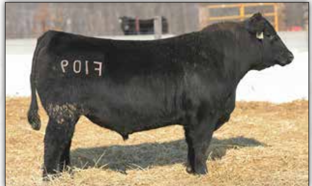
Woodhill Relevance F109 The extremely rare and valuable sire of Lot 26A.