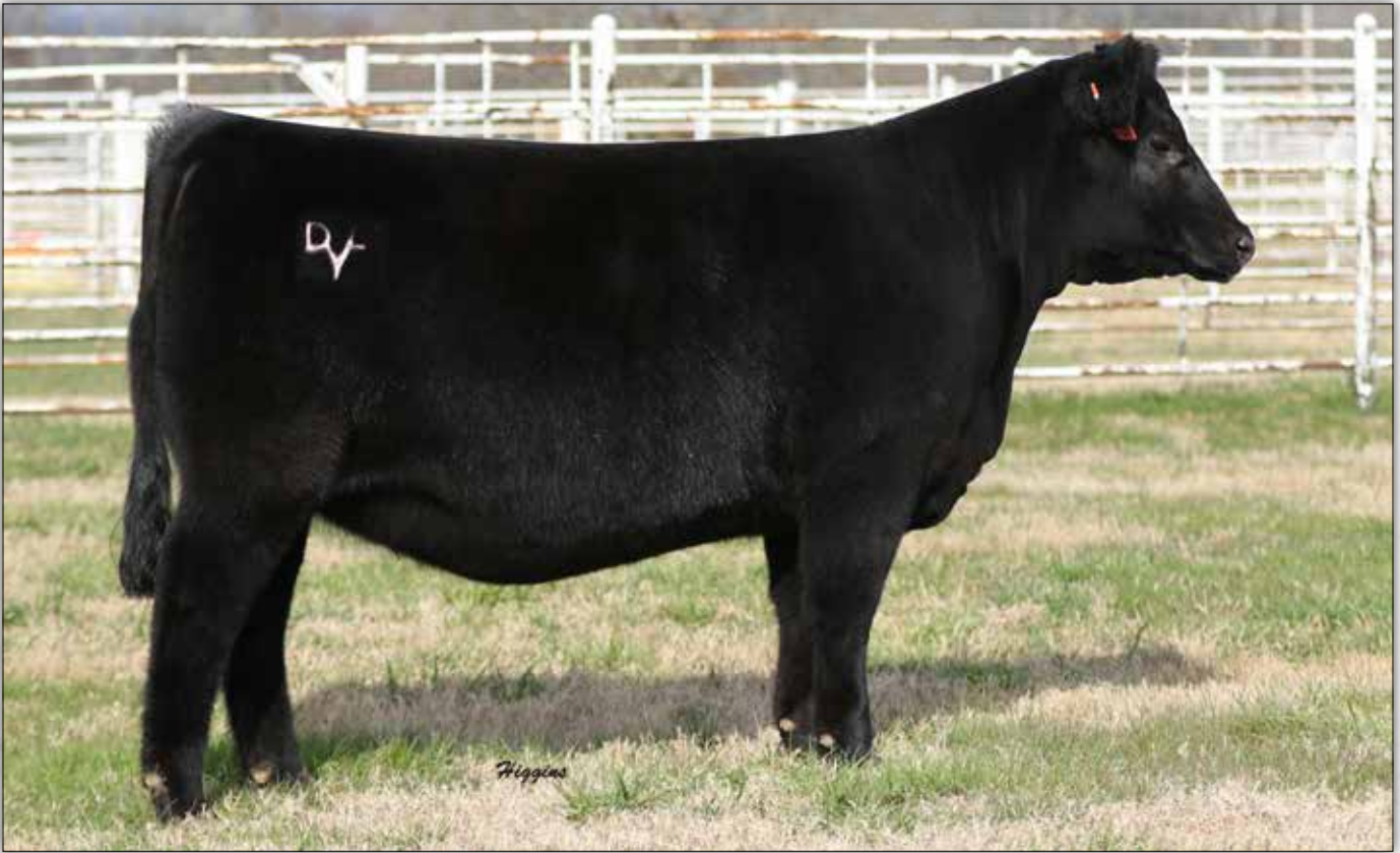
Deer Valley Barbara 01152

This excellent daughter of Deer Valley Growth Fund sells as Lot 6.