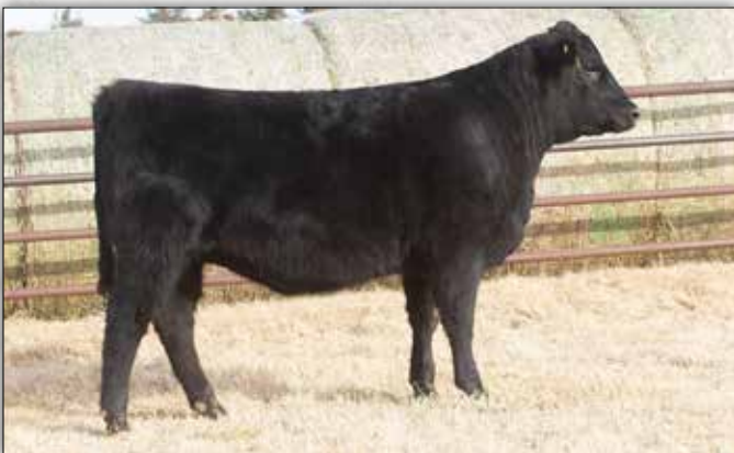
LHR Blackcap A0840-7953

This $20,000 selection of Katie Colin Farm in the Spring 2020 LHR sale is a maternal sister to Lot 30.