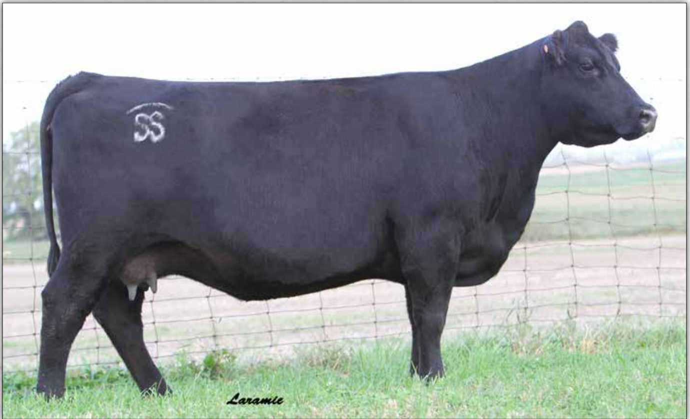
Lucy S S B60 She sells as Lot 52.