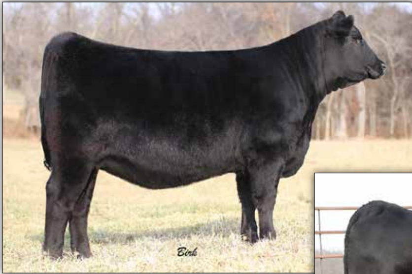
Bar Rita 7706-N68

The $150,000 record selling female of the 2019 Foundation Female sale to Wallstreet Cattle Co. is a maternal sister to the pregnancy selling at Lot 31.