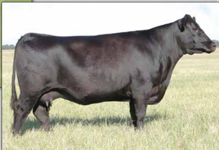
Wilks Blackcap 0D82

This popular and proven AI sire is a full brother to the dam of Lot 55.