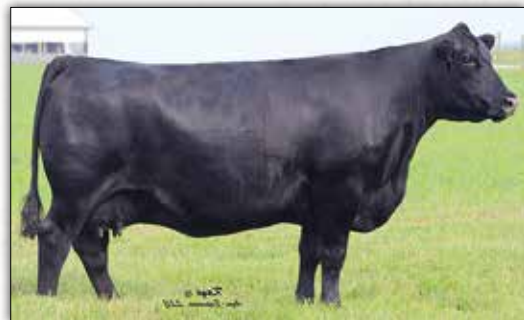
Thomas Butter Fly 21042

This feature of Bases Loaded is a granddaughter of Thomas Butterfly 4742.