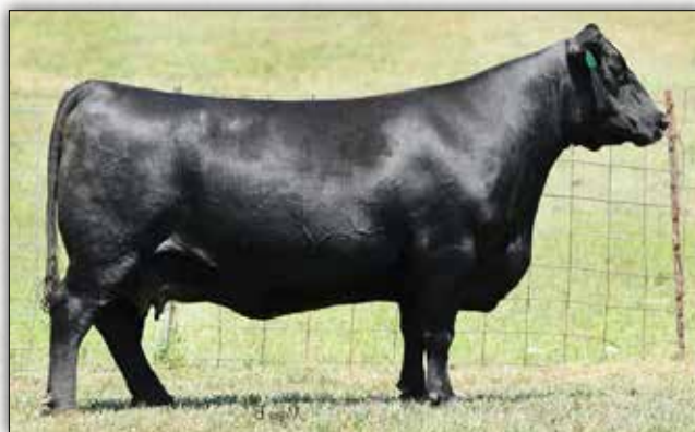
Trowbridge Lady Jaye 597 A maternal sister to the dam of Lot 255.