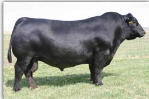
SAV Net Worth 4200