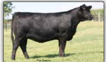
Myers Isabel M429

The $160,000 one-half interest full sister to Baldridge Isabel E358.