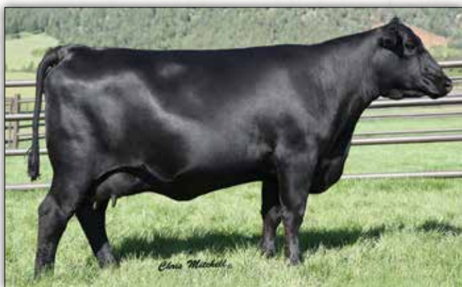
HR Blackcap 6647 The donor dam of Lot 231.