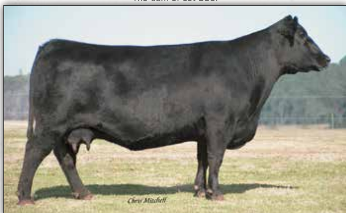
GAR EXT 2114 The $120,000 valued maternal granddam of Lot 206.