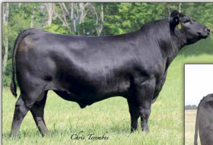
QHF WWA Black Onyx 5Q11

This popular and proven AI sire is a full brother to the dam of Lot 55.