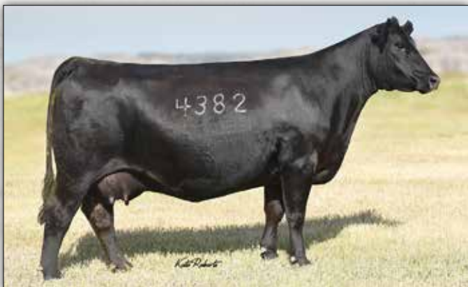
KR Lady May 4382

The $50,000, second high selling female of the Krebs Angus dispersal and maternal sister to Lot 37.