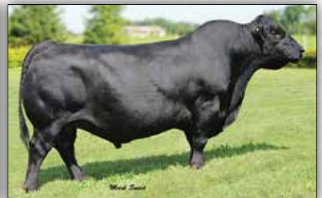
S A V Final Answer 0035