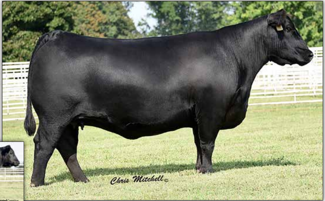
Deer Valley Rita 3166

The dam of Deer Valley Balance 6169 and maternal granddam of Lot 46.