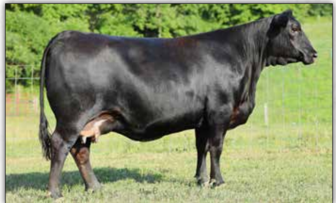
Trowbridge Emulota 844 This daughter of Ellingson Homestead 6030 is the dam of Lot 250.