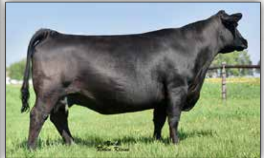
Bullerman Queen 1456 The dam of Lot 4D.