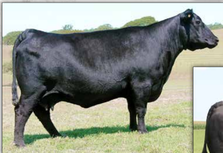
QHF Blackcap 6E2 of 4V16 4355

This full sister to Quaker Hill Rampage is the maternal granddam of Lot 55.