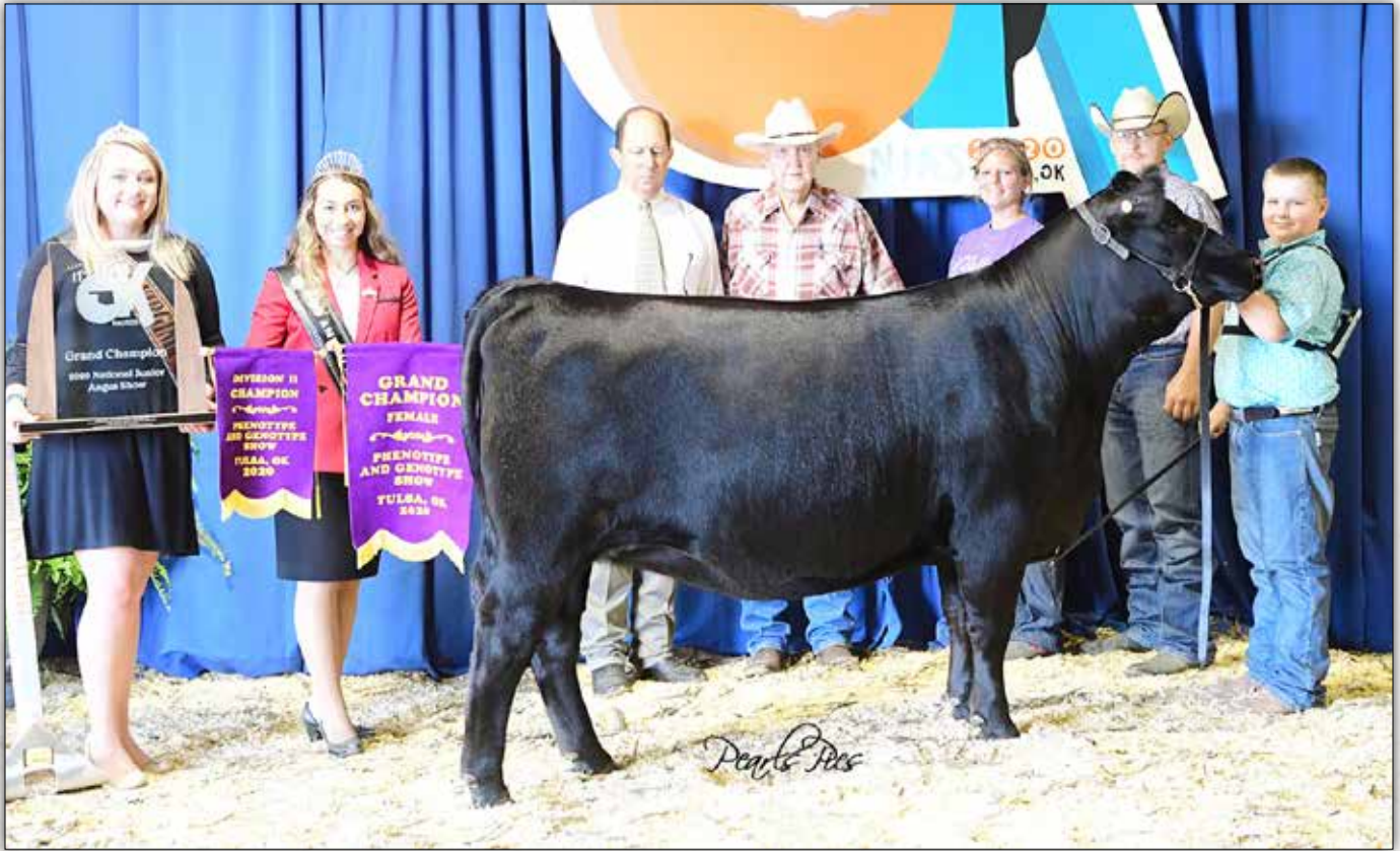
Long Lucy 909

This 2020 National Junior Angus Show Grand Champion PGS Female is a maternal sister to the embryos selling as Lot 32.