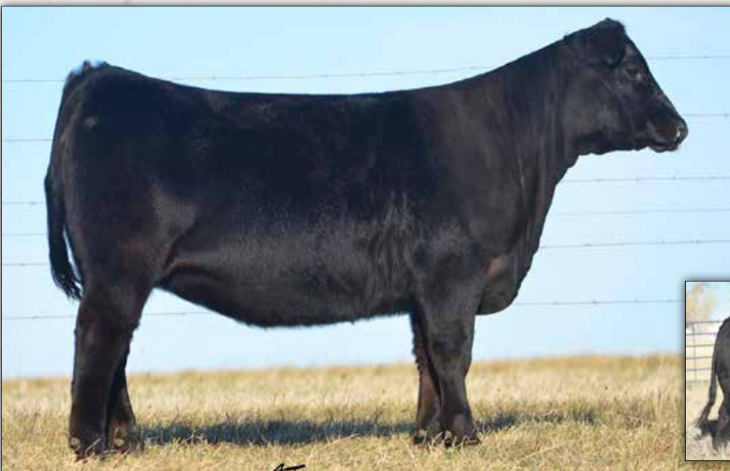
Gaffney Prideva 02 This daughter of GAR Ashland sells as Lot 23.