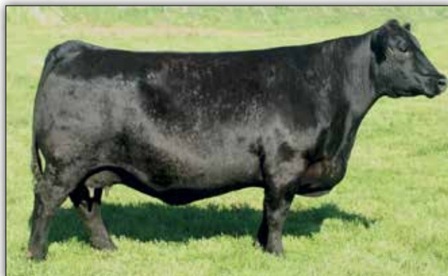
Frosty Answer 3979 This long time Trowbridge Farms and Scheifelbein donor is the maternal granddam of Lots 256 and 257.

DVAuction Broadcasting Real-Time Auctions www.dvauction.com