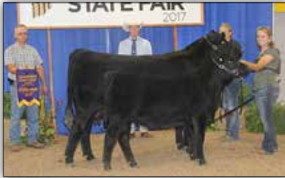
WCC Forever Lady C22 The many times champion dam of Lots 54A, 54B and 54C.