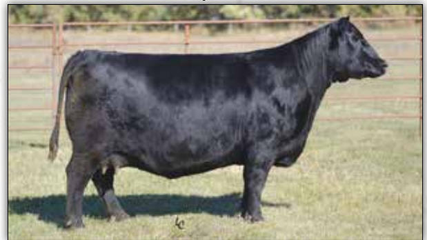
EA Blacklass 4024