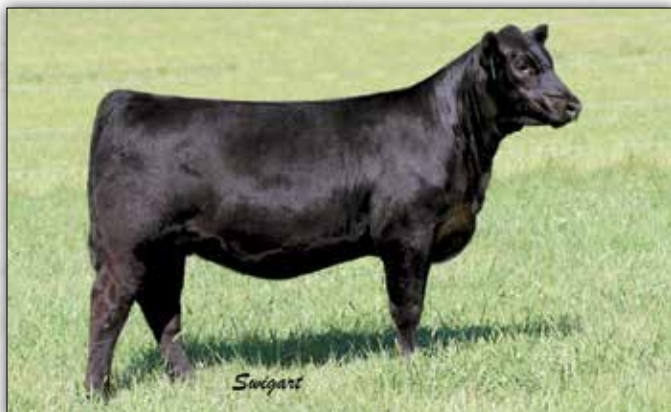
Pasture View Lady B501

The $50,000 one-half interest dam of Lot 21.