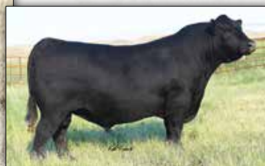
EXAR Stallion 7986

The $200,000 one-half interest sire of Lot 20.