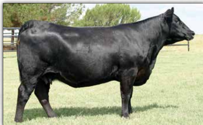
ACR Henrietta Pride 4137

Several embryo packages sell from this rare sire.