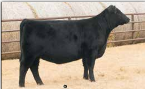
LHR-BAR Rita 1682-7222

The $475,000 one-half interest record selling sire of Lot 31.