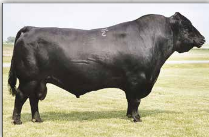
Sitz Traveler 8180