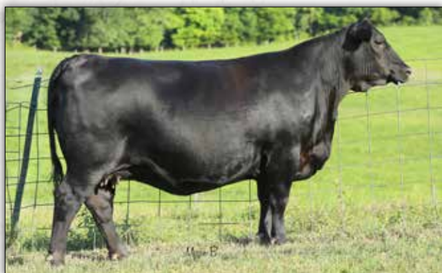
Trowbridge Rita 842

This impressive daughter of Connealy Thunder is the dam of Lot 253.