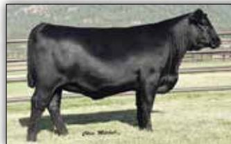
Baldridge Isabel E257

This $640,000 valued maternal sister to Baldridge Isabel E358.