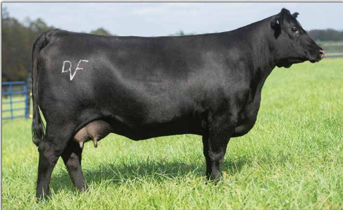
Deer Valley Rita 87150 The dam of Lots 2A and 2B.