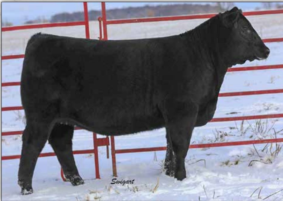
Stone Creek Onyx May 2031 She sells as Lot 43A.