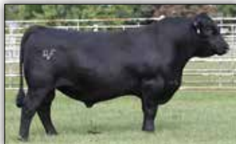
Deer Valley Blue Steel 9310