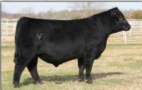
Deer Valley Growth Fund 01156

This member of the DVF pen bulls is a flush brother to Lot 6.