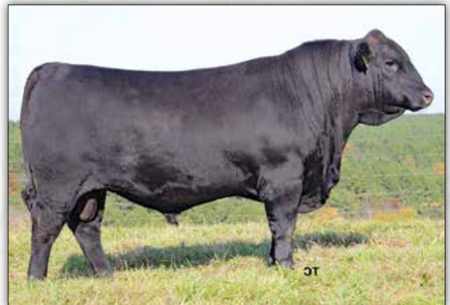
KCF Bennett Summation

This $67,500 son of Thomas Patricia 9705 is a member of the Katie Colin Farm herd sire line up.