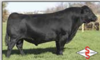
KCF Bennett Fortress