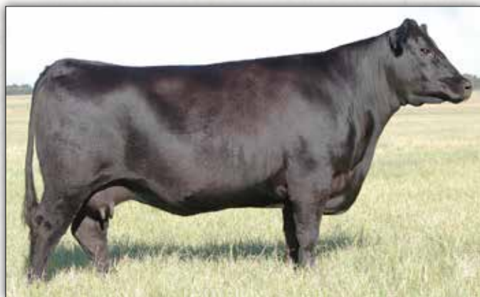
Wilks Blackcap OD82

This $25,000 full sister to Quaker Hill Rampage DA36 is the dam of Lots 234, 235 and 236.