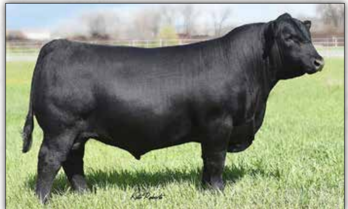
Musgrave 316 Stunner

One of his top daughters sells as Lot 50.