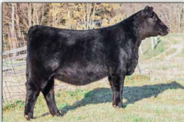
Trowbridge Emulota 744

This full sister to Traction is the dam of Lot 251 and 252.