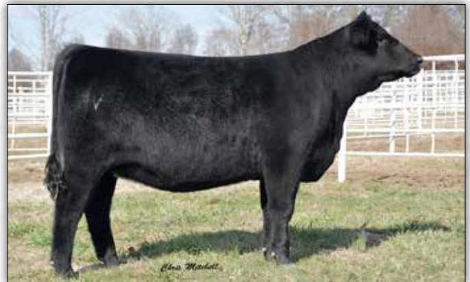
Deer Valley Rita 3167

This very popular Select Sires AI sire and featured Deer Valley Farm herd sire is also the sire of Lot 5.