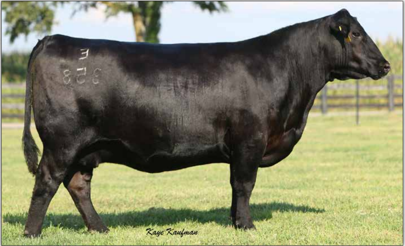
Baldridge Isabel E358