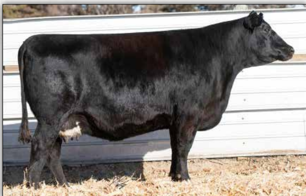
B/R Blackcap Empress 1053

The highly productive maternal grandam of Lot 48.