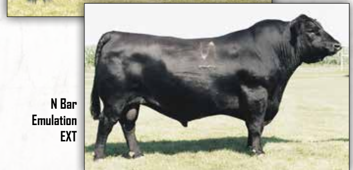
N Bar Emulation EXT