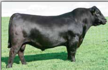
S A V Bismarck 5682