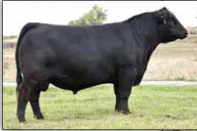
Poss Maverick The sire of Lots 4A and 4C.