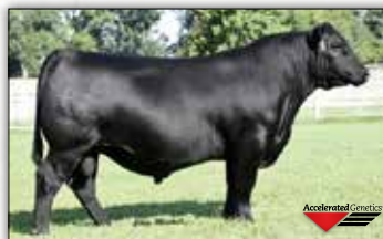
Deer Valley Brigade 81247