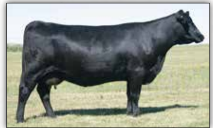
SAV May 2397 The Pathfinder maternal granddam of Lots 43A and 43B.