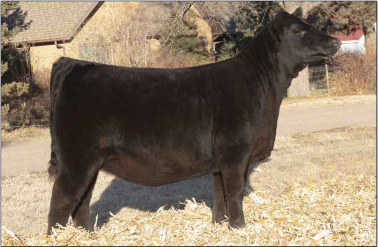
Vision Miss 065

This daughter of Stunner sells as Lot 50.