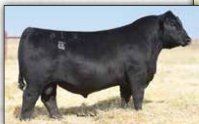
E&B Plus One The sire of Lot 19.

The $100,000 one-half interest dam of Lot 19.