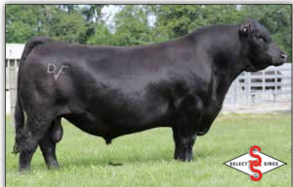
Deer Valley Growth Fund

The foundation dam of Lot 9 and member of one of the most prominent cow families from the Benoit program.