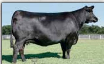
EXAR New Design 4212

The $171,000 maternal granddam of Vintage Blackcap 5417.