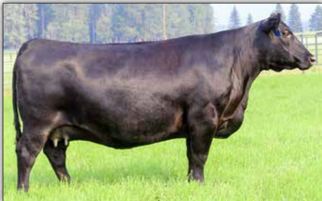
Chimney Top UPW Rita Y44

This member of the Montana Ranch donor line up is a full sister to the maternal granddam of Lot 24.