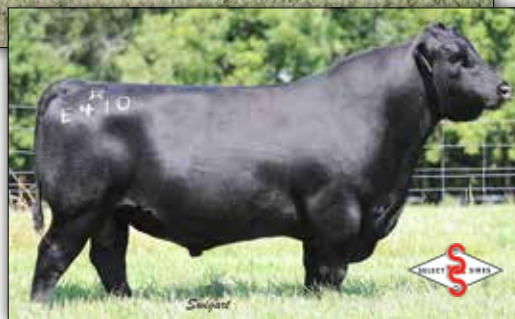
Tehama Bonanza E410

This dam of Tehama Bonanza E410 is also the dam of Lot 201.