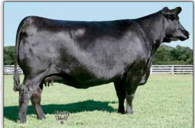
EXAR New Design 4212 The foundation dam of Lot 214.