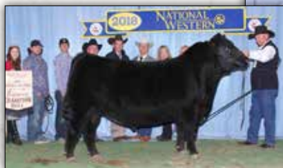
Silveiras Insight 6305 The sire of Lot 44.