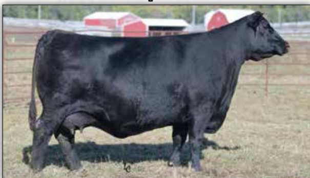
EA Queen Dolly 3246