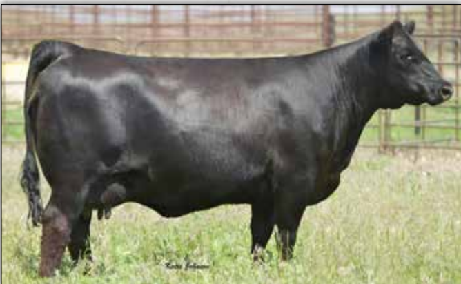
WK Miss 2305