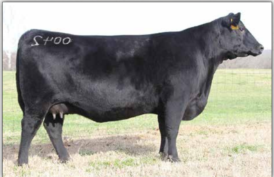
SJH Objective of 6108 0042