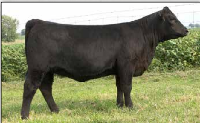
Lucy SS H32 A daughter of Lot 52.