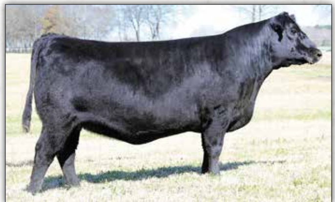
Dean's Queenie X104 The maternal granddam of Lot 230 recording %IMF 17@100 and UREA 17@101.