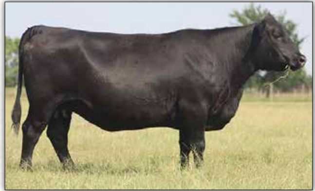
R B Blackcap 212 The dam of Lot 220.