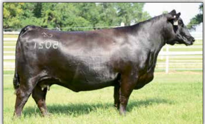
Cox Y03S Rita 5021