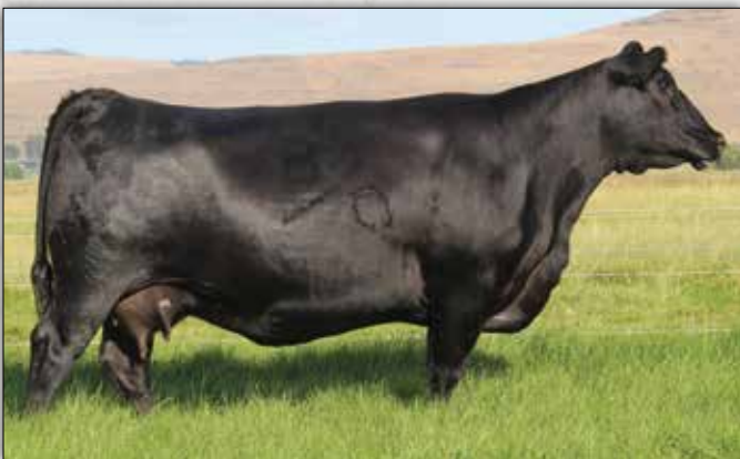
Coleman Donna 2225 The dam of Lot 248.