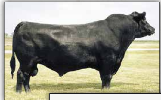
Leachman Right Time