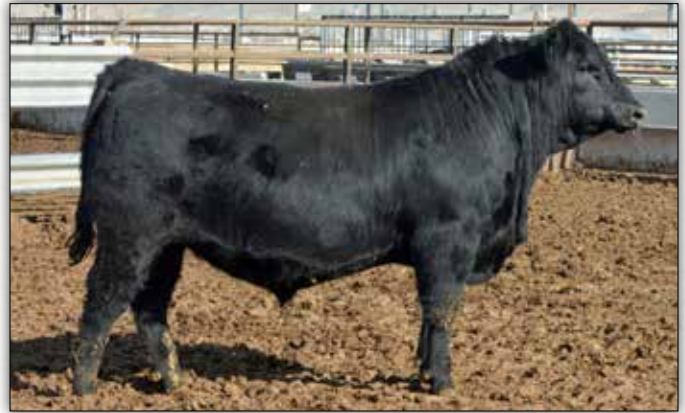
Sterling Advantage 809