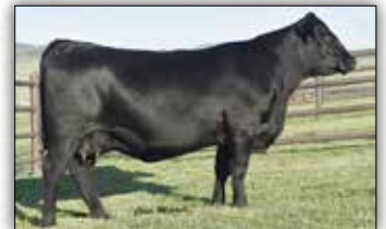
Baldridge Isabel C235

The $104,000 valued full sister to Baldridge Isabel E358.