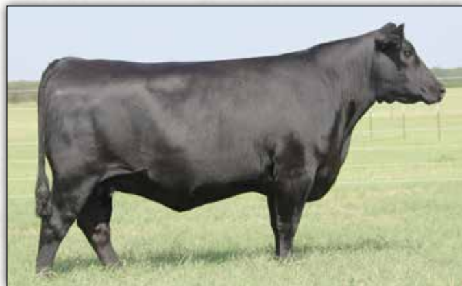
Wilks Blackcap 2V72

This $25,000 full sister to Quaker Hill Rampage DA36 is the dam of Lots 234, 235 and 236.