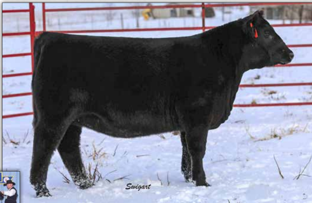
Stone Creek Sandy 2021 She sells as Lot 44.