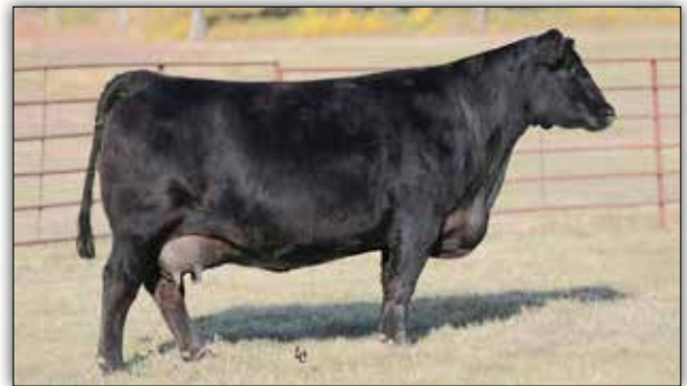
EA Emblynette 5365