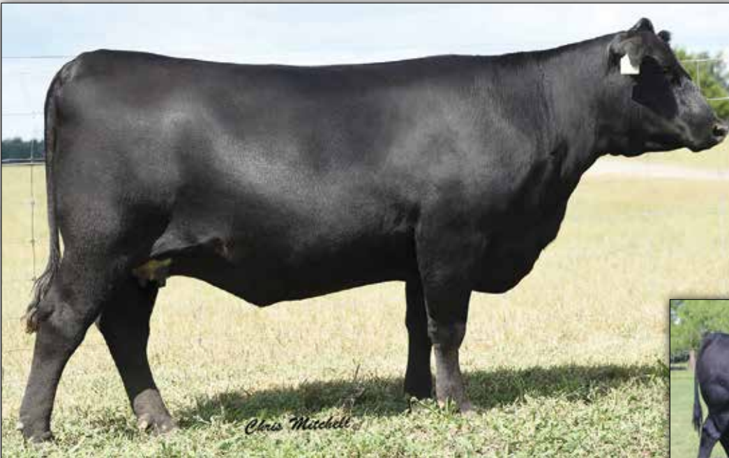
EWA 6121 of 3128 Sure Fire The dam of Lot 40.