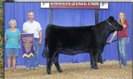
WCC Blackcap B114 The dam of Lot 54D.

• This daughter of Classified will grab your attention with her length of spine and extra-long neck and overall correctness. • Her dam is the past Indiana State Fair Reserve Senior Heifer Calf Champion and weaned her first calf with a ratio of 113, and her next dam is the past Fort Worth Grand Champion WCC Blackcap W181 who in turn produced the $24,000 top-selling heifer of a past WCC sale.