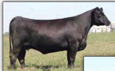
Jet S S A99

This extremely popular Select Sires AI sire is a maternal brother to Lot 42.