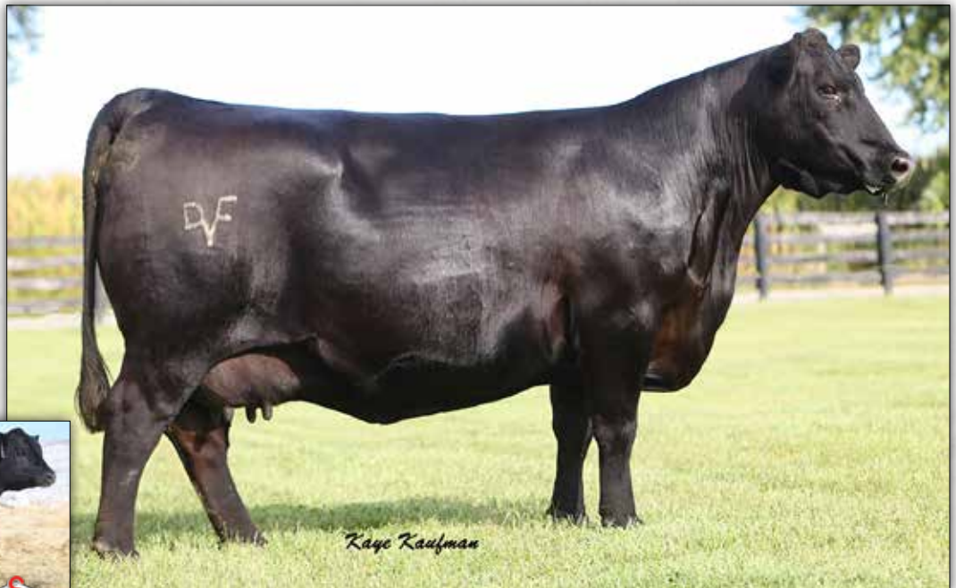
Deer Valley Blackbird 31120

This phenomenal daughter of Connealy Impression is the dam of Lot 47.