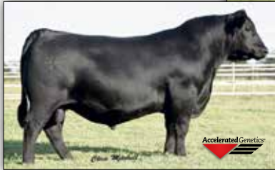
Deer Valley Balance 6169

The dam of Deer Valley Balance 6169 and maternal granddam of Lot 46.