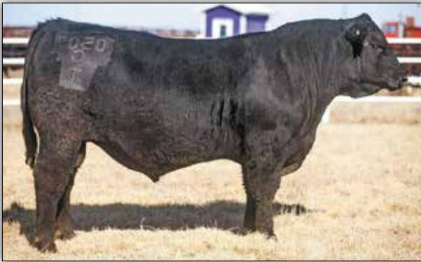
GAR Set Apart

This heavily used AI sire is a maternal brother to Lots 33A and 33B.