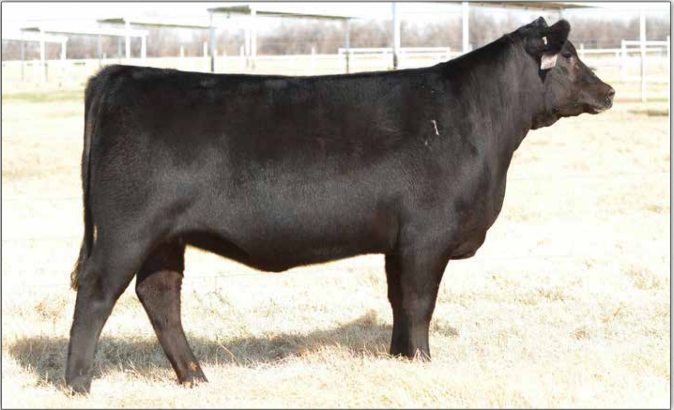
EXAR Rita 0132 She sells as Lot 17.