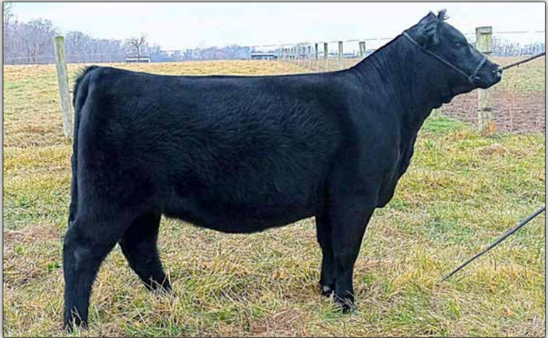
WCC Forever Lady H3 She sells as Lot 54C.

• This flush sister to Lots 54A and 54B is a stout made, big-boned, thick-topped heifer that still possesses the right amount of femininity to be competitive and has a pedigree that has proven to be successful as she, too, is a direct daughter of the $22,000 WCC Forever Lady C22.