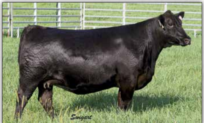
PVA Lady Standard Z501

The $50,000 one-half interest dam of Lot 21.