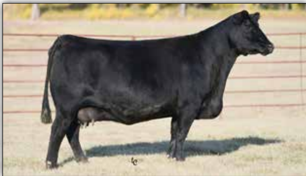
EA Abigale 6207