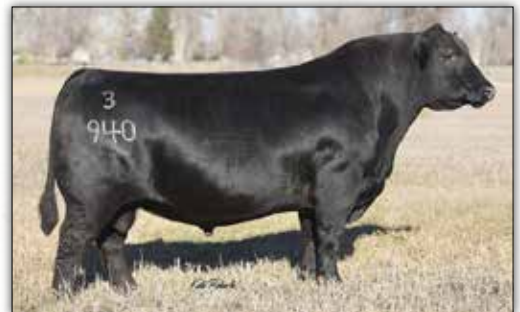
Connealy Confidence Plus The sire of Lot 229.