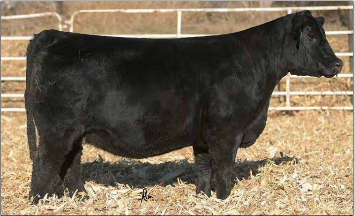
Baldrige Isabel G067

This direct daughter of Baldrige Isabel Y69 sells as Lot 1.