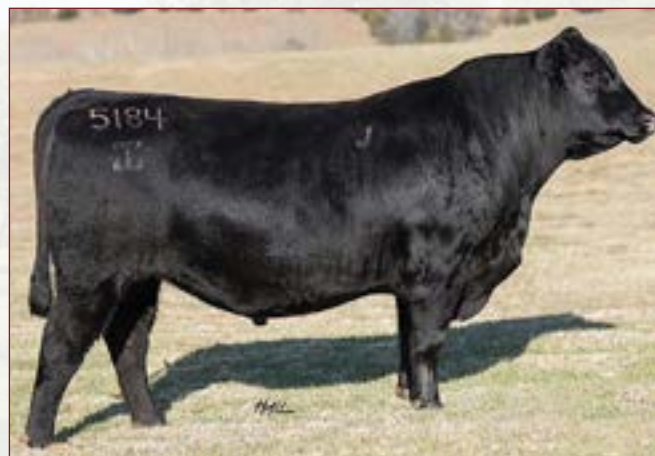
GAR Storm - Sire of Lot 17.

The Storm daughter stems from the powerful S701 donor who in her day was one of the most captivating females you could find. 915 does not disappoint from a phenotype standpoint and excels from a genomic, ranking in the top 1% of current non-parent females for WW, YW, CW, $F, $B and makes the top 5% for $C.