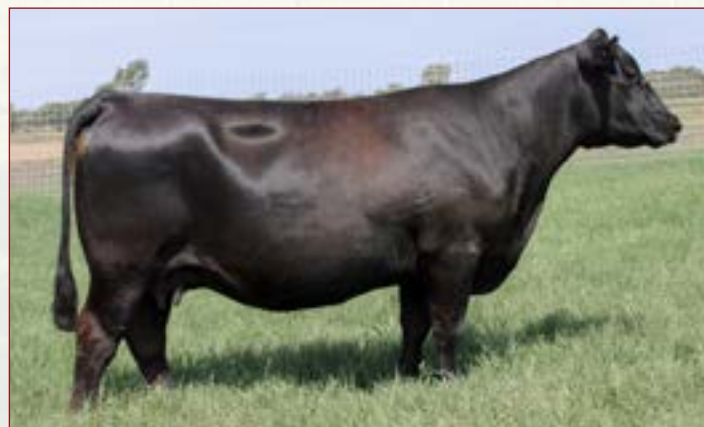
EF Rita 6564 - Lot 48

Owned by Schaefer Angus This Rampage daughter stems back to the donor female FWY 7229 that is working for Evan Farms and she is the daughter of the Rita 9K2 that brought $35,000 and sold to Byrd Cattle Co. She has plenty of power and performance to match her in real life. You must admire the true power and shape she processes and be that feminine and maternal in her appearance. AI on 4/25/20 to GAR Set Apart. Safe to AI date. PE to CoX Hi-Tech 8049 & 2 Bar Combination 6581 from 5/25/20 to 7/6/20.