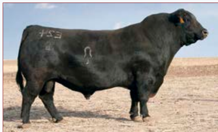
GAR-EGL Protège - Sire of Lot 46.

Owned by Schaefer Angus With a genetic profile that reads with enormous WW and YW performance. She ranks in the top 1% for CW and $B top 2$ for CW and in the top 4% for $C. This Protégé daughter traces back to a highly productive cow family from the R. A. Brown Ranch. AI on 5/17/20 to SS Enforcer E812. Safe to AI date. PE to CoX Hi-Tech 8049 & 2 Bar Combination 6581 from 5/25/20 to 7/6/20.