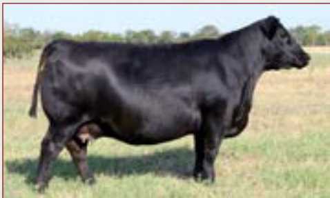
EXAR Blackcap 4349 - Dam of Lot 9A.

Owned by Zybach Ranch An own daughter of the top-selling female in the 2019 Top Notch Sale is this beautiful, powerful made daughter of Black Magic. This female exhibits a massive growth curve that ranks her in the top 1% WW, YW as well as the top 1% for both $C and $B EPDs yet still maintains the top 1% for Marbling EPDs. Don't overlook this one.