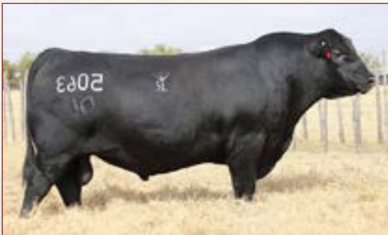
Bar R Jet Black 5063 - Sire of Lots 83 and 84.

This super impressive Jet Black daughter is blessed with breed topping performance ranking in the top 1% for WW, YW and top 3% for $B, CW and REA. She will make a wonderful cow that doesn't sacrifice carcass value and performance. AI 4/25/20 to Thomas Edison 6764. Safe to AI date. PE from 5/19/20 to 7/8/20 to 2 Bar Payweight 7507 & SF Ashland 8164.