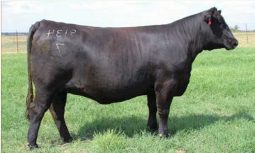
Zebo Lori 9134 - Lot 29