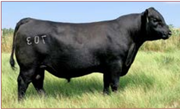
STEG Generation 703 - Reference Sire C