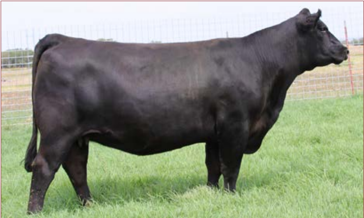
EF Lady 8493 - Lot 57