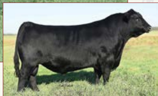
MGR Treasure - Sire of Lots 108 and 109.