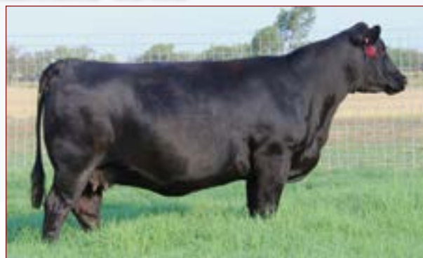
MJM Lady COMPLEMENT475 - Lot 67

AI on 12/20/19 to Byergo Black Magic 3348; PE from 1/12/20 to 2/8/20 to Springfield Sure Fire 7110.