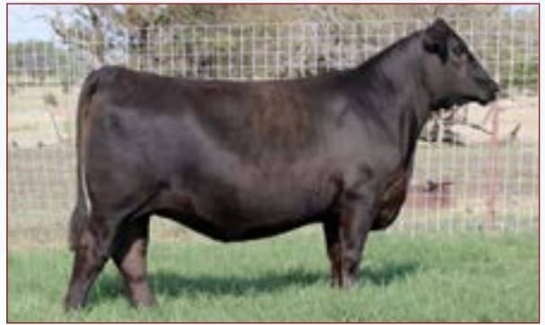
Zebo Blackclass 9168 - Lot 85

AI on 4/22/20 to Big K/WSC Ironhorse 0255; PE from 4/25/20 to 7/17/20 to Gabriel Monumental 8414.