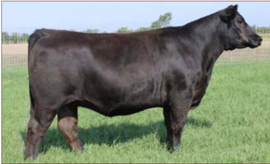
Zebo Lucy 9302 - Lot 14