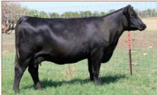
Dean's Queenie E027 - Lot 43

Owned by Zybach Ranch This Inertia daughter has everything going her way. Top 1% for $B, $C and Marb. Her ability to produce excellent carcass merit while maintaining powerful growth. She ranks in the top 3% for YW and CW. Good feet and legs that will last for the long haul.