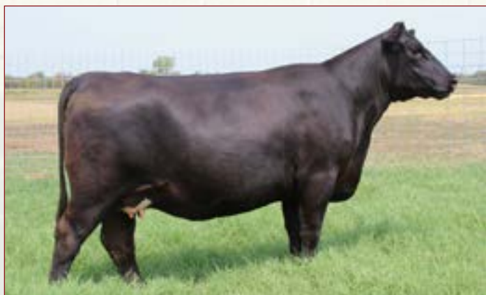
EXAR Blackcap 8671 - Lot 53

Owned by 7H Angus Big, stout, fall calving heifer with more natural muscle and presence about her. A "no holes" EPD profile that is loaded with carcass value and performance. Ranks in the top 3% for YW and $B plus the top 5% for Marb and $C. On her dam's side she traces back to the legendary donor Blackcap R265. AI 1/31/20 to EXAR Stallion 7986. Safe in calf.