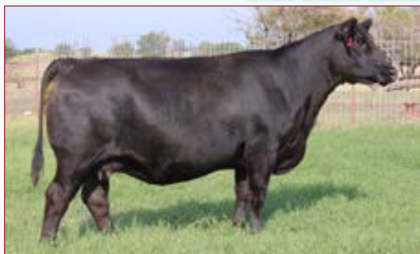
2 Bar Storm 7570 - Lot 64