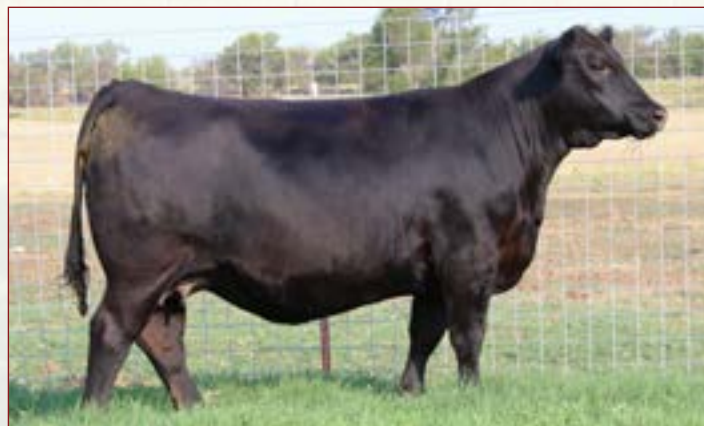
R B Blackcap 847 - Lot 76

Sells with a heifer calf born 9/11/20 sired by SydGen Enhance, dam is 5250 (Reg#18531231), tattoo 215. BW 65 lbs.