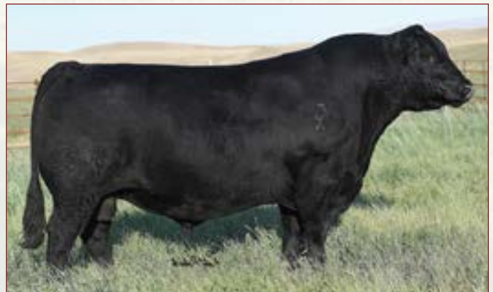
EXAR Monumental 6056B - Sire of Lots 27-31.

AI on 4/6/20 to Huwa Full Disclosure; PE 6/2/20 to 8/10/20 to 3F Epic 7401.