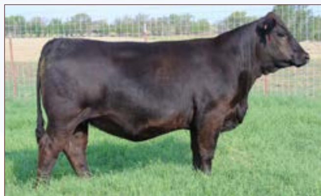
Zebo Rita 921 - Lot 16

A bold made, big ribbed Inertia daughter that traces back to the dam of the popular Hi-Tech. This one is loaded with marbling, in check from a $EN standpoint and ranks in the top 10% of current non-parent females for WW, YW, Marbling, $G, $B and $C. If you are looking for an easy keeper with a pedigree and no holes EPD profile, this is your gal.