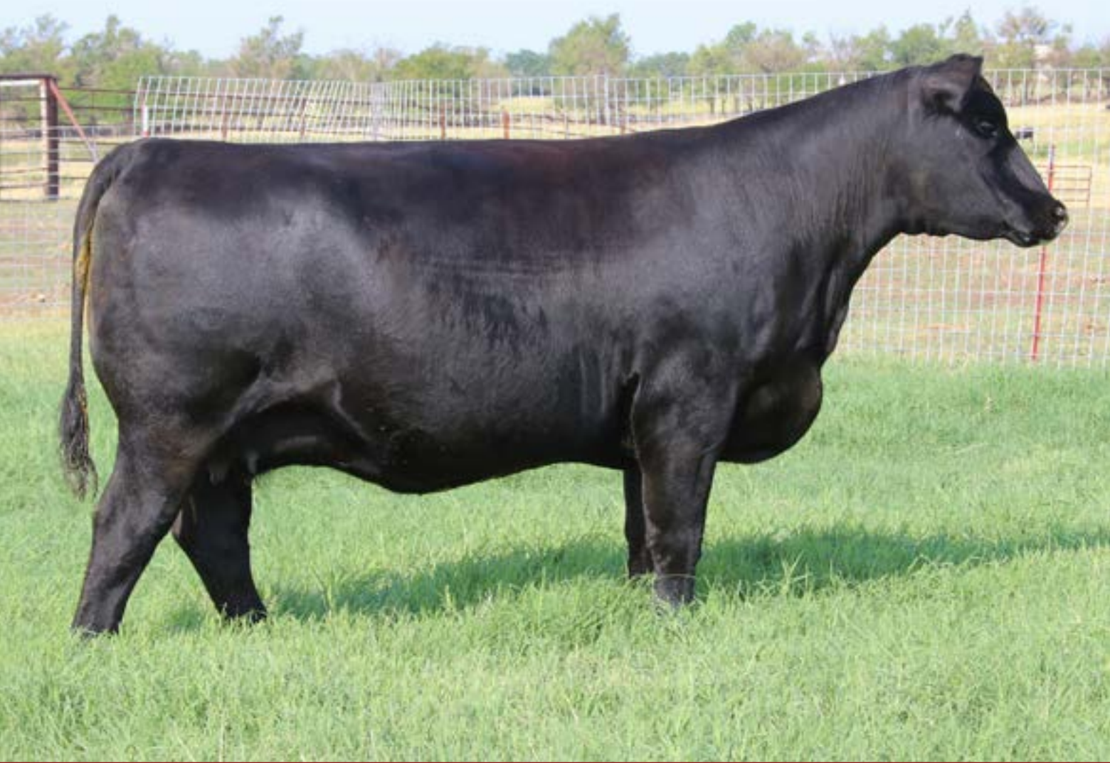
Zebo Queen 725 - Lot 62