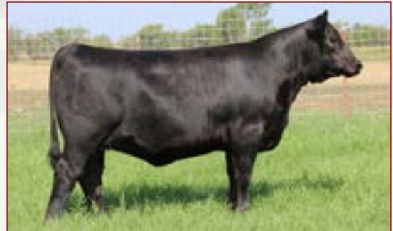
Zebo Pride 206 - Lot 40A