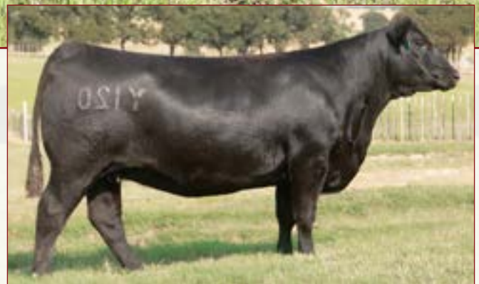
Dean's Queenie Y120 - Dam of Lot 2.