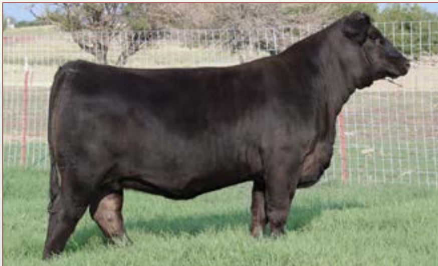
Zebo Lucy 9300 - Lot 15

This full flush sister to Lot 14 is more moderate in her frame, softer made in her kind and bolder in her muscle pattern and expression. Her dam who is one of the great Top Game daughter in the breed that has 2 progeny Nurse ratios at 114 and is a flat performance and maternal powerhouse. I really feel if you're looking for a replacement female, this one is more likely to follow in her mother's footsteps as a great producer.