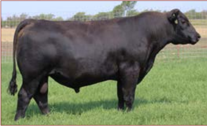
44 Acclaim 1865 - Lot 102