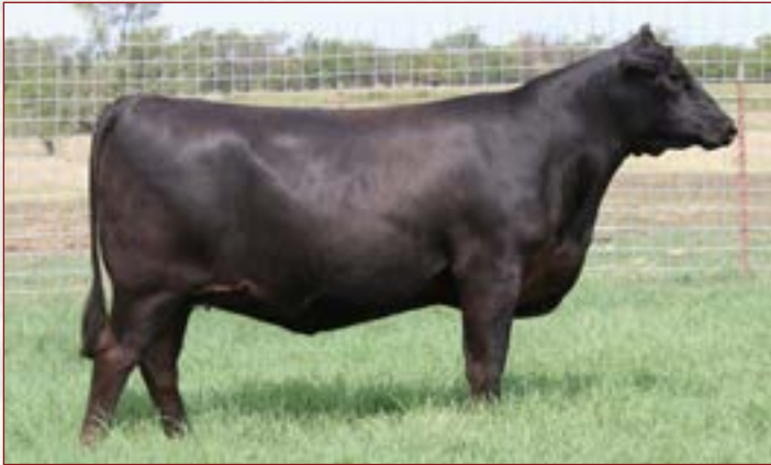
Wilks Evergreen 9307 - Lot 89

AI on 4/6/20 to Huwa Full Disclosure; PE from 6/2/20 to 8/10/20 to 3F Epic 7401.