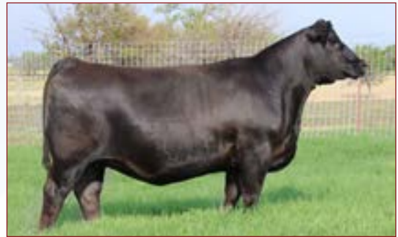
Zebo Henrietta Pride 9156 - Lot 80

AI on 5/12/20 to Myers Fair-N- Square M39; PE from 6/10/20 to 8/10/20 to 7H Jet Black 8107.