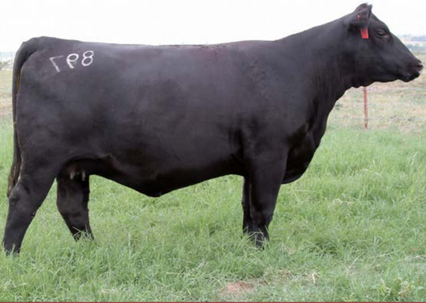
DDD Colonel High Obj F897 - Lot 50