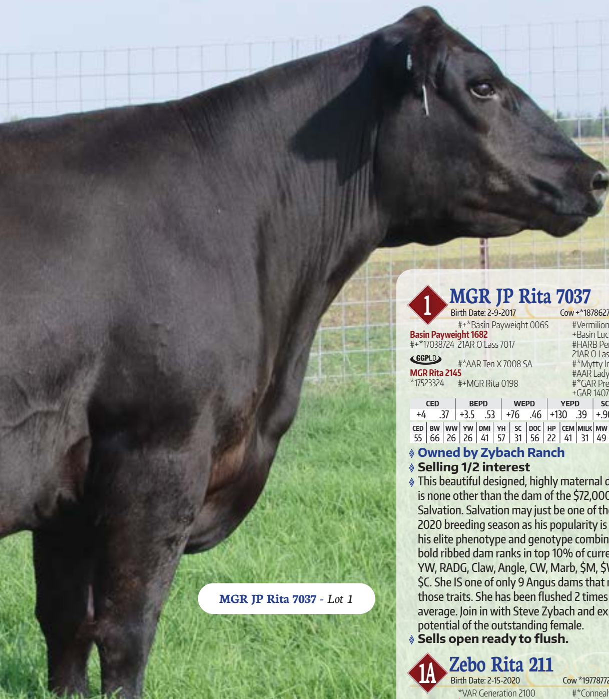
MGR JP Rita 7037 - Lot 1