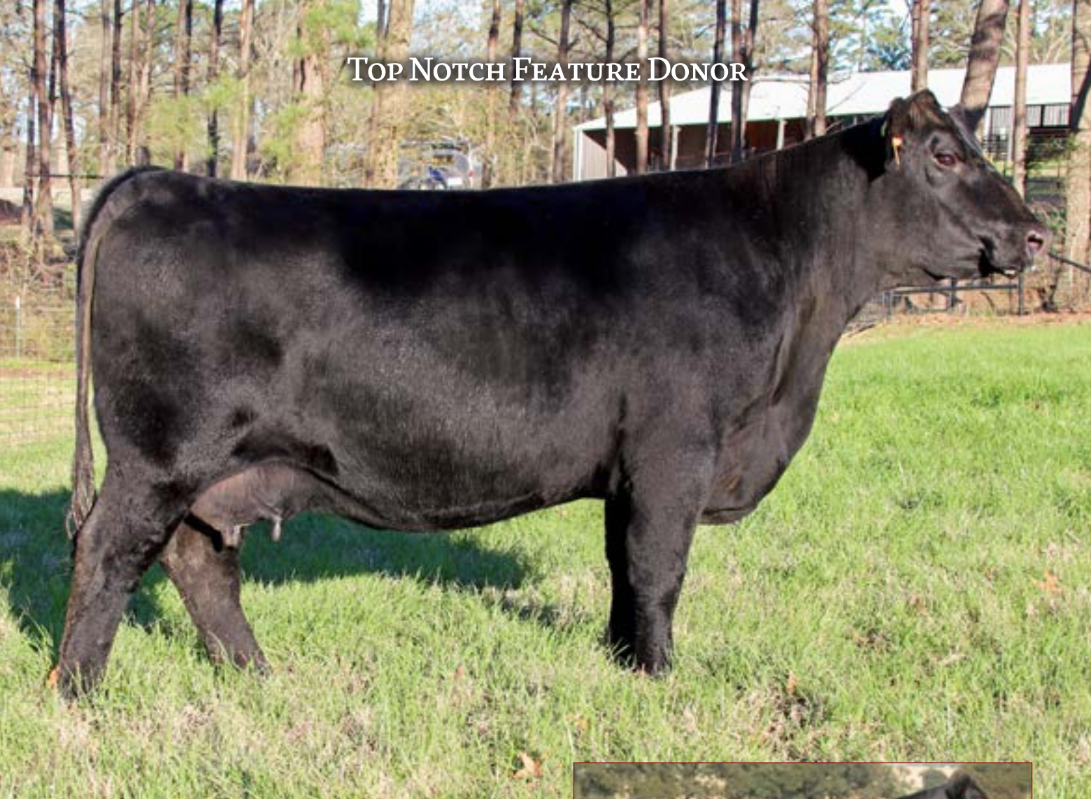
Angus Hill Queenie 2AX - Lot 2