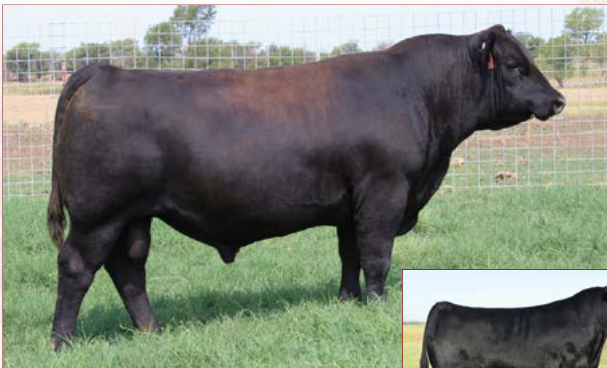
7H MGR Treasure 1913 - Lot 108