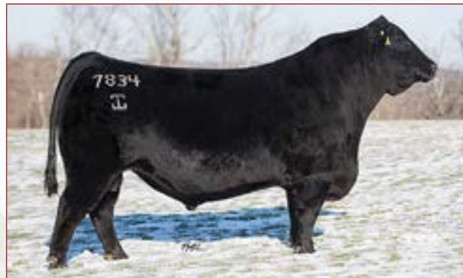
GAR Method - Sire of Lot 120.