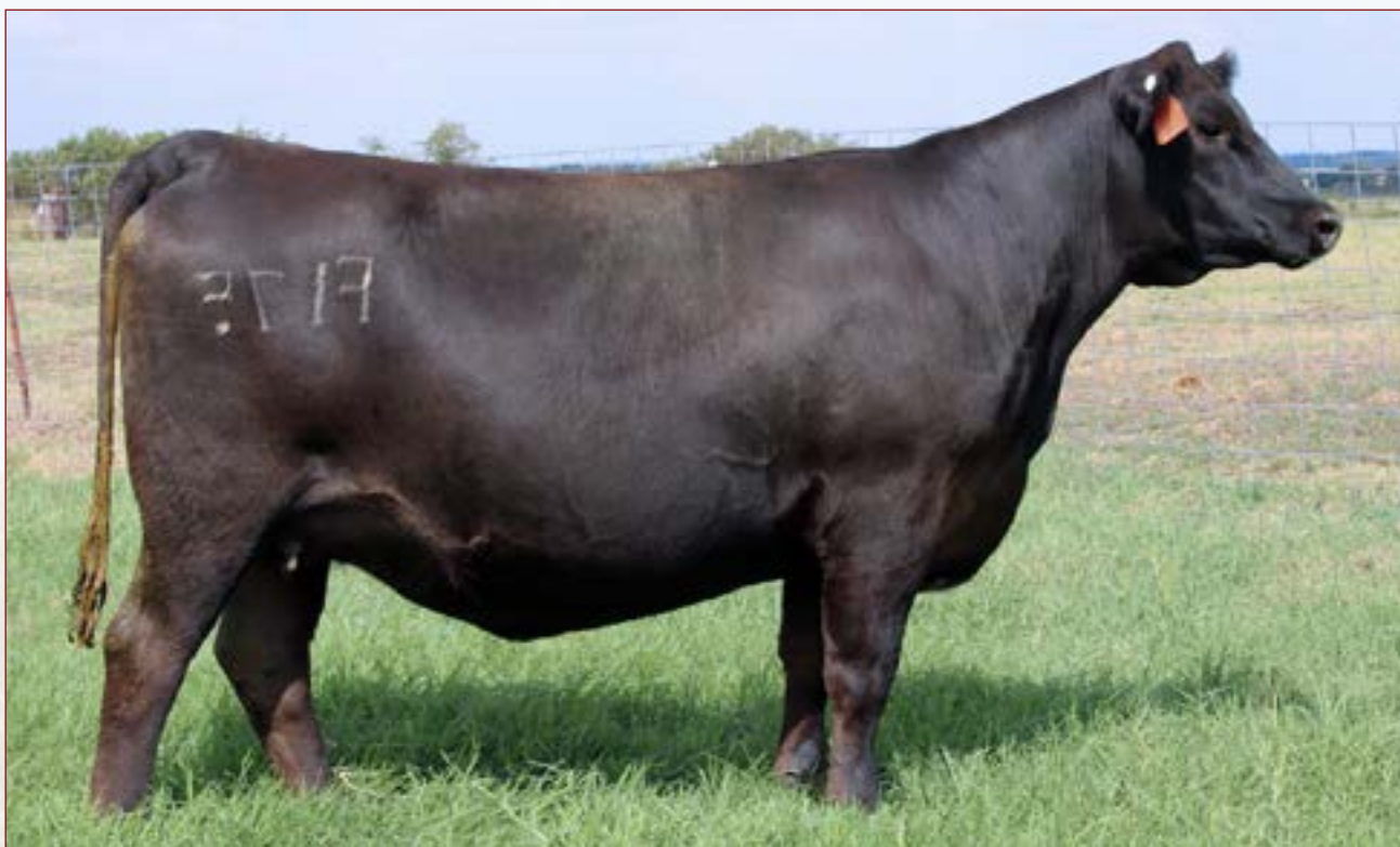
Dean's Rita F175 - Lot 51