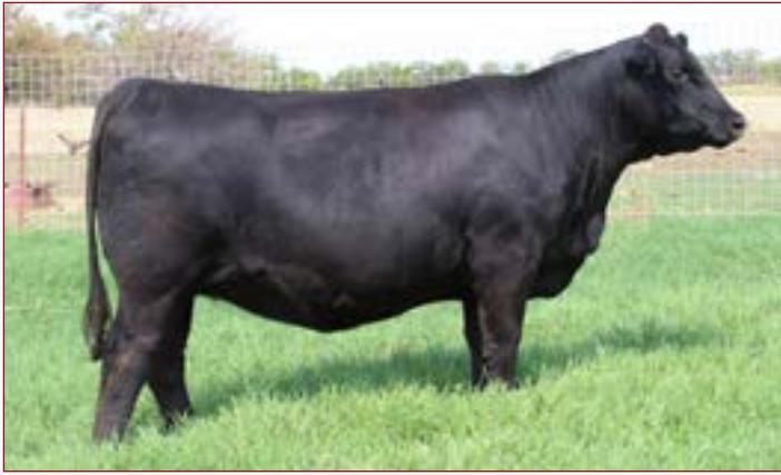
Miss 7H Epic 1916 - Lot 88