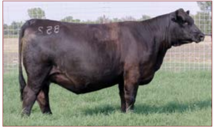
MJM Dually 852 - Lot 58