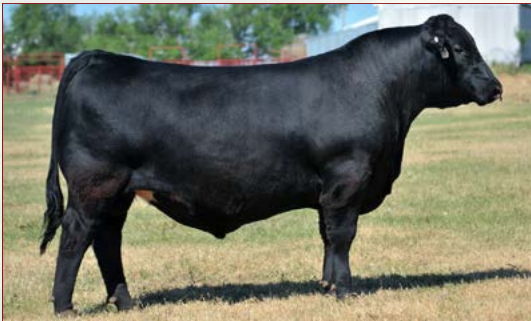
Wilks Gaucho 9097 - Reference Sire B