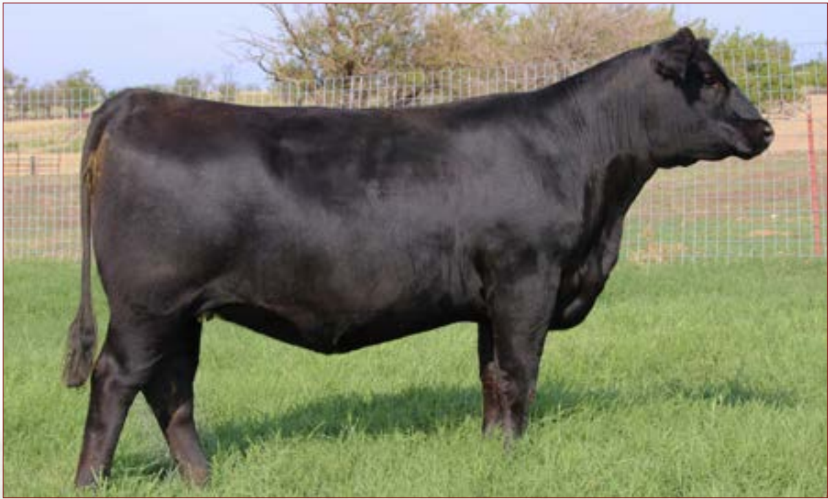
R B Blackcap 859 - 19