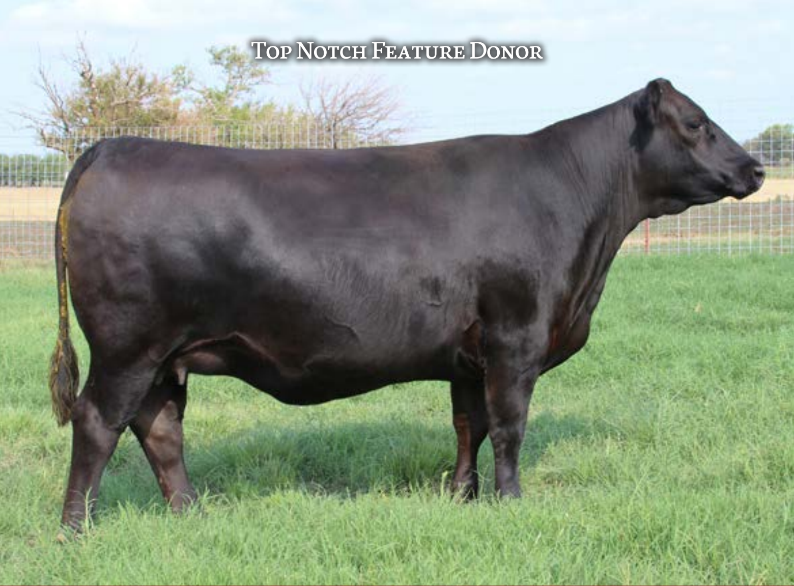
2 Bar C Trending 6G01 - Lot 3