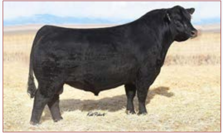
VAR Legend 5019 - Sire of Lot 113.