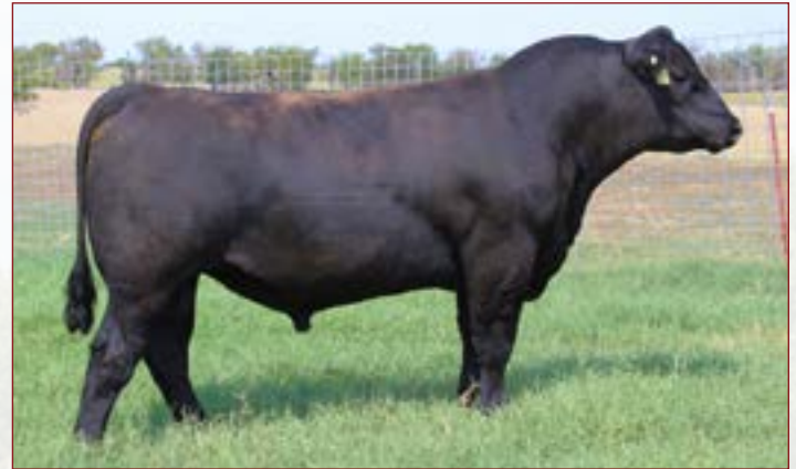
44 Heritage 1867 - Lot 104

Calving ease - Recommended for use on heifers.