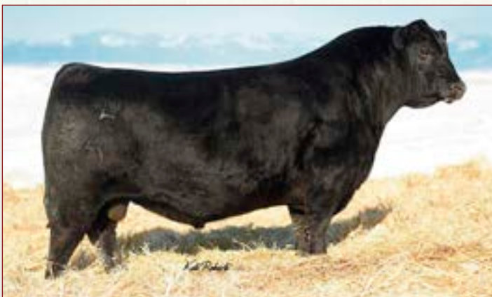
HA Cowboy Up 5405 - Paternal grandsire of Lot 90.

AI on 6/3/20 to BigK/WSC Iron Horse 025F; PE from 6/2/20 to 8/10/20 to 3F Epic 7401.