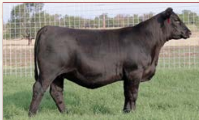
Zebo Mary Jane 9304 - Lot 18

Out of last year's Lot 2 female that went to Shawn Clifton, this powerful, beautiful designed Jet Black daughter has cow power written all over her. She reads well with a balanced EPD profile that ranks her in the top 1% for WW & YW EPDs as she stays in the top 2% for $W. This is a "no miss" replacement female.