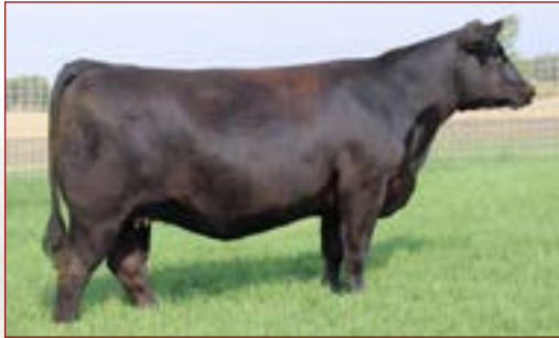
Miss 7H Legend - Lot 78

AI on 5-9-20 to SG Salvation; PE from 5/14/20 to 7/1/20 to FF Rito 8T34 of 5Q67 Titus.