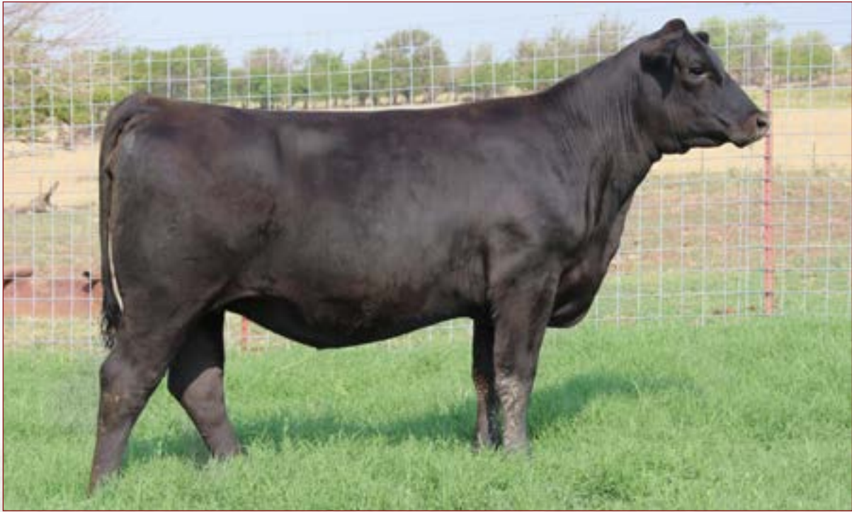
Miss 7H Treasure 1948 - Lot 25