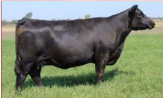
Zebo Pride 865 - Lot 40

AI on 5/13/20 to GAR Reliant; PE from 6/3/20 to 8/10/20 to 44 Acclaim 1865.