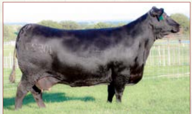
Roden RL Queenie 70527 - Maternal granddam of Lot 2.