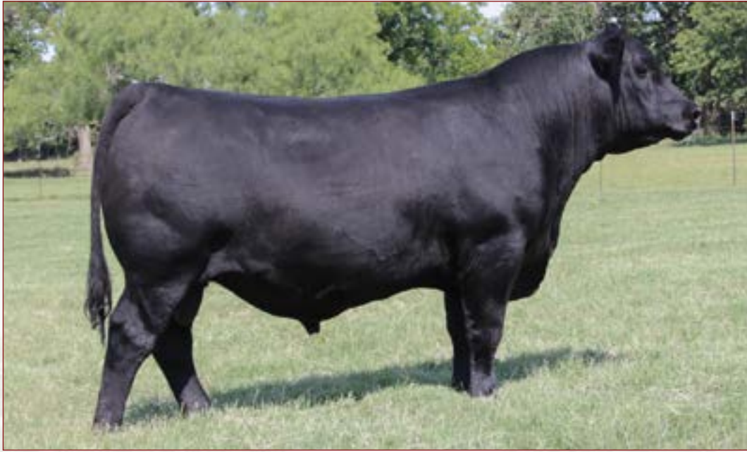
SG Salvation - Reference Sire A