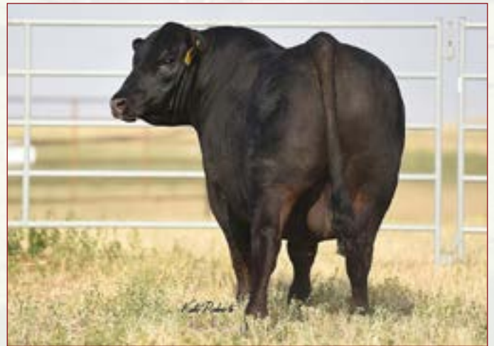
DL Dually - Sire of Lots 58-60.