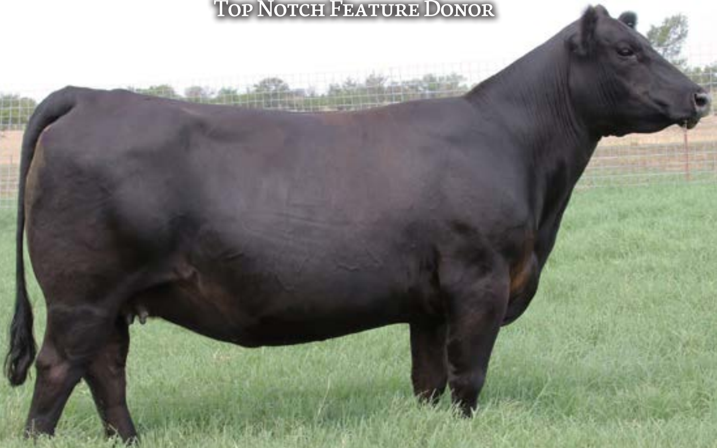
DCF Rita 6952 - Lot 5