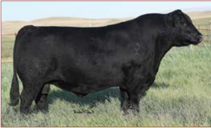
EXAR Monumental 6056B - Sire of Lot 110.