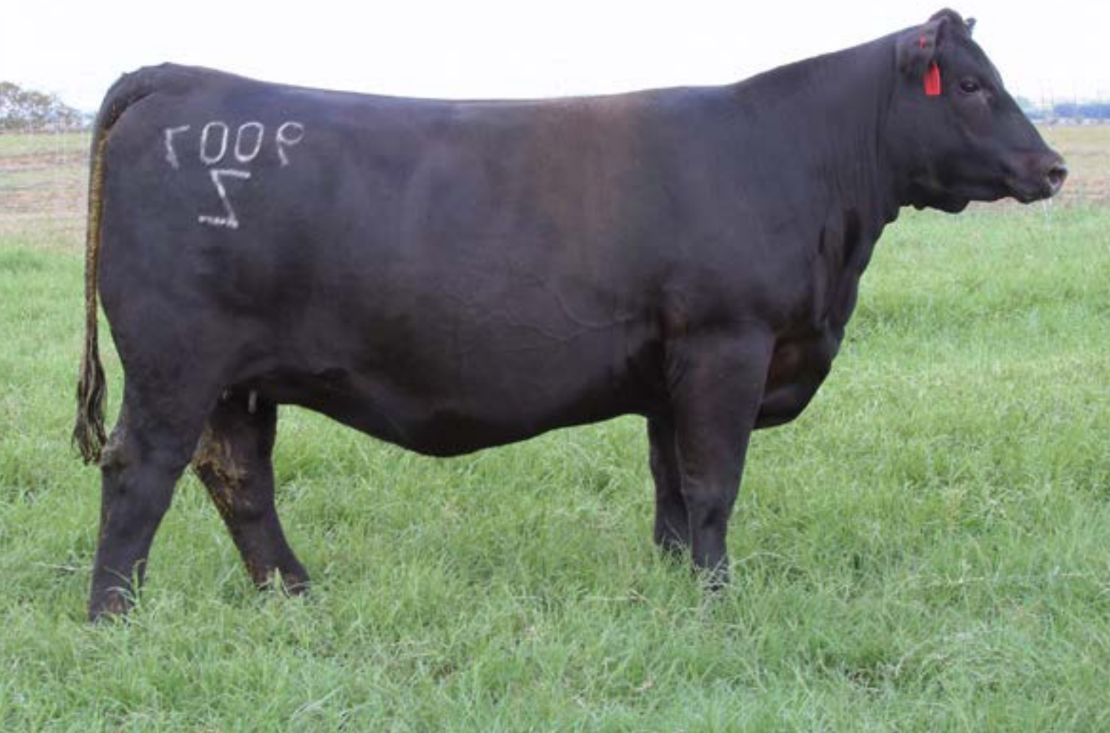
BJ Black Onyx 9007 - Lot 24