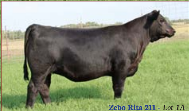
Zebo Rita 211 - Lot 1A