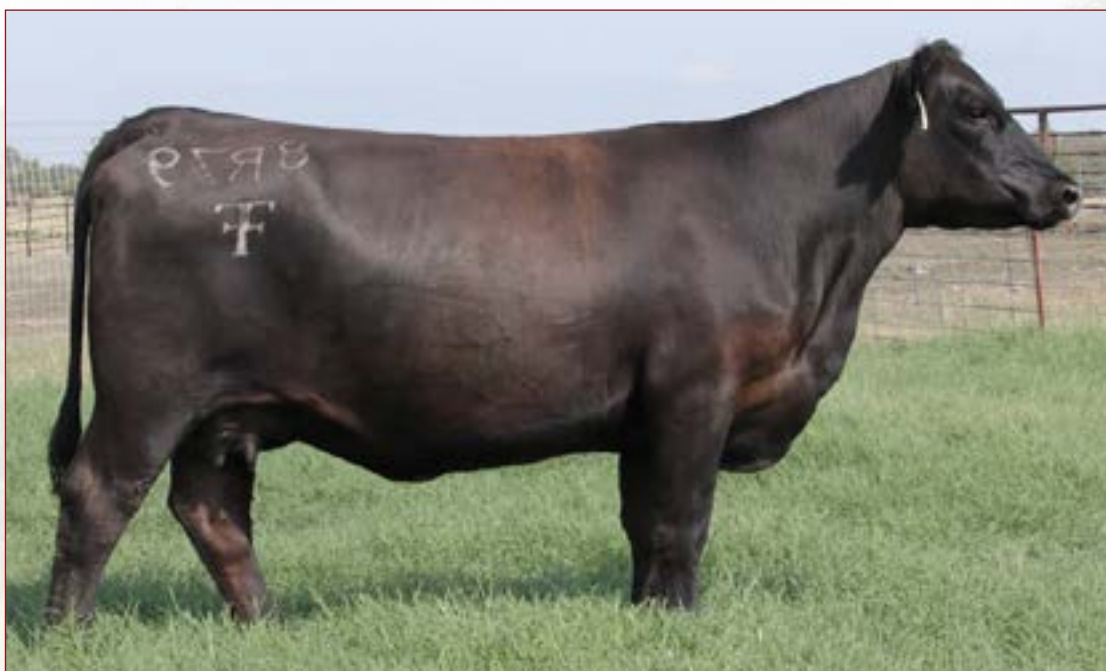
FF Rita 8R79 of 6145 Right - Lot 35

This tremendous heifer calf will continue the legacy of strong producing females that will raise a profitable calf year in and year out.