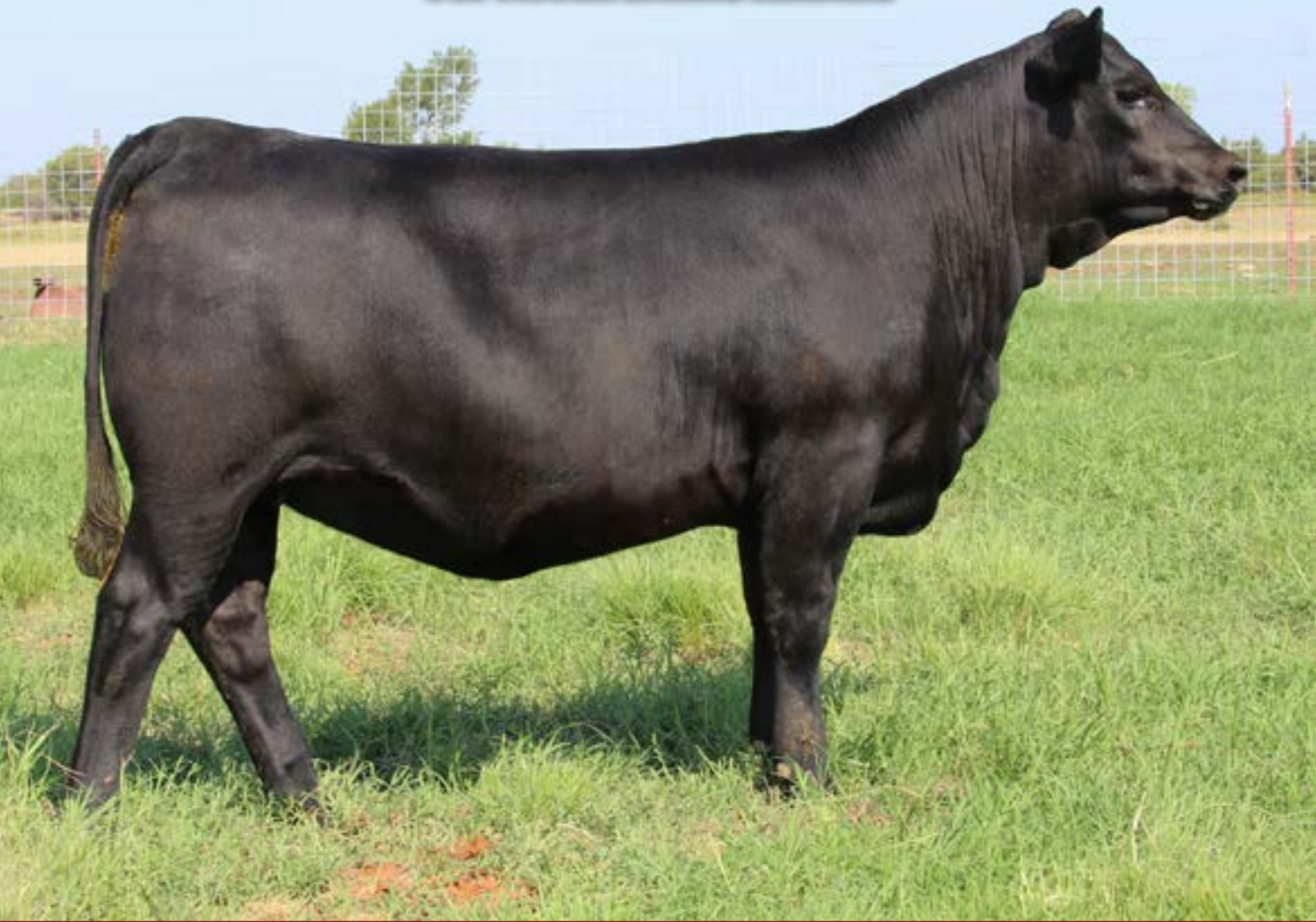
Zebo Rita 205 - Lot 10