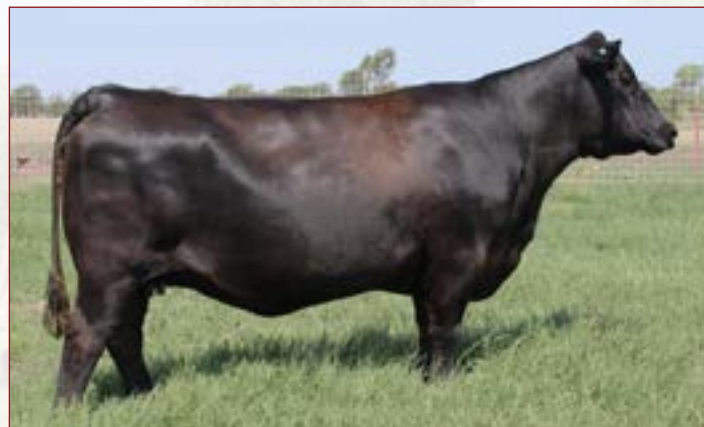
FF Rita 5R03 of M532 Rampage - Lot 47

Owned by Schaefer Angus A direct daughter of the $25,000 of the M532 donor matriarch now working for Angus of Clear Creek. A half-sister to 5R03 sold to Smith Valley Angus for $14,500. A power laden female that will make her mark in the breed. With an EPD profile to back it up she ranks in the top 1% for WW, YW, CW and REA. Her $B and $C rank in the top 3% as well. AI on 5/17/20 to Baldridge Alternative E125. Safe to AI date. PE to CoX Hi-Tech 8049 & 2 Bar Combination 6581 from 5/25/20 to 7/6/20.