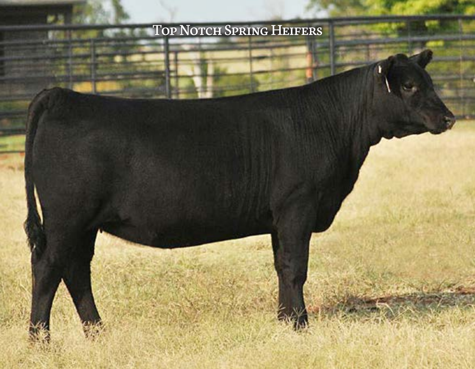
CMT Rita 0012 - Lot 7