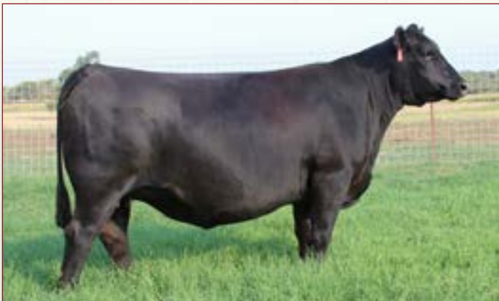
Pollard Rita 7024 - Lot 71