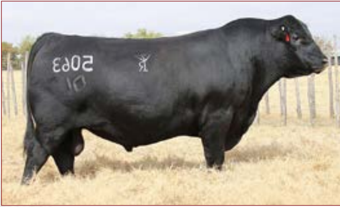
Bar R Jet Black 5063 - Sire of Lot 101.