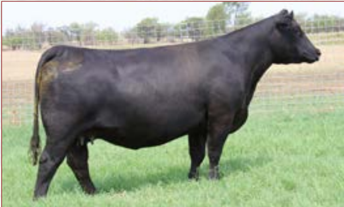
2 Bar Partner 6549 - Lot 70