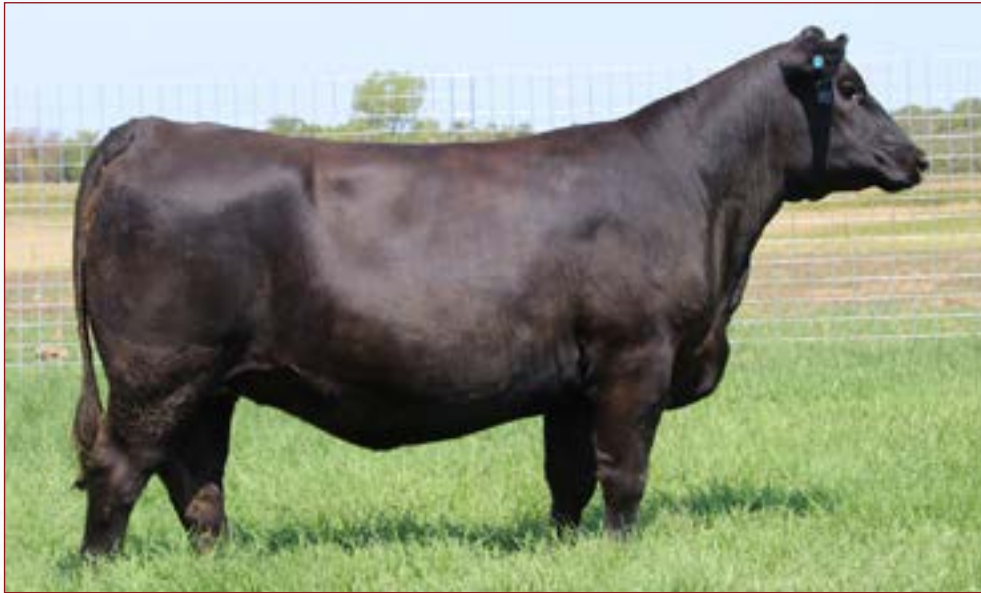
CSF Miss Monumental 917 - Lot 28