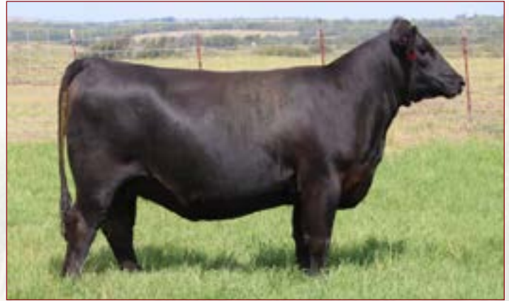
Zebo Quanah 8153 - Lot 59