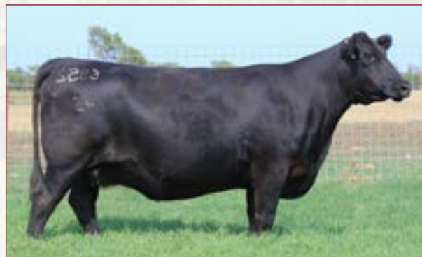
Goode Absolute 6852 - Lot 68

AI on 12/23/19 to Byergo Black Magic 3348; PE from 1/12/20 to 2/8/20 to Springfield Sure Fire 7110.