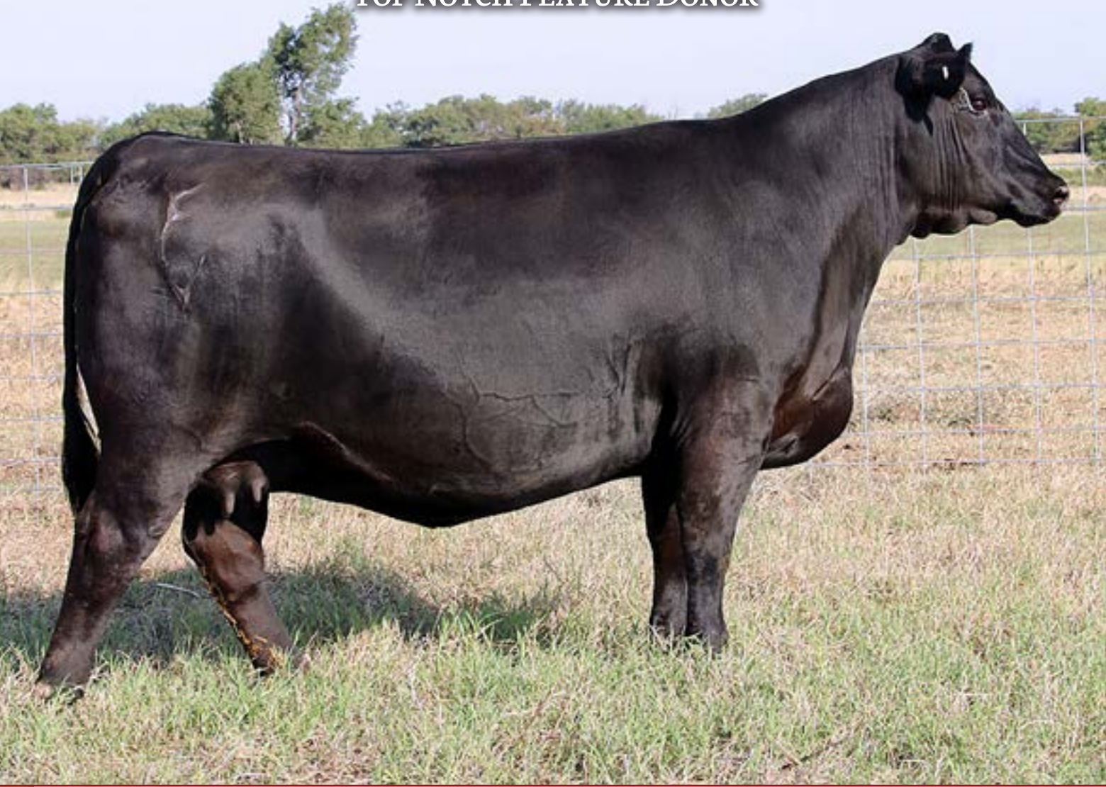
Riverbend Blackcap C165 - Lot 6