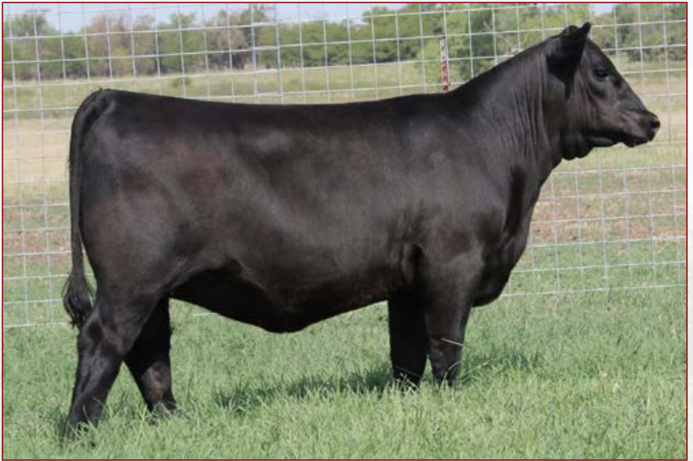
Zebo Jaunty 214 - Lot 8