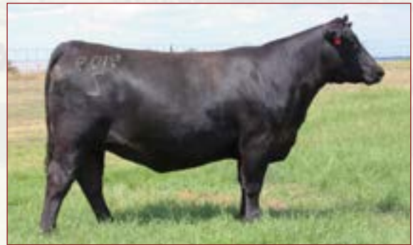
Zebo Beauty 9109 - Lot 81

AI on 4/23/20 to Big K/WSC Ironhorse 0255; PE from 4/25/20 to 7/17/20 to Gabriel Monumental 8414.