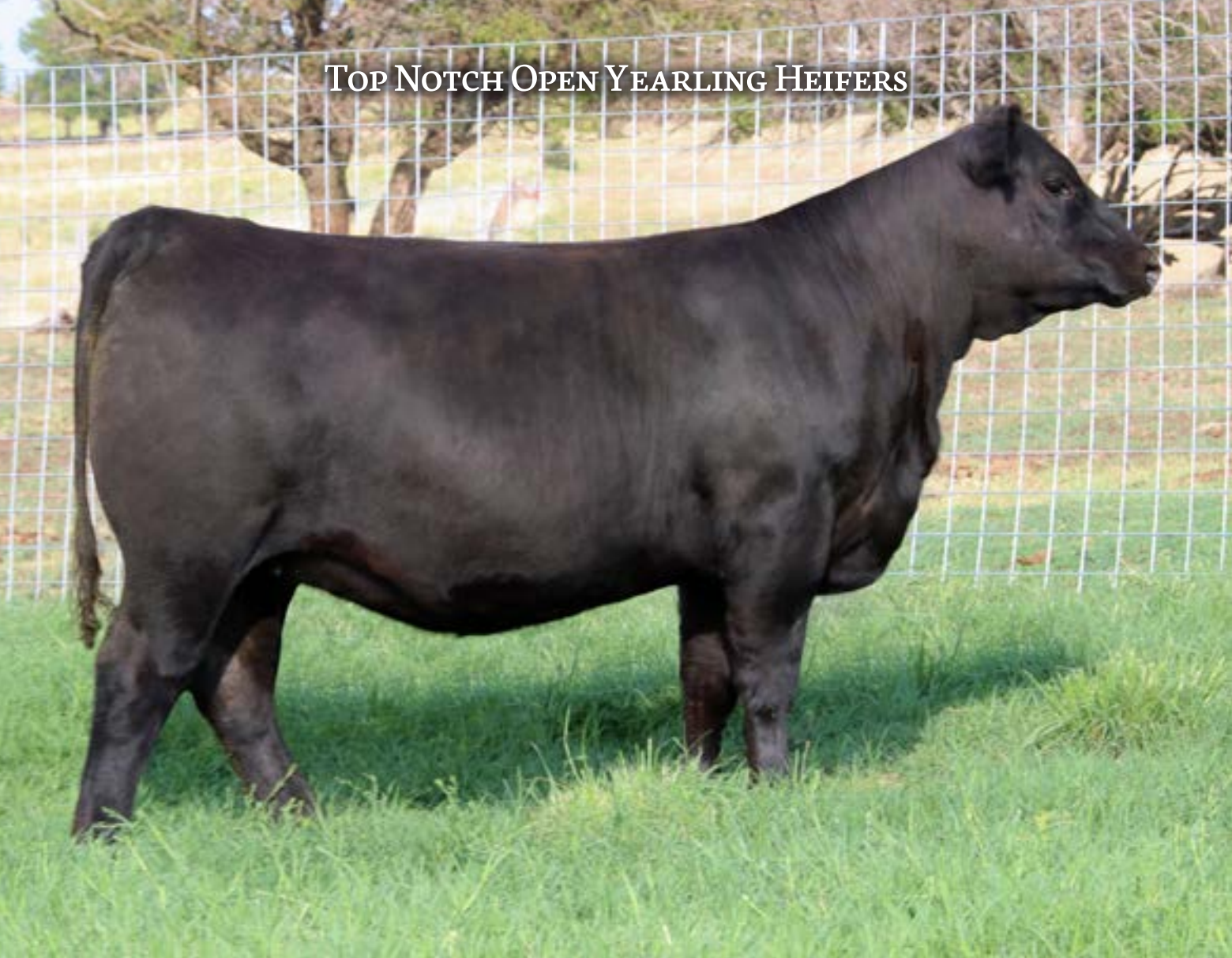
Zebo Rita 9328 - Lot 13