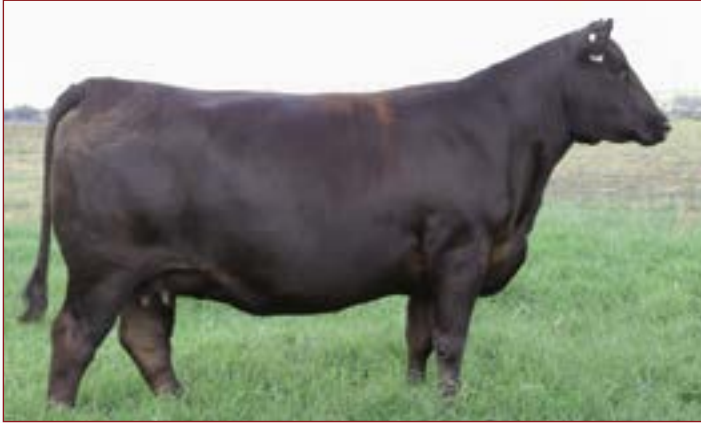
HR Rita 7578 - Lot 69