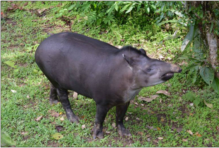
Nellie the Brazilian Tapir.

to then look down. The forest floor shimmered much like the night sky as the glowing fungi speckled the ground.