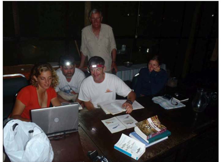
Identifying the day's catch.