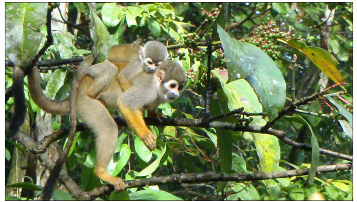
Common Squirrel Monkeys.