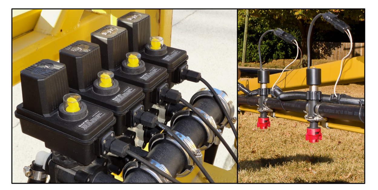
Figure 2. Boom section valves (left) and individual nozzle valves (right) are used with automatic boom section control systems.

When grouping the spray nozzles into sections, it is important to consider the two forms of overlap during application: headland overlap (e.g. point rows) and pass-to-pass overlap. The best strategy for reducing headland overlap is to distribute control sections evenly to eliminate any large (wide) control sections. This is the best case scenario for reducing total overlap if you are using a guidance system, which will help minimize pass-to-pass overlap. If pass-to-pass overlap is a concern and no guidance system is used, one might consider having one or two small controls sections at either end of the boom. However, any guidance aid (lightbar or automated guidance) alleviates the need for smaller sections at the boom ends, which would help improve overlap reduction in headlands.