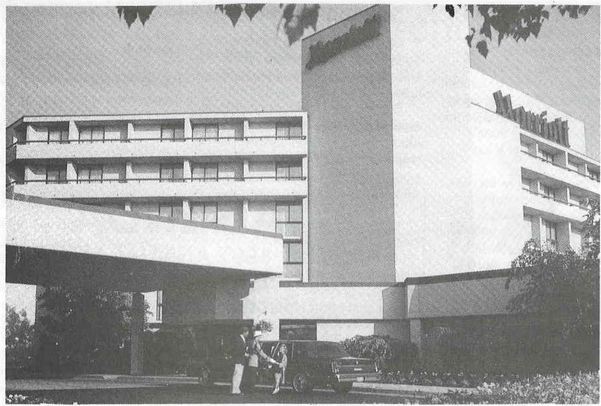
VENUE FOR AFEES ANNUAL MEETING, MAY 9-12, 1997

The Dayton Marriott offers the peace and comfort of a suburban setting minutes away from the aviation capital of America.