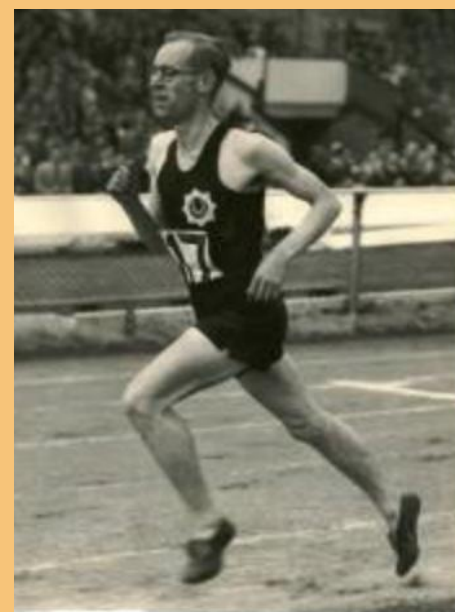
Wooderson - European Champion in 1938 and 1946