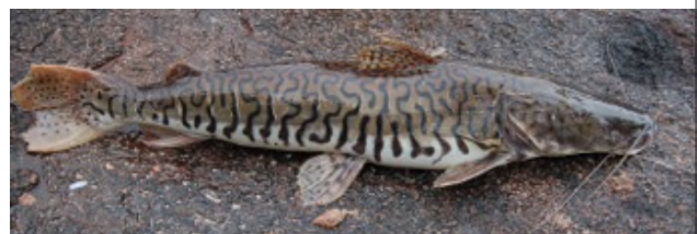
Figure 8.3. Two large fish species of the Middle Palumeu River. A. Pacu Tometes lebaili (Serrasalminae). B. Tiger catfish Pseudoplatystoma tigrinum (Pimelodidae).