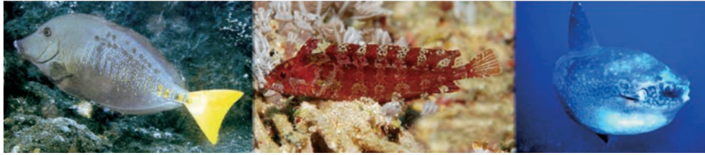
Plate 3.5. Examples of Bali species associated with areas of cool upwelling: from left to right – Prionurus chrysurus , Springeratus xanthosoma , and Mola mola .