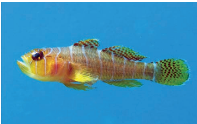
Plate 3.13. Priolepis sp., 2.5 cm total length.