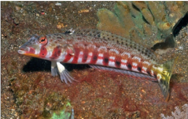
Plate 3.6. Parapercis bimaculata , 11 cm total length.