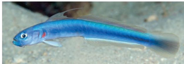
Plate 3.16. Ptereleotris rubristigma , 10 cm total length.