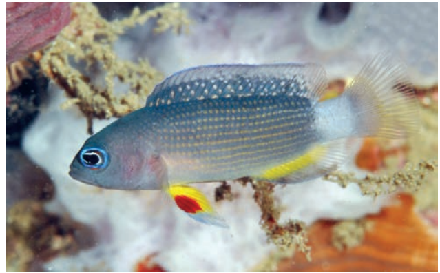
Plate 3.7. Manonichthys sp., 3.5 cm total length.