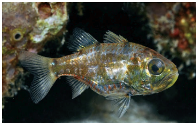
Plate 3.9. Siphamia sp., 3.5 cm total length.