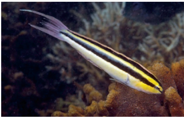
Plate 3.11. Meiacanthus abruptus , 7 cm total length.