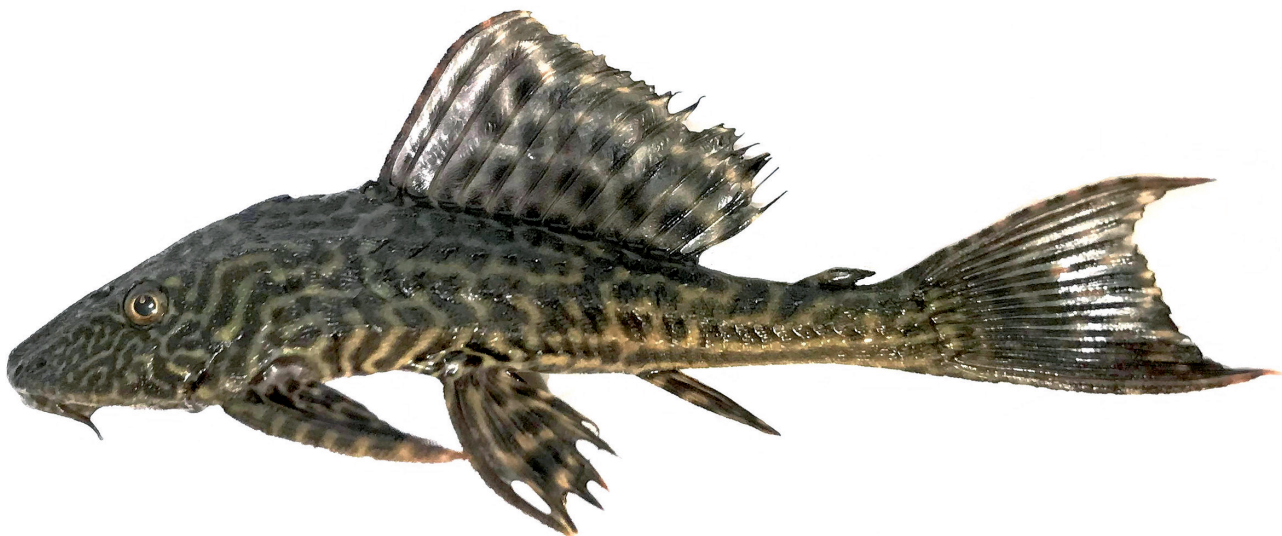
Fig. 2. Male of Pterygoplichthys pardalis (Castelnau, 1855) from the Shatt al-Arab River, Basrah, Iraq; 132.6 mm TL.

SAMAT et al. (2016) found that the Amazon sailfin catfish reaches maturity at 125 mm and 130 mm SL for males and females, respectively. With a size range of 125.7 to