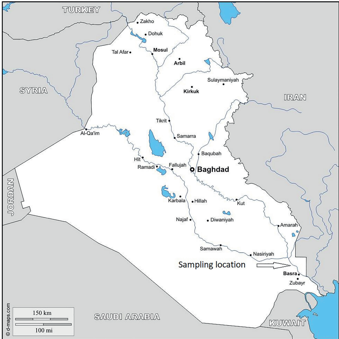
Fig. 1. Map showing the locality of collection (arrow) of Pterygoplichthys pardalis (Castelnaud, 1855) in the Shatt al-Arab River, Basrah, southern Iraq.

The present study reports on the presence of the Amazon sailfin catfish in the Shatt al-Arab River at Basrah, Iraq, where 175 individuals of P. pardalis were collected in 2017. This is the first record of this species from the freshwater system of Iraq in general and from the Shatt al-Arab River in particular.