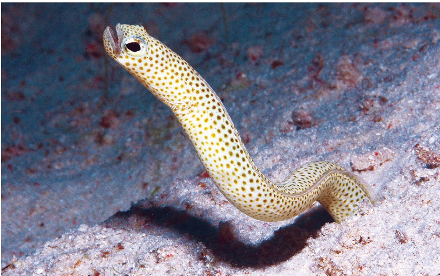
Figure 2. Heteroconger guttatus , underwater photo of live paratype, orange-brown spotted markings, approximately 400 mm TL, Venu Island, West Papua Province, Indonesia (G.R. Allen).

Color in life. (Figs. 1 & 2) Generally whitish to pale yellow with a dense pattern of small, round, orange-brown to dark-brown spots, generally smaller and less vivid on ventral half of body; dorsal and anal fins translucent with widely spaced brown spots to flecks on dorsal fin; iris pearl white to pale yellowish with a broad blackish bar dorsally and a similar, but less conspicuous, marking ventrally; lips dusky brown laterally; white bar frequently present below eye extending to below rear edge of mouth.