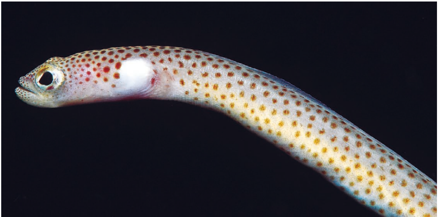
Figure 5. Heteroconger fugax , underwater photo, approx. 600 mm TL, Anambas Islands, Indonesia (G.R. Allen).