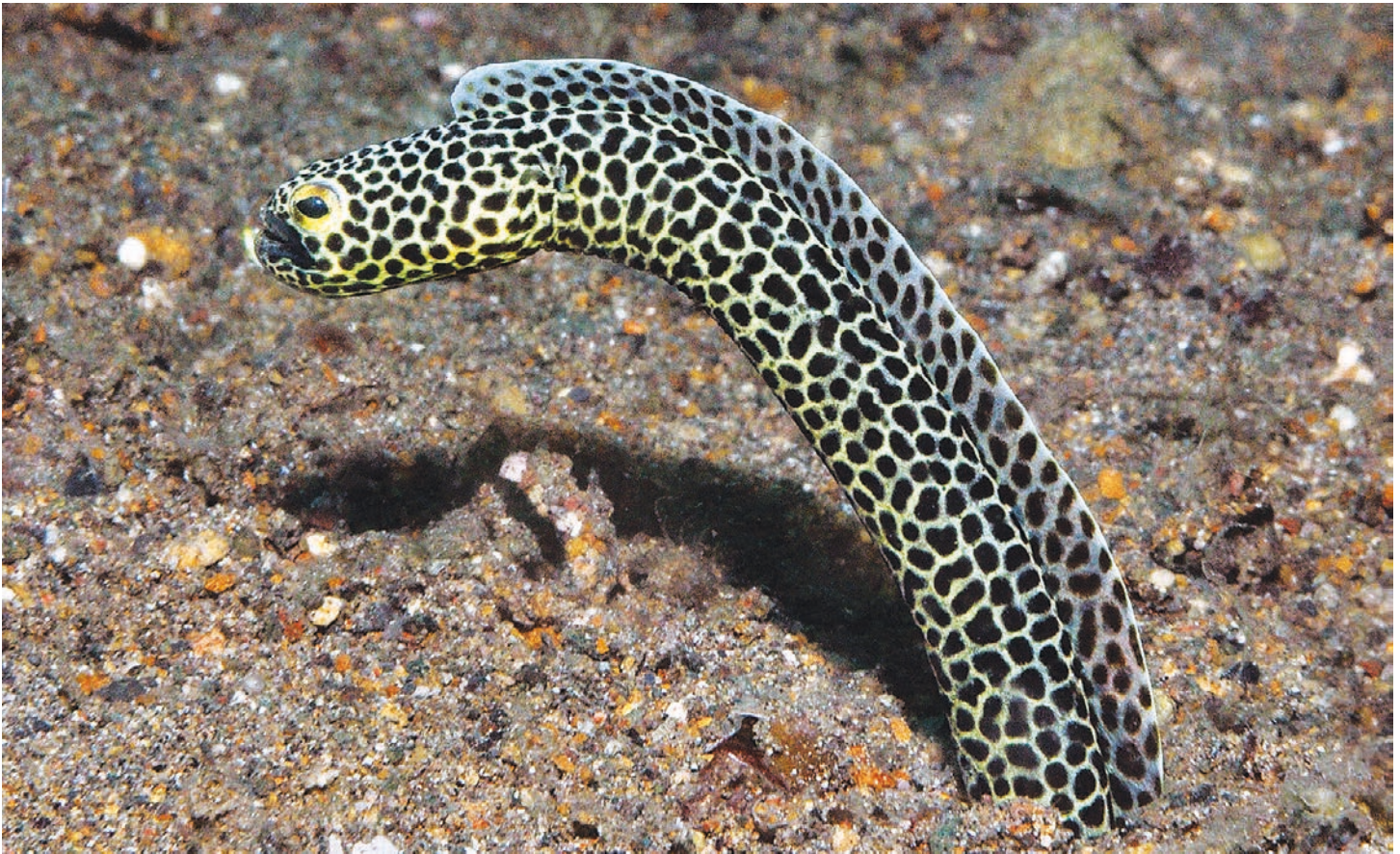
Figure 6. Heteroconger taylori , underwater photo, approx. 400 mm TL, Anilao, Luzon, Philippines.

Two other western Pacific species, Heteroconger tomberua Castle & Randall, 1999 from Fiji and Heteroconger tricia Castle & Randall, 1999 from Indonesia, have a somewhat similar pattern but, unlike the variably sized spots of H. guttatus , they possess mostly uniform-sized spots with no difference between the dorsal and ventral portions. The individual spots are also much larger (to nearly pupil size) and relatively widely spaced, with less than 15 spots on each side of the head in H. tomberua and only one or two spots in H. tricia . The two species also differ in having higher vertebral counts (188–210) and lacking pterygoid teeth. The only other species that H. guttatus might be confused with is Heteroconger taylori Castle & Randall, 1995 (Fig. 6), which ranges from Papua New Guinea to Bali and the Philippines. It shares a similar vertebral count (169–172) as well as a dark-spotted pattern, however its spots are intensely black, irregularly shaped or in a maze-like network, and extend conspicuously onto the dorsal fin.