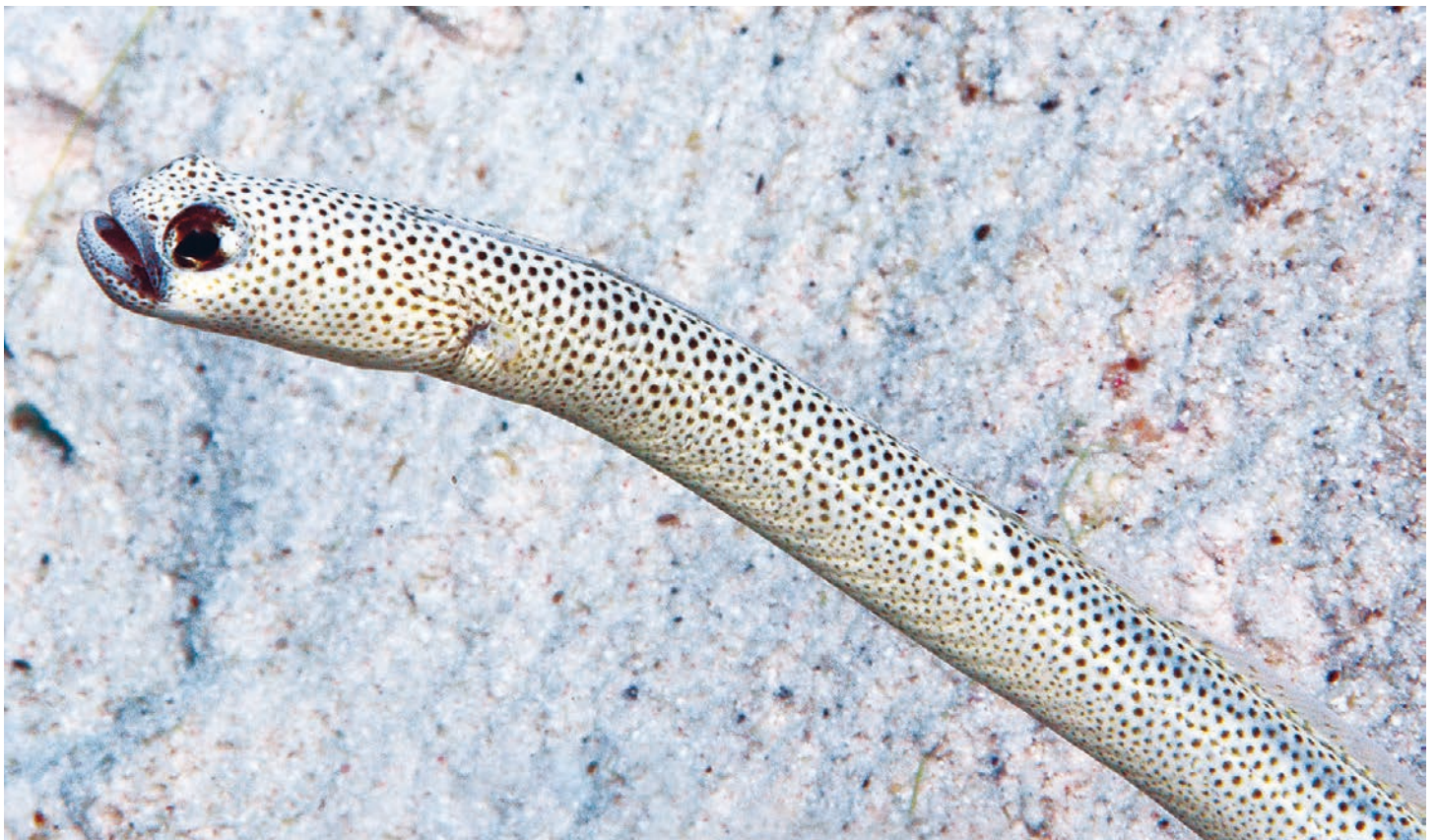
Figure 1. Heteroconger guttatus , underwater photo of live paratype, dark-brown spotted markings, approximately 400 mm TL, Venu Island, West Papua Province, Indonesia.

Measurements: snout-anus length 38.5 (35.9–40.7; 38.4)% of TL; HL 13.6 (10.3–15.7; 14.2)% of snout-anus length; predorsal length 9.3 (8.9–12.7; 10.5)% of snout-anus length; all following as % of HL: snout 12.7 (10.9–19.1; 13.4); eye 20.4 (19.0–28.4; 22.1); fleshy interorbital 17.8 (13.6–18.8; 16.1); mouth 26.3 (21.4–32.9; 24.6);