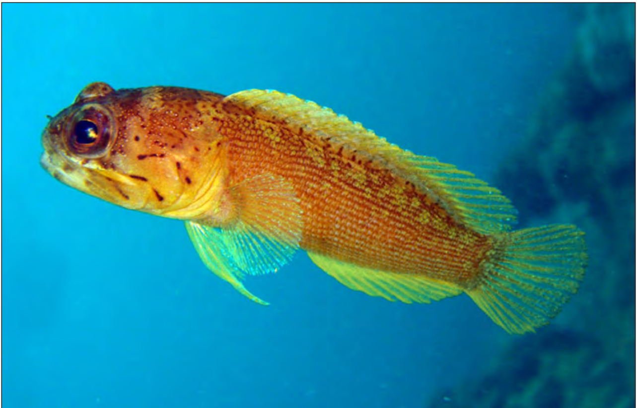
Fig. 4. Opistognathus rufilineatus , same individual as in Fig. 3, Triton Bay, Bird's Head Peninsula, western New Guinea.

We are especially grateful to Conservation International and the Indonesian Department of Nature Conservation (PHKA) for sponsoring the 2006 expedition and especially to the Walton Family Foundation for their interest and generous support of CI's Bird's Head Seascape marine conservation initiative. Special thanks are due Mark Erdmann, who collected the type specimens and assisted the second author with fish collections on both the 2006 and 2007 visits to Cenderawasih Bay and Triton Bay. We also thank Graham Abbott for assisting with diving activities and the crews of the live-aboard boats, M. V. Citra Pelangi and M. V. Seahorse , for providing excellent logistic support during these trips.