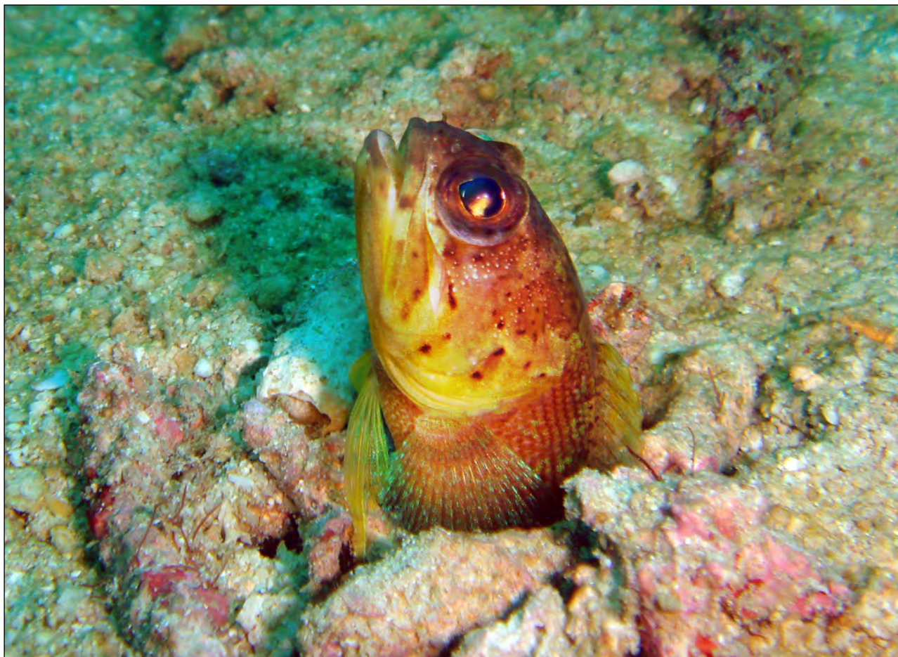
Fig. 3. Opistognathus rufilineatus , underwater photograph of uncollected adult partially out of its burrow, Triton Bay, Bird's Head Peninsula, western New Guinea.

Comparisons: The combination of essentially uniformly pigmented fins, sides of body with narrow red-brown stripes outlining each yellow-tan lateral scale row, and cheeks with a few small scattered, dark, brown spots and narrow, short lines distinguishes Opistognathus rufilineatus from all other species of the genus. Only two other Indo-West Pacific species (undescribed) have similarly