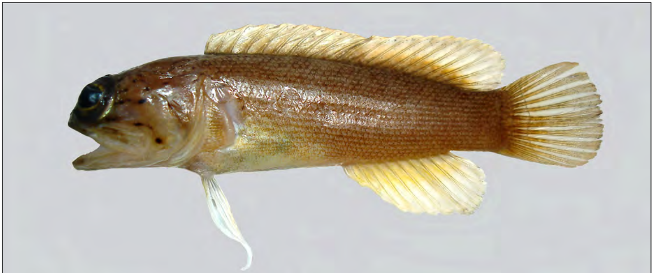
Fig. 2. Paratype of Opistognathus rufilineatus, WAM P. 32802-001, female, 56.1 mm SL, Triton Bay, Bird's Head Peninsula, Western New Guinea.

Color in alcohol: head and body light brown, becoming paler ventrally; lips without