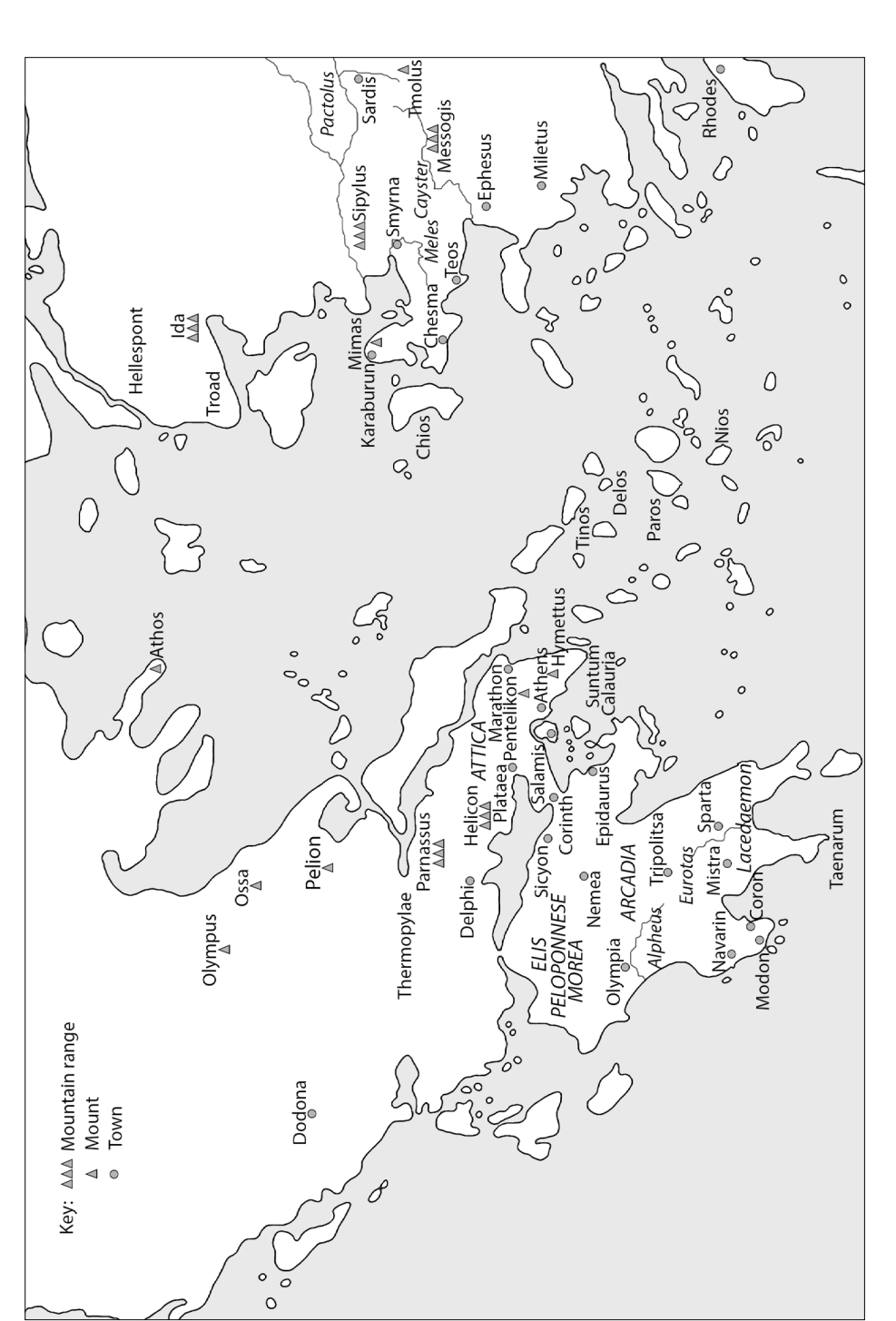
Map of Greece and Asia Minor, with locations mentioned in Hyperion, CCBY 4.0.