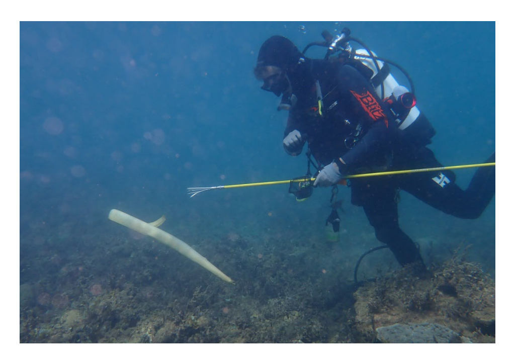
Figure 1. Sampling using handspear, net and clove oil (squirt bottle attached to belt) on SCUBA at Bundegi (CR-19-28). Seasnakes were often very inquisitive.