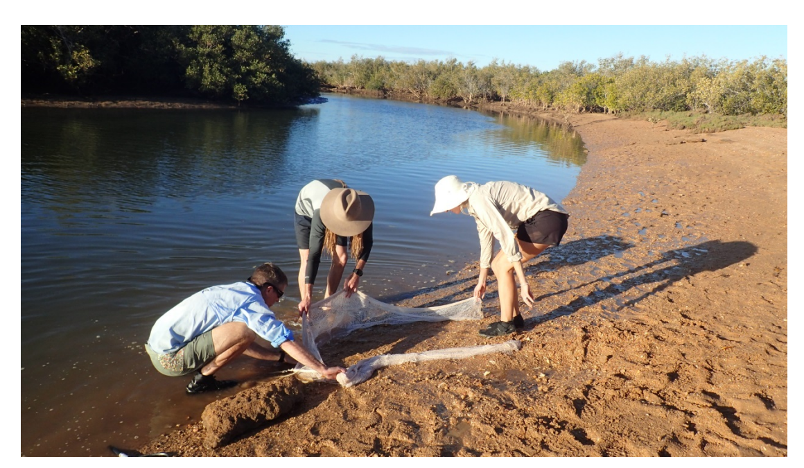
Figure 3. Sorting catch from a cast net with BHP participants in a mangrove creek at Bay of Rest (CR-19-17).