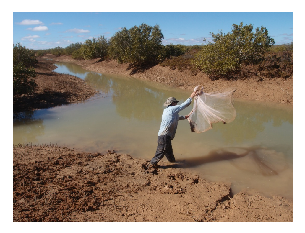
Figure 2. Deploying cast net in a mangrove creek at southern end of Exmouth Gulf (CR-19-22).