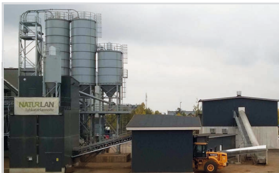
Fig. 4. Biomass ash granulation plant next to the biomass CHP plant in Rovaniemi, Finland.

taining the nutrient balance of bio fuel production areas and securing future biomass production. With that the total bio energy and fuel cycle is complete, not shorthanded. The energy companies may support sustainable development and the recycling economy of local communities. Less waste is dumped in landfills. The ash fertilising solution is also a long-term recycling solution, which creates stability and predictability in business environment. Disposal cost and waste taxes of ash may be turned into revenues from ash fertiliser sales.