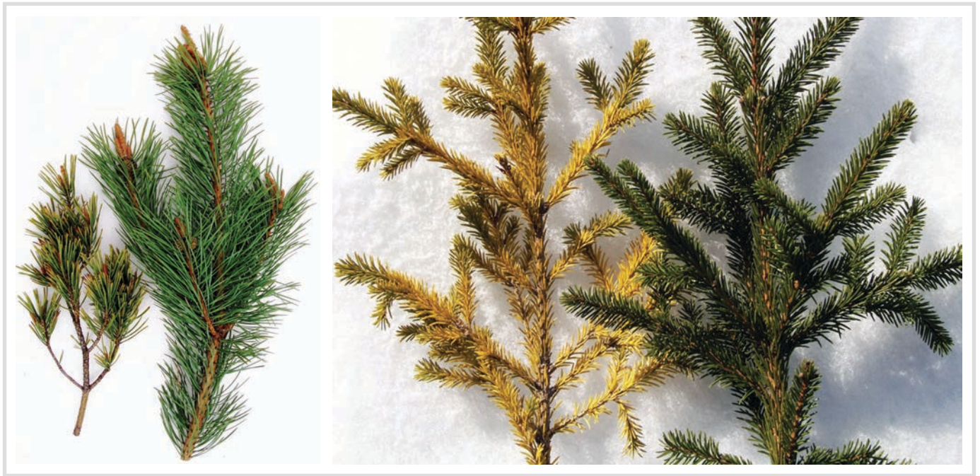
Fig. 1. Effect of biomass ash fertilising to the needles. Left pine, right spruce, there are branches without fertilisation (left) and with fertilisation (right) in the both pictures [5].

Studies covered different forest soils, ash qualities, tree growth, impact to forest berries, mushrooms, water systems and greenhouse gases. Solubility, nutrient leaching and granulation effects of the ash fertiliser have been studied, too. [4]