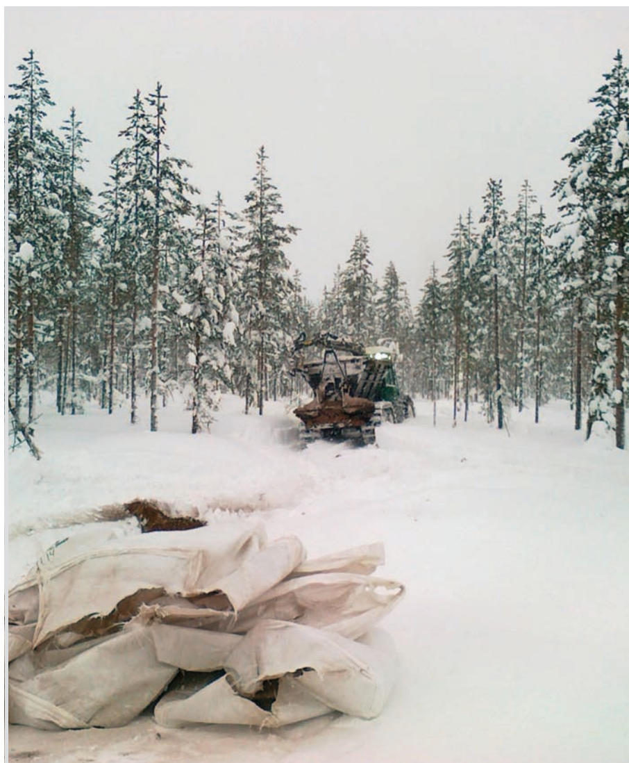
Fig. 5. Granulated ash fertiliser ground spreading in Loue during spring winter 2015, Finland [7].

eas. Helicopter spreading does not cause any damage to undergrowth and root of trees like ground spreading. Heavy ground spreading forest forwarders need more solid ground to operate.