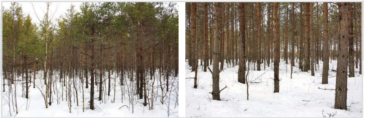
Fig. 2. Control peatland forest area not fertilised (left). Ash fertilised peatland forest area (right). Biomass ash fertilising has been done 15 years ago. Located in Pelso peatland forest in Vaala [5].

from the boiler. However, ash fertilising can compensate nutrient losses of bio-fuel intensive harvesting and neutralise the pH of the soil. Ash fertilising can maintain the fertility of mineral soil forest areas. The Swedish board of forestry has published guidelines on how to compensate nutrients, which are taken away along forest residue harvesting and clear cut. Ash fertilising is also recommended to compensate soil acidification. In the southern part of Sweden, chemical forest fertilisers are forbidden and only ash forest fertilisation is allowed [6].