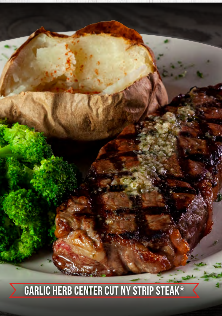
GARLIC HERB CENTER CUT NY STRIP STEAK*

Most dinners are served with your choice of two sides.