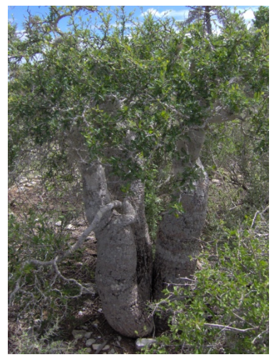
Operculicarya decaryi as a shrub Cap Sainte Marie National Park (Ravaomanalina, 2006)