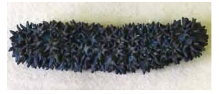
T. ananas (processed)

T. anax is also large, with an average length of 63 cm but a maximum length of 89 cm (Purcell et al., 2012). Its colour varies from creamy white beige to grey or light brown with dark brown and/or reddish spots and blotches dorsally. Those in the Indian Ocean may lack the reddish blotches.