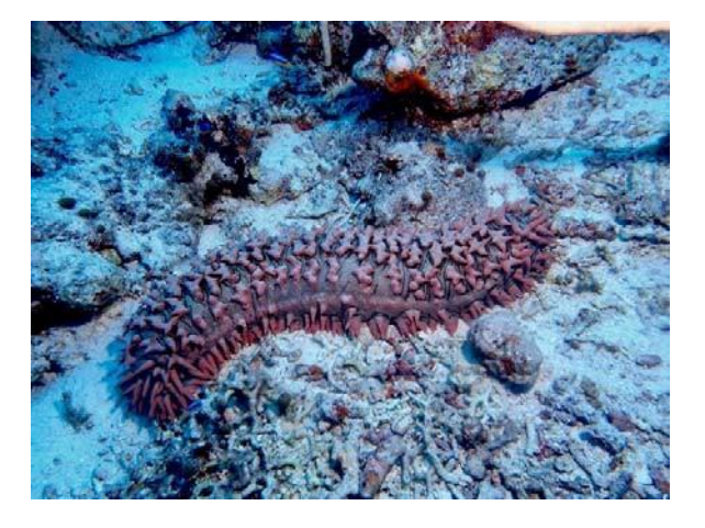
T. ananas (live)

conspicuous papillae. The body is firm and rigid and is arched dorsally and flattened ventrally. The mouth ventral has 20 large, brown tentacles. For ossicles, the species has tentacles with large plates, 135 \mu m long and 95 \mu m wide, as well as some smaller rods (Purcell et al., 2012). Processed, T. ananas is 20-25 cm long, relatively elongate and brown to black in color. The dorsal surface is covered in brown to black-brown spikes, often in a star shape (Purcell et al., 2012).