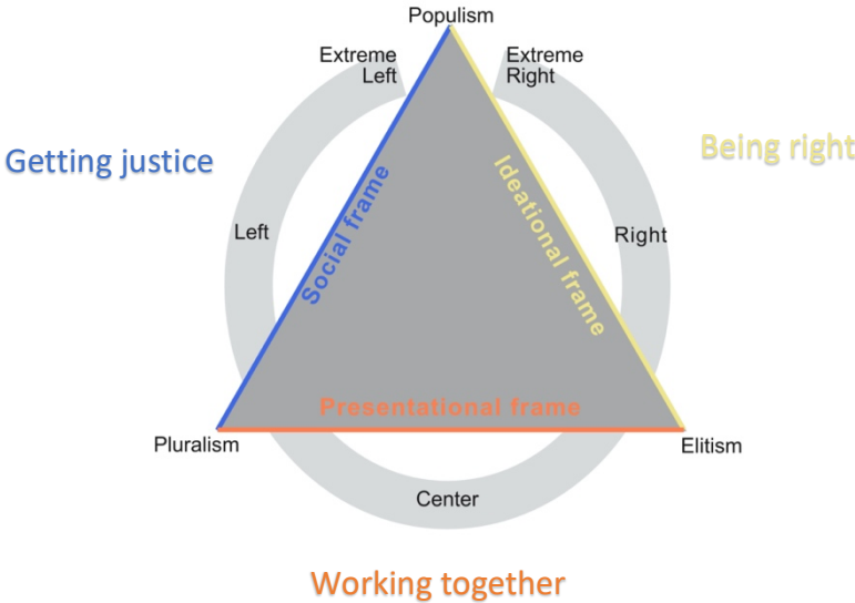
Figure 3: The triangular model of populism, elitism, and pluralism plotted onto the horse-shoe model of left-right.

Right-wing politicians mainly regard political issues from the ideational dimension, relying on traditional framings of reality. In this frame, politics is about the absolute truth that should be followed. Left-oriented politicians regard politics from a social perspective: politics is primarily about social justice because what is seen as ‘true’ is often advantageous for those in charge because they dominate mainstream narratives. Centrist politicians view politics from a communicative perspective; politics is not about being right or getting justice, but about collaboration and communication.