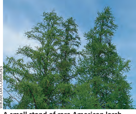
A small stand of rare American larch. Great effort has been made to save the trees from extirpation.