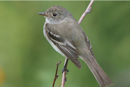
The alder flycatcher's buzzy " whee bee-o " song can carry for a surprisingly far distance in the swamp.

The trail leading from the parking area traverses the swamp, over a series of short wooden bridges, to a shallow lake. Along the trail, there are ample opportunities to observe many species of birds, butterflies, dragonflies and other wildlife and plants, some of which are rare or uncommon in Maryland. From the lake, visitors can continue north over a low hill that overlooks the eastern edge of the swamp. A few meadows dot the landscape further east and north. Finzel Swamp was established in 1970 and is owned and managed by The Nature Conservancy.