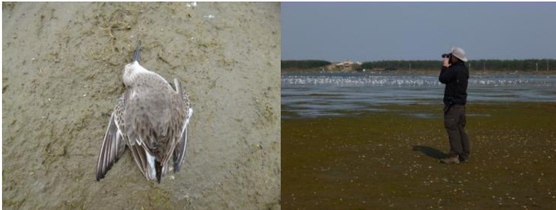
A poisoned Dunlin and counting the Saunders's Gulls at Dongling.