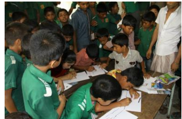
School children participating in SBS painting