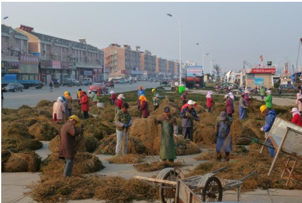
Typical early morning harbour-side scene in Yangkou

I arrived in Rudong on 14 October and met with members of the Task Force. Our hotel was on the main drag along the edge of the harbour in Yangkou, very atmospheric especially early in the morning with fishing boats moored up as far as the eye could see, armies of fishermen tending their nets whilst street food vendors prepared a selection of deep fried breakfast items across the road. The surrounding landscape was hardly picture postcard however with factories and industry dominating the surrounding area. A nasty, gaseous discharge from one of the factories behind the hotel each evening wasn't kind on the senses either!