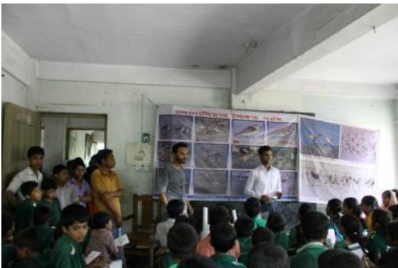
Ghotbhanga primary school, WMBD May 2013)