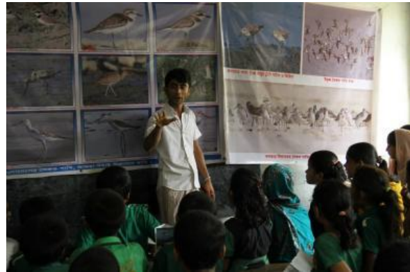
An ex-hunter talking about SBS conservation and his commitment to save it, WMBD May 2013