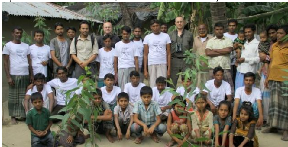
RSPB's visit on Sonadia Island and meeting with ex-hunters, November 2012