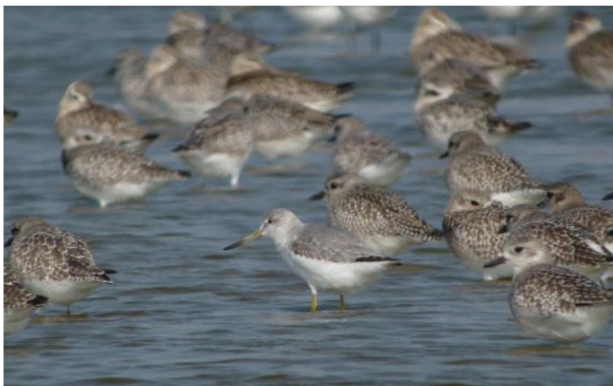
Nordmann's Greenshank at a high tide roost near Yangkou Port. Up to 166 were found roosting here and always in the company of hundreds of Grey Plovers.