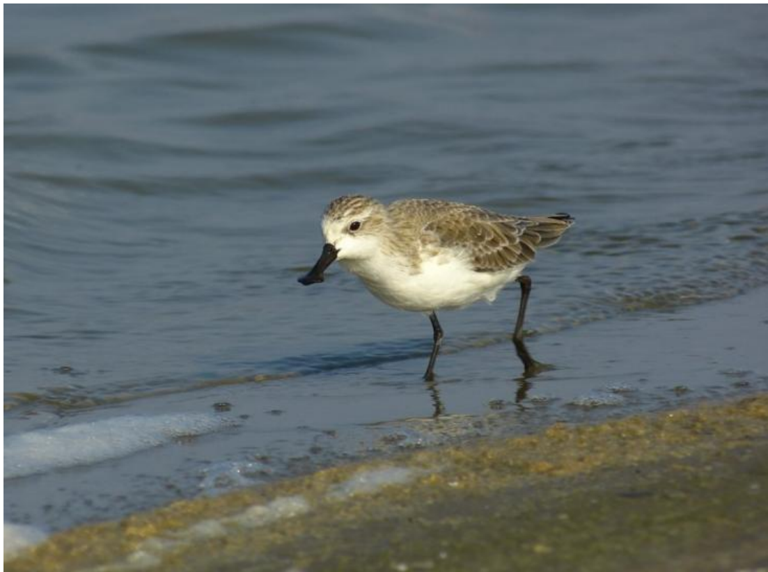
Spoon-billed Sandpiper feeding on pool edge at a high tide roost site near Yangkou.

Another site which proved to be really attractive to waders, including Spoonies, was a set of fishponds and lagoons to the southeast of Haiyin Temple. Here we were treated to incredibly close views as we lay on our bellies on the windward edge of one particular pool where the breeze was clearly depositing ample food items on the shore. One particularly aggressive bird defended a fifteen metre stretch of shore, constantly running from one end of its chosen patch to the other, feeding along the way, but finding plenty of time to attack Red-necked Stints and Dunlins that attempted to feed in the same area, all whilst we lay beside them only ten feet away at times!