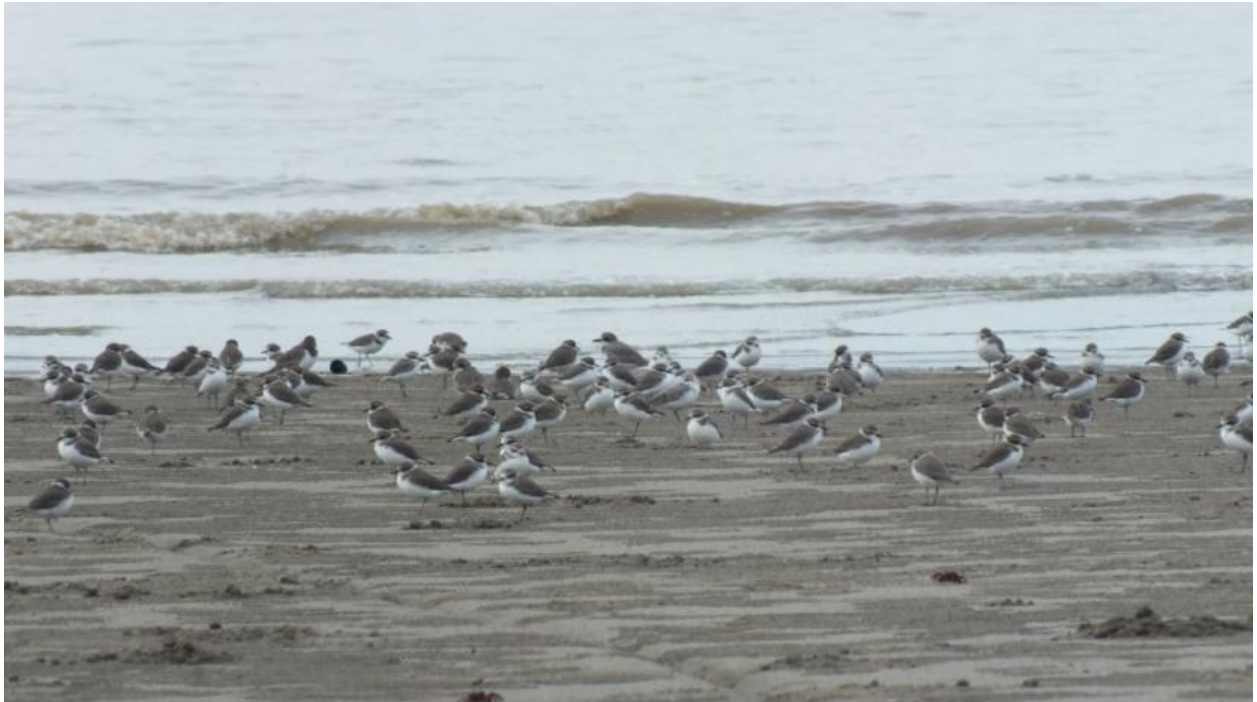
Waders regularly landed near the village

During the capacity building and bird-watching training I met with Aye ko and Nyunt Swe and got wader information on their regular checks on the mudflat at the pre-wintering season between September to November. According to their records, on 5th October some winter visitors landed near the Shwe-thar- hlaung pagoda in Ahlat village. Between September and December the bird flocks were seen at regular places in the morning (7-9 am) and in the evening (3-6 pm) at mid tide. During spring tide, flocks were seen at the same places in the morning (2-3 am) and in the evening (5-6 pm). Some mudflats were not flooded during neap tide and the birds then did not land on their regular places but stayed near the tide. During high tide flocks were seen in the regular places in the afternoon.