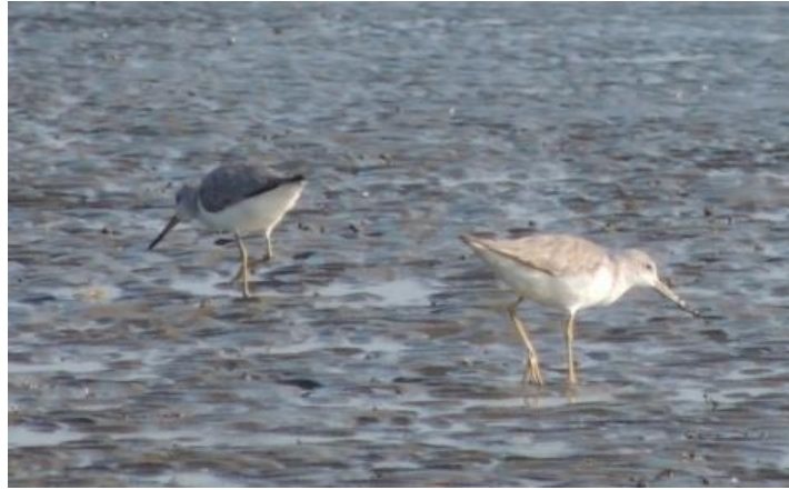
Two of a total of 26 Nordmann's Greenshank

According to Morozov and Archipov (2010) , Black tailed Godwit, Great Knot and also Broad-billed Sandpiper were recorded in slightly higher numbers in January 2010 (almost four years earlier), whereas Nordmann's Greenshank and Eurasian Curlew appeared to be more numerous in 2013.