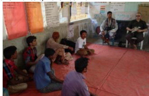
Meeting with ex-hunters and RSPB, April 2013