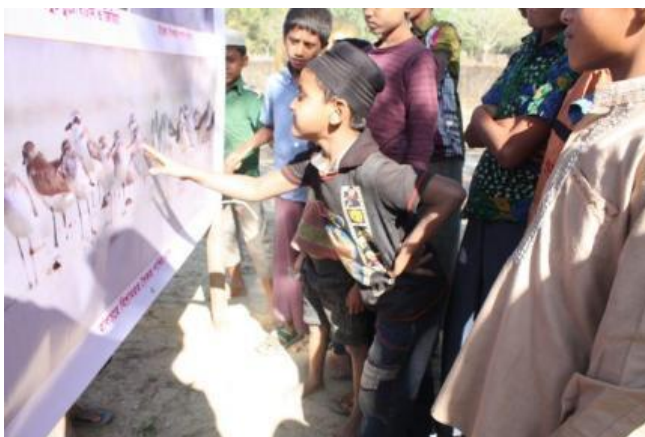
Figure 1. Spoon-billed Sandpiper awareness campaign on Sonadia Island December

In addition to regular monitoring at Sonadia Island, the BSCP team also surveyed Sundarbans (four SBS were recorded from Egg Island on the edge of the Sundarbans on 24 February 1992) in January 2013; 1,542 shorebirds were counted with no SBA (Table 3). Patenga beach of Chittagong and Domar Char (Nijhum Dweep) of Noakhali were also surveyed for SBS but none were found