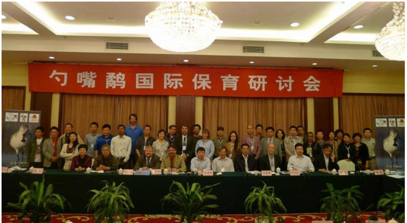
Workshop participants in Rudong 20 Oct 2013

SBS in China organized an extremely successful two day workshop for all interested stake holders who are willing to move Rudong's conservation status to the next level. Participants included provincial and local government officials, national and international NGOs, Universities and the EAAFP secretariat among many others. There were a series of presentations and four workshop sessions (Hunting, Research and monitoring, Spartina control and Site protection/advocacy). There was wide agreement about the actions that were needed in all the workshops but the most important outcome was from the sight protection/advocacy workshop where the need for protection of the core areas was received well by the government officials who were present.