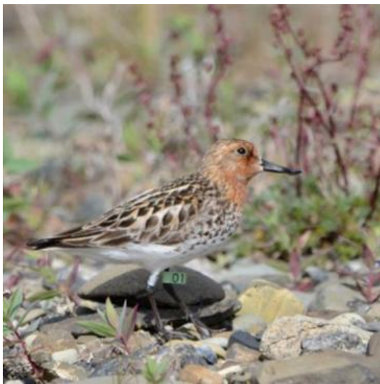
SbS male '01' warning near chicks from a replacement clutch

One more SbS originating from Meinypilgyno was recorded in Rudong area, Jiangsu, southern China, on 5 October 2013 (information from Mr.Zhang Lin). It was carrying a plain light green flag on the right tibia which indicated that this bird was flagged as an unfledged chick. Luckily, the bird was photographed by several observers quite closely from different sides enabling them to read the digits on its metal ring: MOSKVA KS18181. This ring was placed on an SbS chick on 13 July 2010, thus, confirming the origin of this flagged bird.