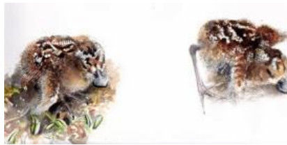
Chicks from Meinypilgyno, 2010