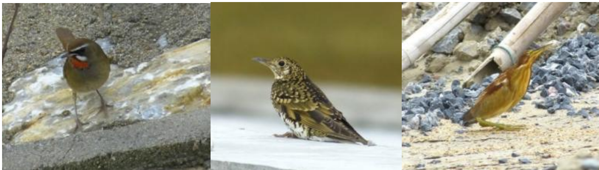
Tired migrants along the seawall at Yangkou: Siberian Rubythroat, White's Thrush & Shrenck's Bittern.

The weather the following day was kinder; dry, overcast and far less windy. With a later tide, there was time to watch waders on the flow tide just south of Haiyin Temple. Concentrating on counting waders required serious self-discipline as large numbers of birds were on the move, from ducks over the sea to hirundines and passerines streaming overhead. Pipits, larks, wagtails and buntings were a constant distraction and as if this wasn't enough, a few Saunders's Gulls and then a Relict Gull (a bird I'd missed on a previous trip to China) arrived as tide peaked and the waders began to flock together. It was clear that after the strong northerlies and passing cold front yesterday there was some serious re-orientation and migration going on! Heading back to yesterday's high tide roost with our driver, tired migrants were very much in evidence along the seawall. Clearly in no state to look for more suitable habitat, a stunning male Siberian Rubythroat blew us all away sat out in the open atop the new concrete seawall. A little further along, a riot of black, white, gold and bronze, a stunning White's Thrush did likewise! Then most bizarrely of all, a Shrenck's Bittern was found hunched alongside a pile of gravel and bamboo canes!