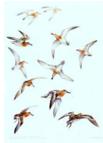
Spoon-billed Sandpiper in flight, Rus. Koshka spit, June 2008

EL: What contribution can artists make to save SBS?