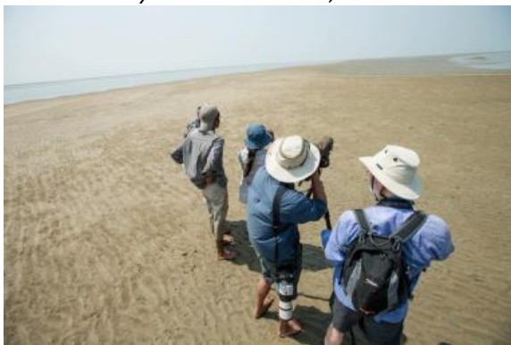
Shorebird survey at Soandia Island with trainees, Mar 13