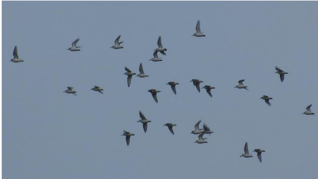
23 Spoon-billed Sandpipers leaving a high tide roost site near Yangkou.

Peregrine. One group of Spoonies was particularly vocal with lots of trilling and interaction going on. Then suddenly part of the flock took flight with other waders, flew overhead doing a couple of circuits of the area, gained height and headed off towards the coast calling frequently. I'd taken a few photos of the flock as they flew overhead but it wasn't until I was back in the hotel that evening that I'd realised I had a few shots of a flock of 23 Spoon-billed Sandpipers flying overhead! The next day, there were far fewer waders at the fishponds and only three Spoonies remained. Had I witnessed a pre-migration gathering? Difficult to be sure but their behaviour and vocalisations were certainly striking.