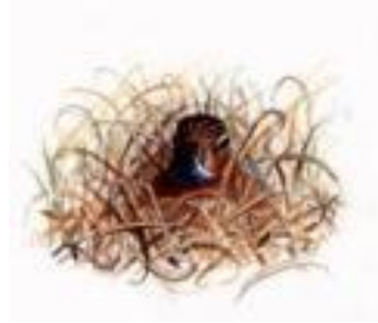
Spoon-billed Sandpiper at nest, Rus. Koshka spit, 2011

JG: Every year since 2000 I have been in the Arctic: 2 times in Northeast Greenland (2000, 2001), 3 times in Swedish Lapland, then in Russia - 1 time in Pechora (2003), 1 time in Franz Josef land (2012), 1 time in Taimyr (2005) and 5 times in Chukotka (2006, 2007, 2008, 2010, 2011): Alaska and Canada 2 times. My impressions from the Arctic will be published in a book, planned to be released in September 2014.