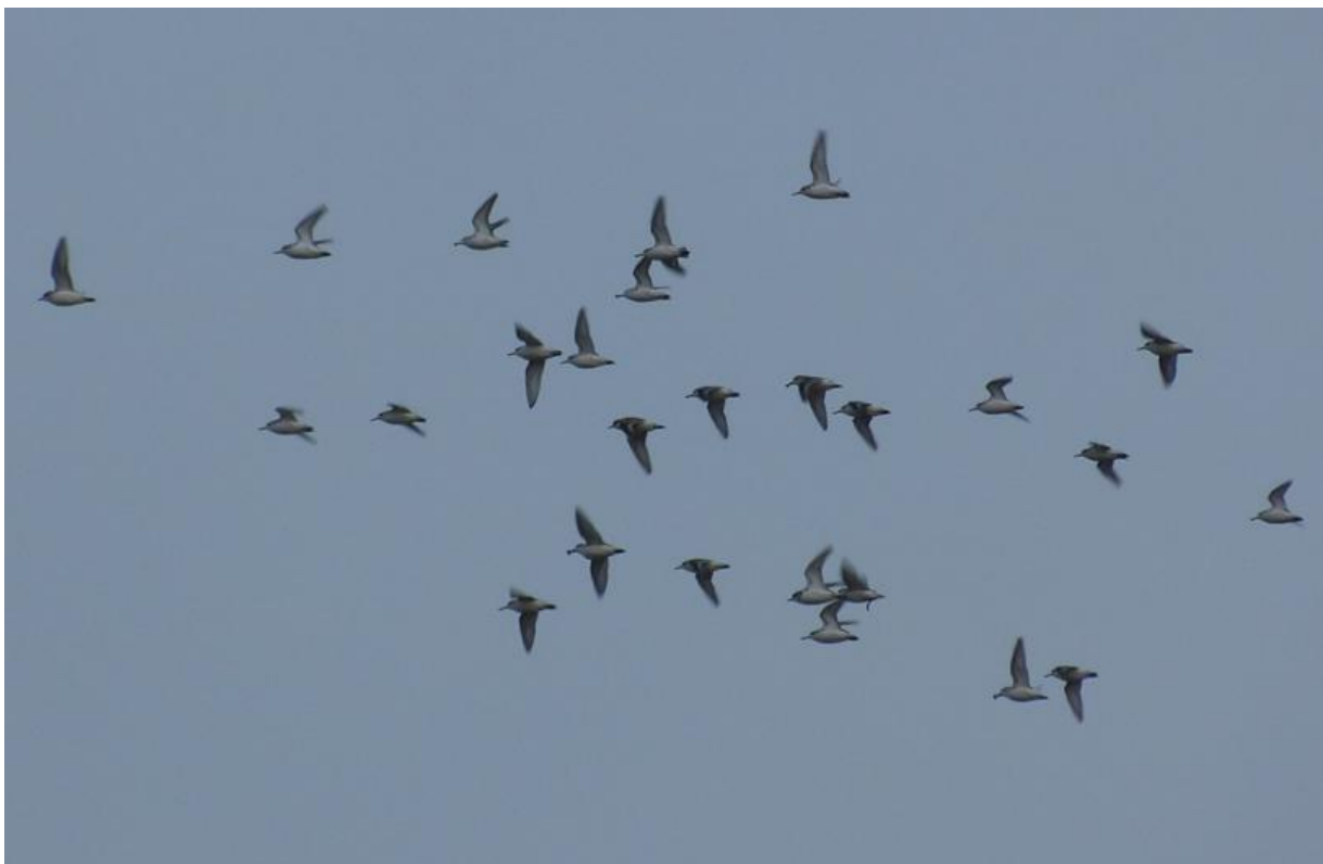
22 or 23 Spoon-billed Sandpiper in Rudong, China