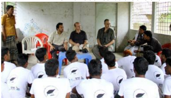
Meeting with ex-hunters, BSCP and RSPB, Nov 2012