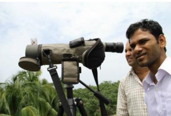
School teachers looking at bird, World Migratory Bird Day, May 2013