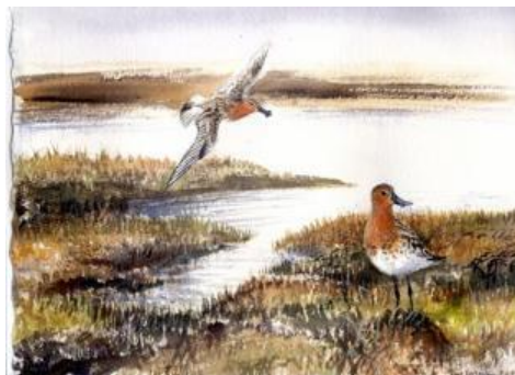
Pair from Russkaya Koshka spit, 2011