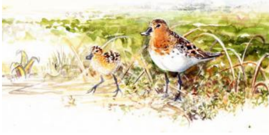
Spoon-billed Sandpiper in Beringovskiy, 2006

EL: What is your brightest memory of observing SBS in the wild?