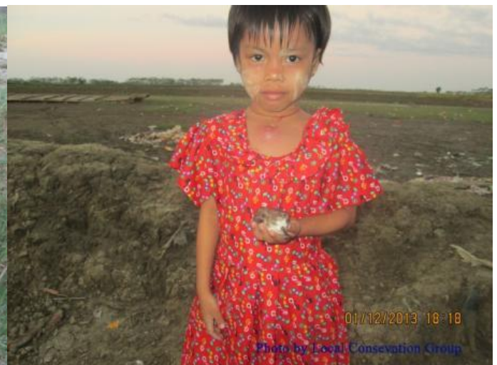
Spoon-billed Sandpiper released by daughter of LCG team leader

This is the benefit of forming Local Conservation Groups in Mottama Gulf. The formation of Local Conservation Groups (LCGs) and training for capacity building is the main requirement for the conservation of Spoon-billed Sandpiper. If additional equipment is supported and capacity building organized for LCGs, the goal for effective conservation of natural resources in the Gulf of Mottama will be achieved and will be able to properly handover to the future generations.