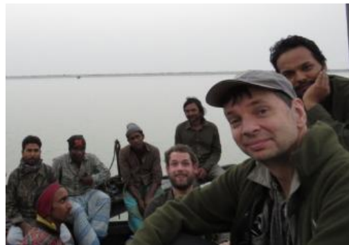
Shorebirds survey in the Sundarbans, Jan 2013