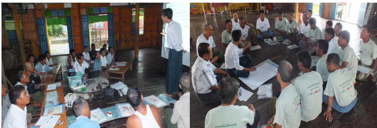
Patrolling and Capacity Building training in Mottama Gulf

After forming the local conservation groups in the Mottama Gulf, BANCA gave capacity building and bird-watching training which included natural resources and biodiversity, facts about the Spoon-billed Sandpiper, the use of digital cameras for proper recordings and bird-watching itself within the framework of Ramsar Convention (CEPA).