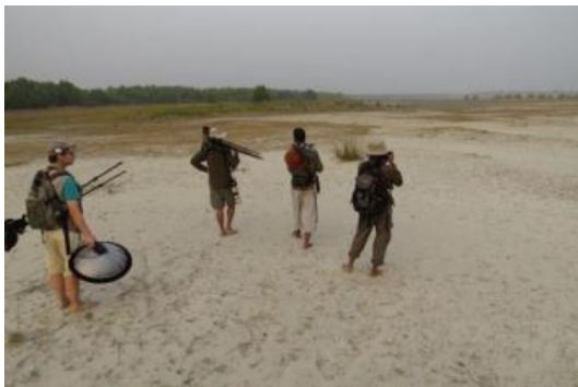
Shorebirds survey in the Sundarbans, Jan 2013