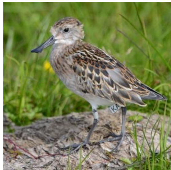
A fledged and released SbS from 'Head Starting Project' in Meinypilgyno, Chukotka on 28 July 2013