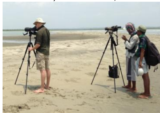
Shorebird survey at Sonadia with RSPB, Apr 13