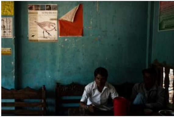
SBS poster in a local restaurant