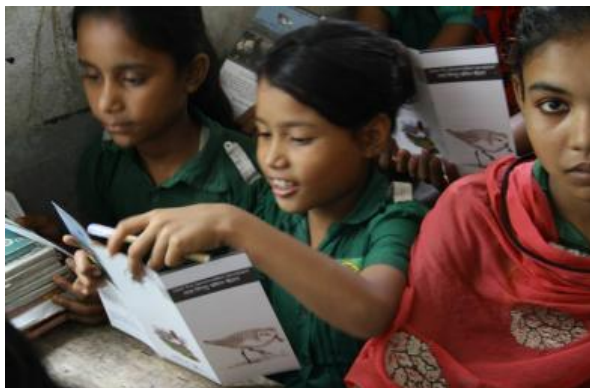
School children reading SBS pamphlet to participate in SBS quiz competition, WMBD May 2013