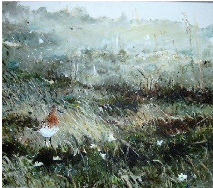
Spoon-billed Sandpiper at breeding conditions, Rus. Koshka spit, 2009 (acryl)