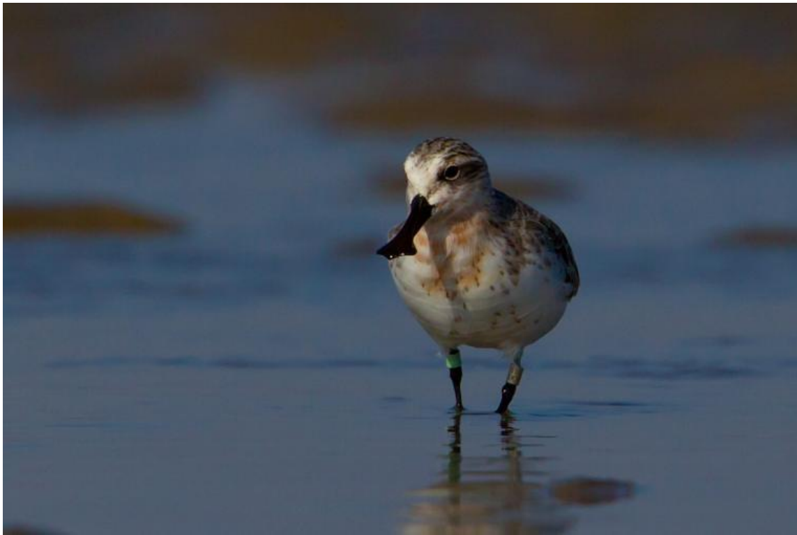
A lime green flagged bird without engraved figures was found in Rudong in October. Photos taken enabled reading the ring combination that indicates it was ringed as chick in 2009 or 2010 in Meinipygino.

In the same area, at least three other individuals with lime green flags were observed during the autumn. One of them was photographed with a metal ring on which some of the characters could be read. Thus its identity could be referred to a chick ringed in July 2013 (see Pavel Tomkovich above)