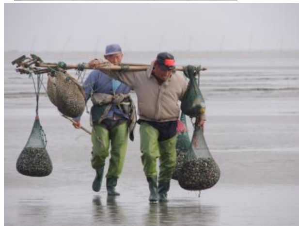
SBS and fishermen share the same kind of habitat and promote its protection