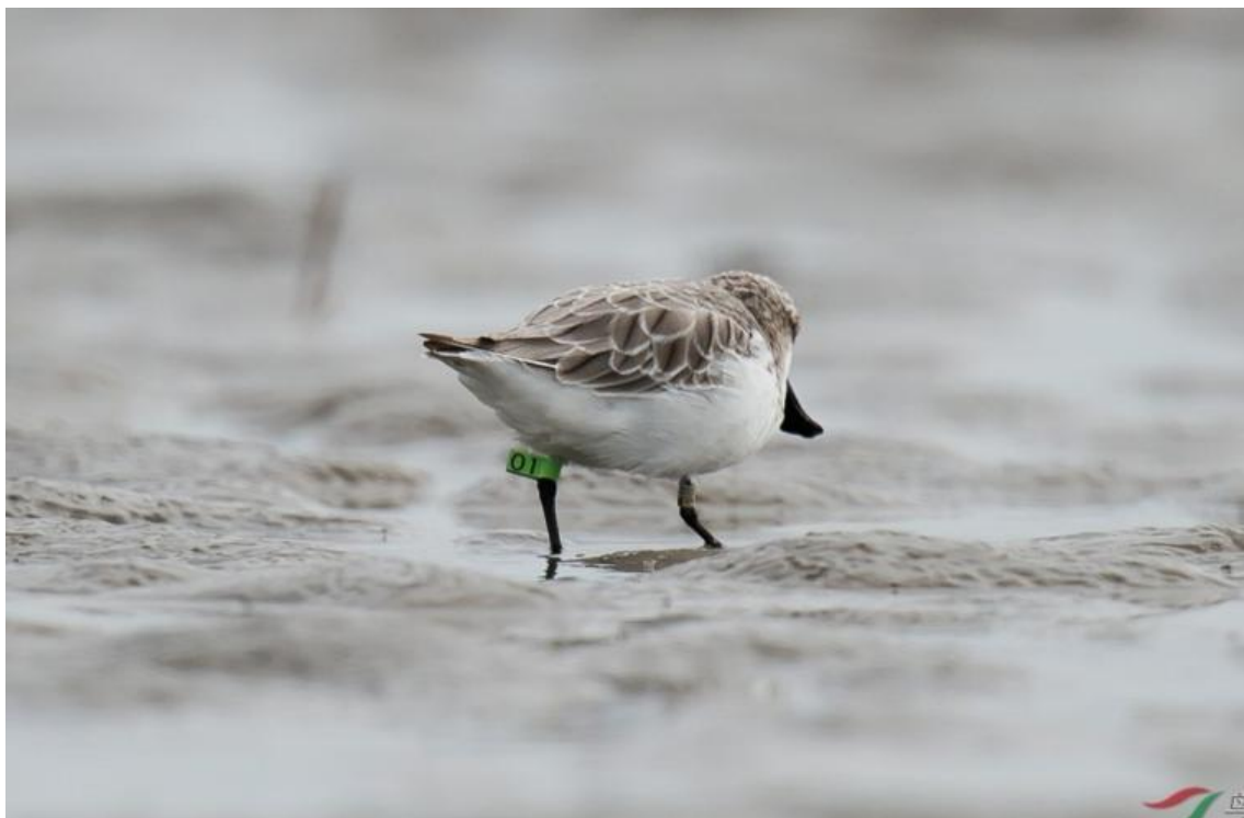
'01' stayed until 9. October and by end of September it had completely changed into winter plumage