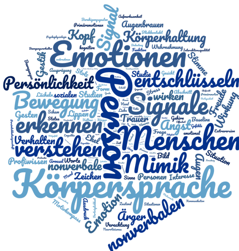
Die Mimikresonanz-Wortwolke: die meist genutzten Wörter in der Profibox