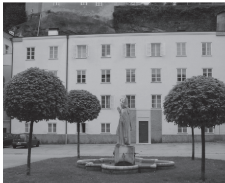
Headquarter Salzburg, St. Peter Bezirk 10, Austria