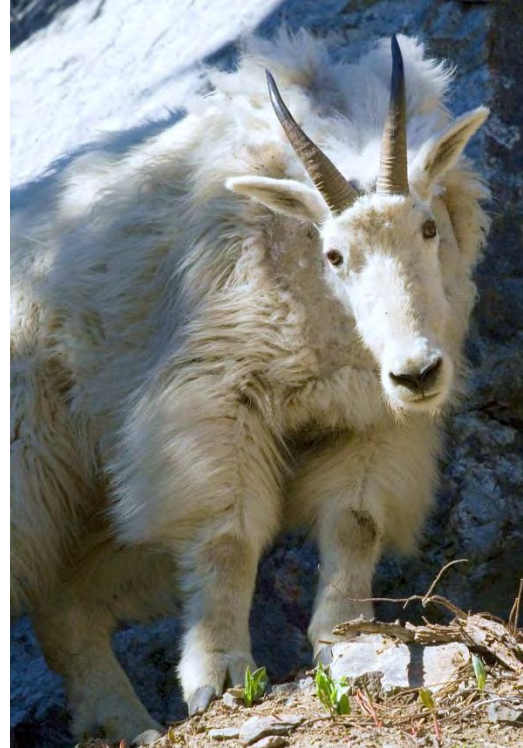
Mountain Goat

Central Idaho has experienced a decline in abundance post-1960, characterized by localized fluctuations. For example, counts from aerial surveys in the Upper South Fork Salmon River drainage went from a high of 95 in 1954 to 9 in 2003. Mountain Goats are sensitive to human disturbance such as resource extraction developments, overharvest, and, particularly, helicopter overflights (Cote 1996). Snow-machining, helicopter-based recreation, and developed ski areas potentially reduce habitat suitability for the species (Hurley 2004, Richards and Cote 2015). Because habitat in Idaho is already limited to the highest elevation mountain ranges, changing temperature and precipitation patterns could affect the amount and quality habitat for this iconic species.