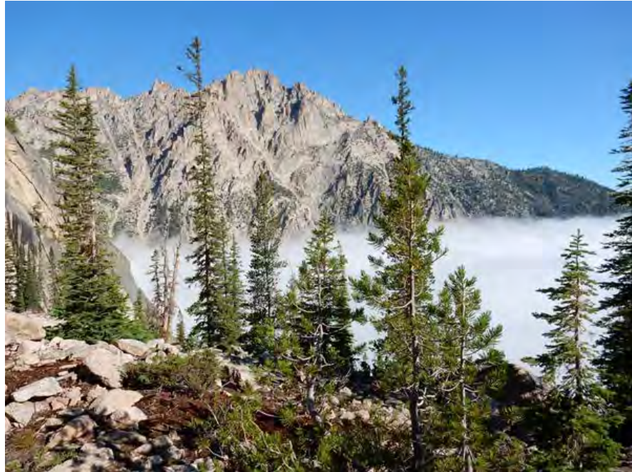
Alpine habitat, Sawtooth Mountains, Idaho

habitat includes grass and sedge communities, heath and willow dwarf shrubland, wet meadow, and sparsely vegetated rock and scree. It is found in and above treeline in cirque basins, adjacent to subalpine lakes, along spring-fed streams, and in avalanche runout zones. The hydrology is tightly associated with snowmelt and springs. In the Idaho Batholith, this habitat occurs at the tops of peaks in the Sawtooth and Salmon River mountains.