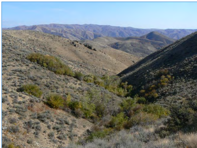
Seep-fed shrublands in Idaho Batholith foothills, Boise River WMA, Boise River, Idaho

and elsewhere. They often form on spring-fed gentle slopes. They are confined to areas with groundwater discharge, specific soil chemistry, and peat accumulation exceeding 30–40 cm in thickness. They are self-supporting, old ecosystems, having been in place since the retreat of Pleistocene glaciers and are thus difficult or impossible to restore. Groundwater maintains a fairly constant water level year-round. They often form on aquifers perched atop less permeable volcanic ash layers in glacial