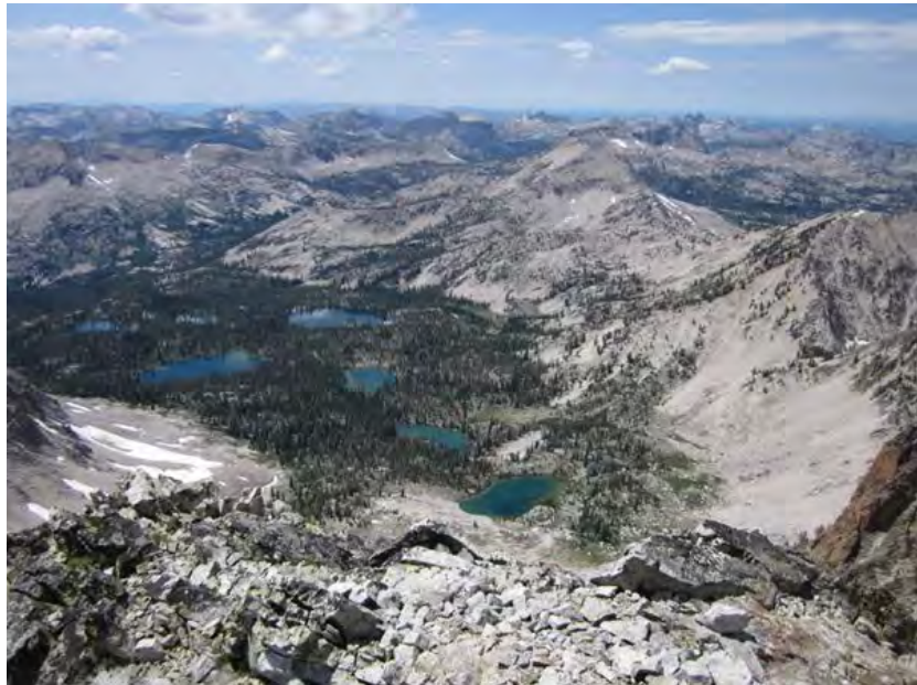
Idaho Batholith, Snowside Peak, Idaho

The Idaho Batholith is the largest ecological section in Idaho, encompassing the remote central part of the state. It extends from the Lochsa River and Montana border in the north to the Snake River Plain in the south (Fig. 4.1, Fig. 4.2). The Batholith is characterized by granitic soils and extensive mountainous terrain with extreme topographic relief, spanning 425 to 3,400 m (1,400 to 11,000 ft). Plate tectonics formed the origin of this region, which was subsequently shaped by glaciers, as evidenced by its alpine ridges, cirques, and large U-shaped valleys with broad bottoms. Average annual temperature ranges from 2 to 7 °C (35 to 46 °F) but may be as low as -4 °C (24 °F) in the high mountains. Annual precipitation ranges from 51 to 203 cm (20 to 80 in), much of which falls as snow during the fall, winter, and spring. Climate is maritime-influenced with cool temperate weather and dry summers.