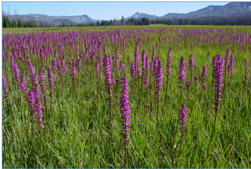
Elk Meadows, Little French Creek, Salmon River, Idaho

localized infiltration of surface water (e.g., snowmelt, precipitation, seasonal flooding).