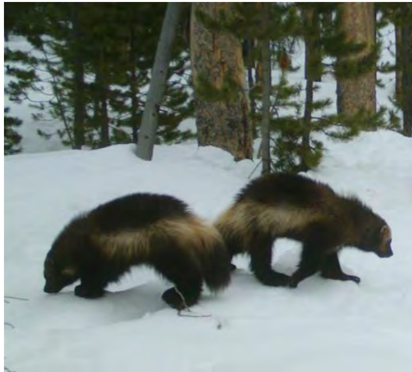
Wolverines captured on remote camera, Sawtooth Mountains, Idaho

Management Plan for the Conservation of Wolverines in Idaho 2014–2019 (IDFG 2014). Wolverines inhabit remote, high-elevation montane habitats centered near alpine treeline where cold, snowy conditions exist for much of the year (Copeland 1996, Copeland et al. 2010, Inman et al. 2013). The Idaho Batholith supports the largest proportion of modeled wolverine habitat in Idaho, and it occurs as a relatively interconnected block due to the configuration of the Batholith. However, this region is near the southernmost extent of the Wolverine's current range