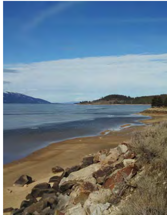
Cascade Reservoir, Idaho

These aquatic habitats include natural lakes, deep ponds, dam-altered naturally formed lakes, and reservoirs constructed for irrigation storage, flood control, and/or hydropower. These waterbodies also are used extensively for water-based recreation. They range from smaller gravel mine ponds and livestock water reservoirs to large lakes in glacial carved valleys. The largest open waterbodies in the Idaho Batholith are Lake Cascade, a reservoir on the North Fork Payette River, and Payette Lake in McCall, a dam-altered natural lake. Three extensive mainstem impoundments on the Boise River and South Fork Boise River—Anderson Ranch, Lucky Peak, and Arrowrock reservoirs—mark the southern boundary of the Idaho Batholith section. The Sawtooth Moraine Lakes are a chain of glacial lakes nestled against the east flank of the Sawtooth Mountains. These lakes (Alturas, Perkins, Pettit, Yellowbelly, Redfish, and Stanley lakes) provide strategic “stepping stone” refugia for waterbirds, waterfowl, and shorebirds migrating through the central Idaho mountains. Redfish, Pettit, and Alturas lakes support natural production of endangered Snake River Sockeye Salmon.