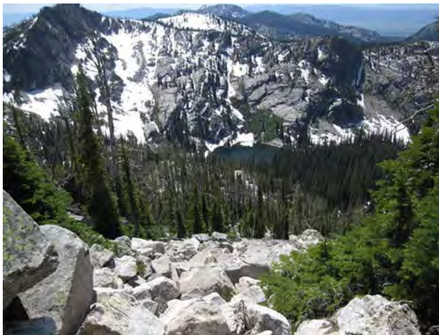
Buckhorn Lake, Idaho

Alpine lakes, also called “high mountain lakes” are a distinct category of Lakes, Ponds & Reservoirs that occur at upper montane and subalpine elevations. High mountain lakes typically form in glacial ice-carved basins (e.g., cirques) where bedrock or moraine deposits create a depression. The surrounding cirque wall slopes are often steep and prone to rock and gravel deposits from eroding peaks and avalanche disturbance. High mountain lakes can occur in a series or in hanging valleys. High mountain lakes are more functionally defined as “those you can’t drive to.” Of the estimated >3,000 high mountain lakes in Idaho, over two-