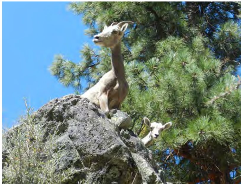
Bighorn Sheep ewe and lamb, Salmon River, Idaho

Fair. Bighorn Sheep numbers are much reduced from the 1980s in all three PMUs in the Idaho Batholith. Disease is established in the Lower Panther–Main Salmon River and Lower Salmon River PMUs, resulting in low lamb survival and recruitment for a number of years. However, some herds remain relatively unaffected by disease. The status of disease in the Selway PMU is uncertain and recent surveys suggest good lamb survival, creating uncertainty as to why this population continues to decline (IDFG 2010). Noxious weeds and encroachment of conifer forests due to fire suppression have affected habitat quality to some degree in the Batholith. Because of the remoteness and management designation of much of the occupied range in this section, issues associated with human development are relatively low. The northeastern corner of the Batholith is an exception, where high road densities, potential mining and geothermal energy development, and timber harvest could negatively affect populations and habitat.