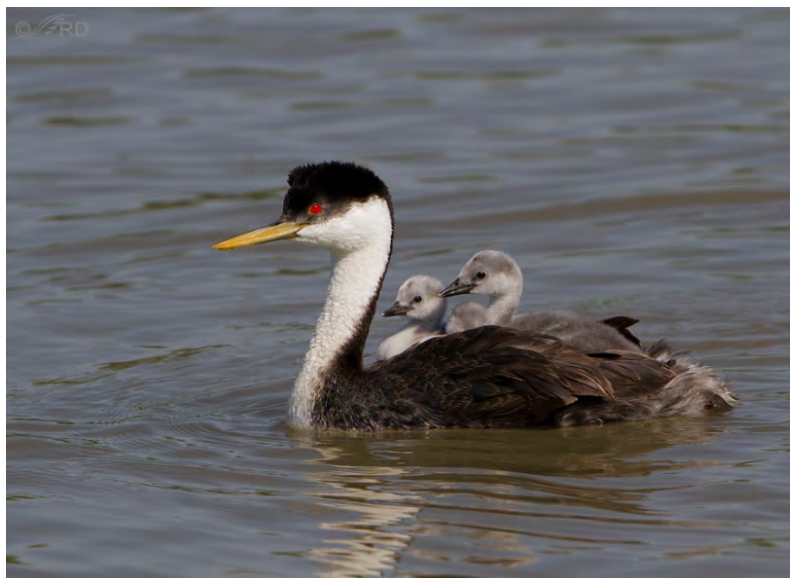
Western Grebe with chicks

Western and Clark's Grebes are so similar in appearance, and perform the same rituals during courtship, that until 1985 they were considered different color phases of the same species. In Idaho they occur together at breeding sites, although Western Grebe far outnumbered Clark's Grebe. These 2 grebes nest in colonies, and Lake Cascade in the Idaho Batholith supports the largest nesting concentration in the state, upwards of 700 nests in some seasons. Lake Cascade was designated an Idaho Important Bird Area in part because of this nesting grebe concentration. Grebes on Lake Cascade likely benefited from IDFG's efforts to recover the Yellow Perch ( Perca flavescens ) fishery in these waters in recent years.