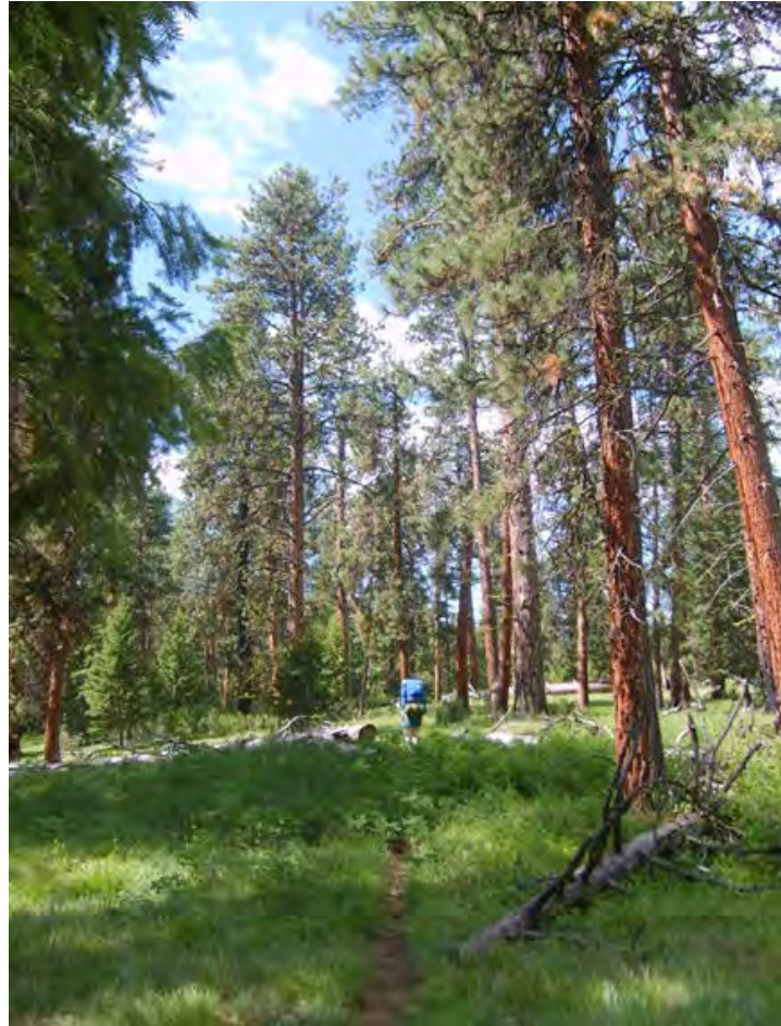
Dry Lower Montane–Foothill Forest, Grass Mountain, Idaho

Dry Lower Montane–Foothill Forest is a significant habitat in the Idaho Batholith. It accounts for more land area than any other vegetation type in this section and restoration is a high priority on federal land. This conifer forest habitat occurs at lower elevations and along major river corridors. It is typically the first forest zone above grassland or shrubland and transitions to subalpine forest at the higher-elevation end of its range. Ponderosa pine ( Pinus ponderosa Lawson & C. Lawson) and Douglas-fir ( Pseudotsuga menziesii [Mirb.] Franco) are dominant tree species, occurring in open stands with a variety of grasses and/or shrubs in the understory such as pinegrass ( Calamagrostis rubescens Buckley), Idaho fescue ( Festuca idahoensis Elmer), mallow ninebark ( Physocarpus malvaceus [Greene] Kuntze), white spirea ( Spiraea betulifolia Pall.), and snowberry ( Symphoricarpos Duham.). Frequent, low-intensity wildfire historically maintained open-stand conditions with widely spaced large trees. These forests have been important for timber harvest and recreation due to their accessibility.