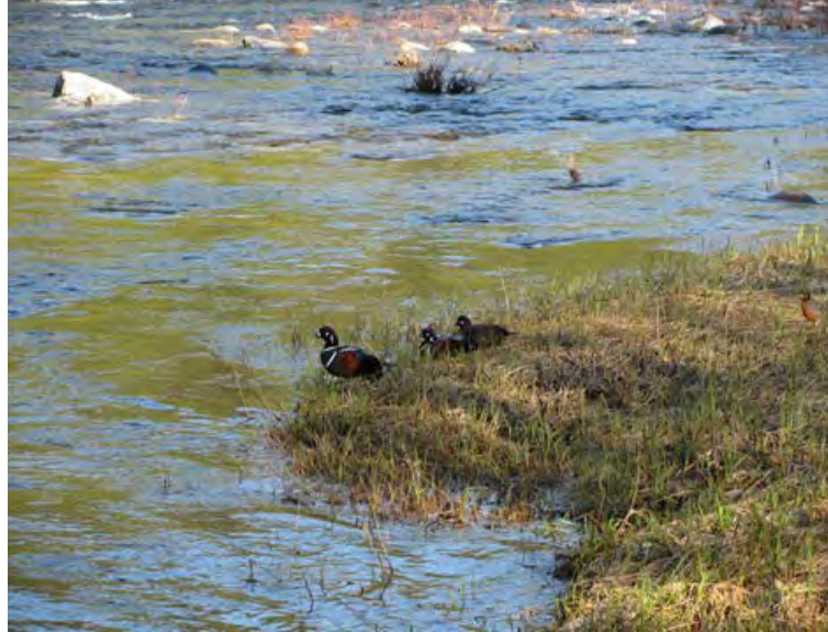
Lochsa River, Idaho

This diverse habitat includes small, narrow headwater and montane streams with high gradients and water velocities, lower-gradient larger streams and rivers, and the riparian habitats associated with these watercourses. Headwater stream habitat typically supports fewer pools and more rapids, and is dominated by boulders, cobbles, gravel, and less mobile large woody debris. They export much of the fine material in the watershed. Aquatic communities are usually dominated by shredder and collector macroinvertebrates and small fish (e.g., juvenile salmonids, sculpin [ Cottus spp.], etc.). Larger streams and rivers are characterized by pools, riffles, and glides which allow for deposition of cobble, gravel, sand, and woody debris on alluvial bars and the formation of floodplains in wider valleys.