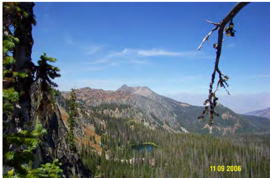
Subalpine–High Montane Conifer Forest, Patrick Butte, Idaho, 2006 IDFG

Whitebark pine ( Pinus albicaulis Engelm.) replaces most other tree species at the highest elevations of this forest type and is a keystone species because of its role in stabilizing soil, trapping soil moisture, early