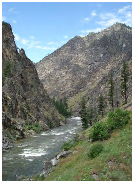
Lower Montane–Foothill Grassland & Shrubland, South Fork Salmon River, Idaho

Lower Montane–Foothill Grassland & Shrubland is a fire-maintained ecosystem with warm, dry summers and cool, moist winters. Fire-maintained grasslands are comprised of perennial bunchgrasses (e.g., bluebunch wheatgrass