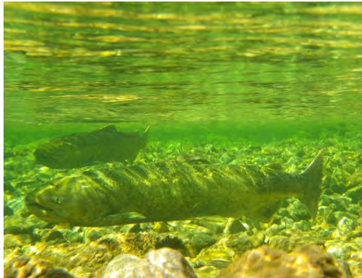
Chinook, Beaver Creek, Idaho

Current distributions, limited by human alteration in many watersheds and greatly diminished from historical abundances, are limited to 2 major free-flowing subbasins of the Snake River: the Clearwater and Salmon. All three of these important game species are under ESA protection and are the focus of considerable effort and funding for conservation, mitigation, and supplementation (Northwest Power and Conservation Council 2014).