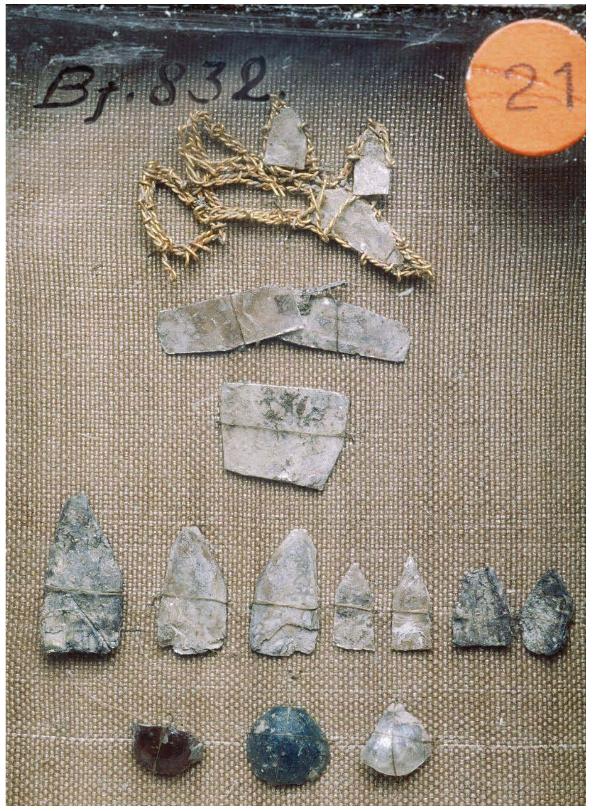
Birka Grave 832 (http://mis.historiska.se/mis/sok/fid.asp?fid=617954)