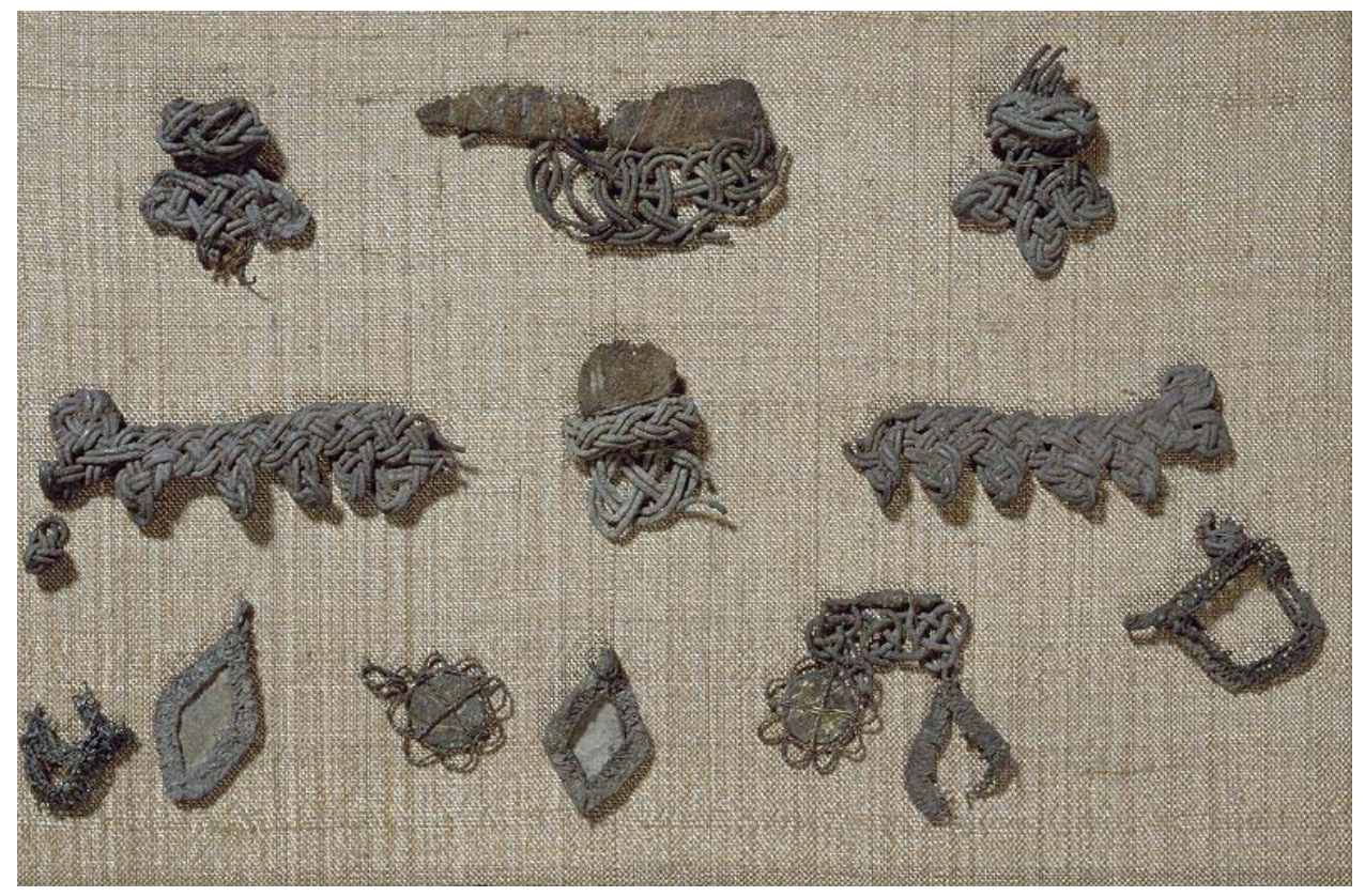
Complete suite from Grave 524