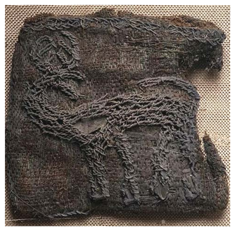
Birka Grave 735 (http://mis.historiska.se/mis/sok/bild.asp?uid=340585)