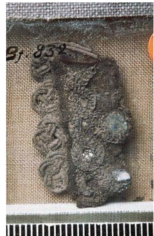
Birka Grave 832 (http://mis.historiska.se/mis/sok/bild.asp?uid= 349622&page=1&in=1)