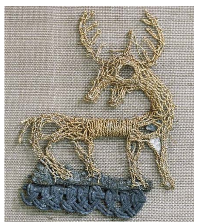
Birka Grave 832 (http://mis.historiska.se/mis/sok/bild.asp?uid= 394548)