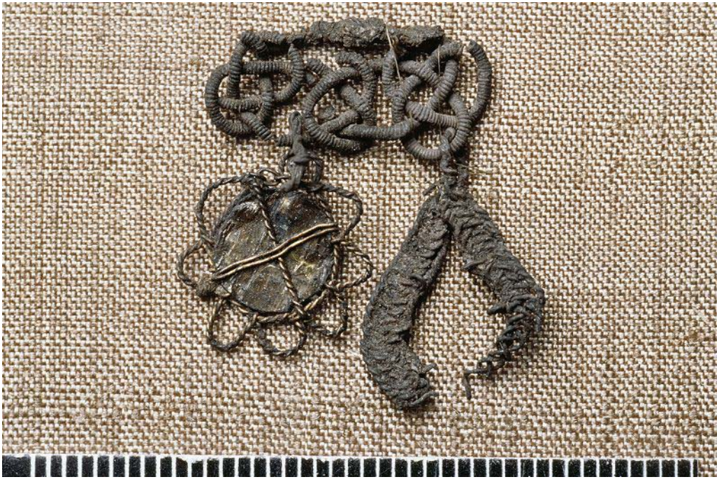
Birka Grave 524 (http://mis.historiska.se/mis/sok/bild.asp?uid=349357)