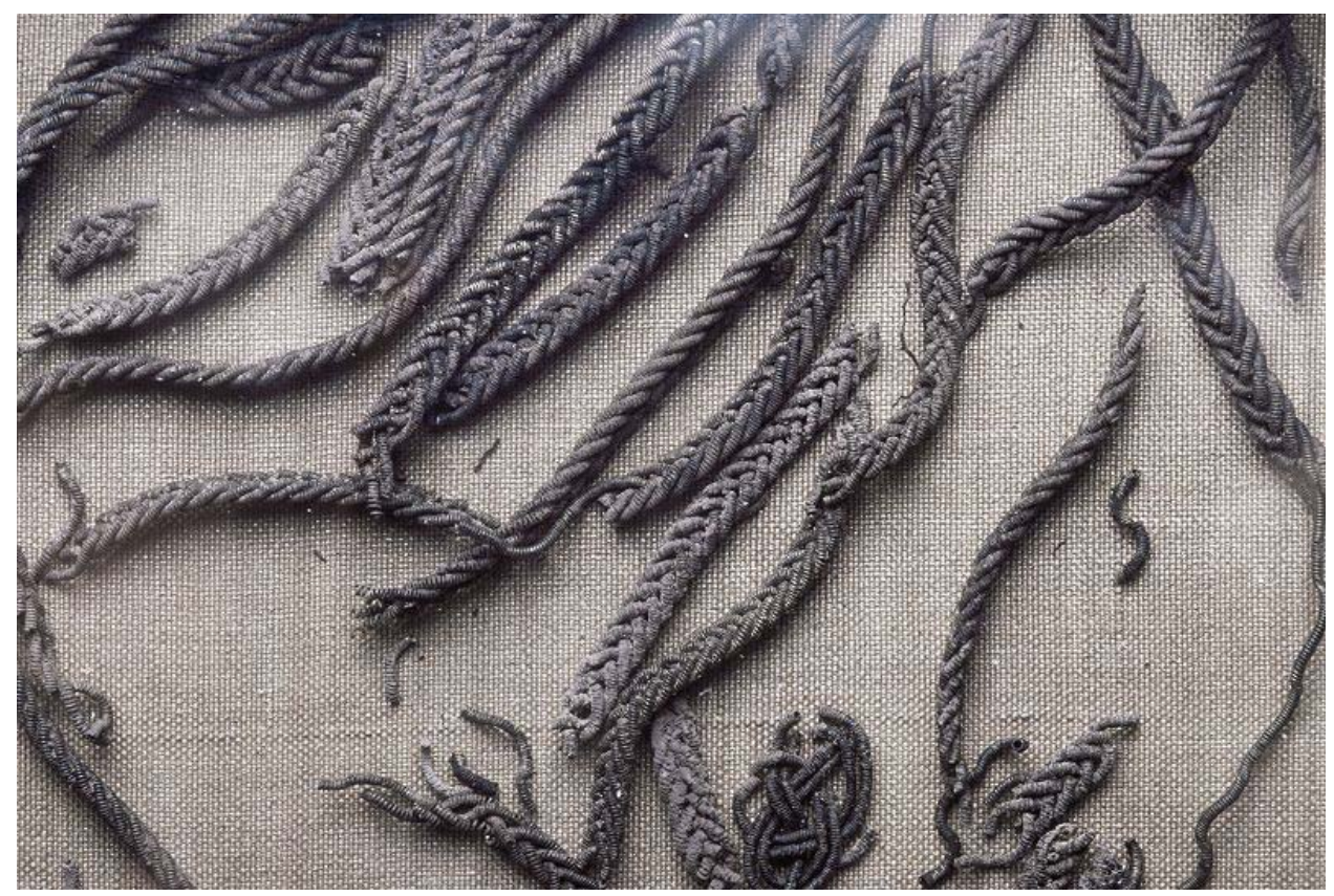
Birka Grave 886 (http://mis.historiska.se/mis/sok/fid.asp?fid=616595&g=1)