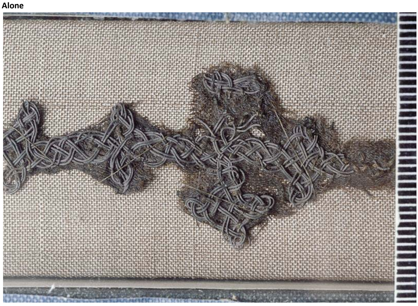
Birka Grave 739 (http://mis.historiska.se/mis/sok/bild.asp?uid=349354) This posament remains attached to the silk it was appliqued to. The wire used in this is listed as bronze.