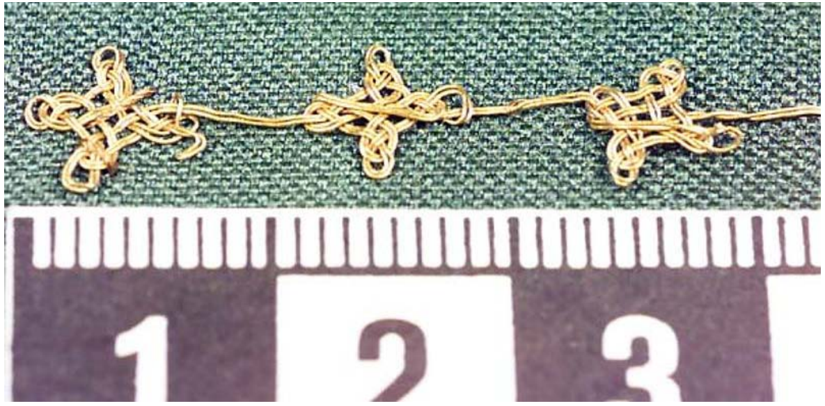
Birka Grave 736 (http://mis.historiska.se/mis/sok/bild.asp?uid=59490)