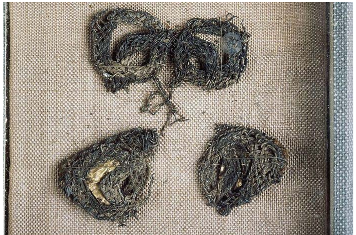
Birka Grave 644 (http://mis.historiska.se/mis/sok/fid.asp?fid=617951)