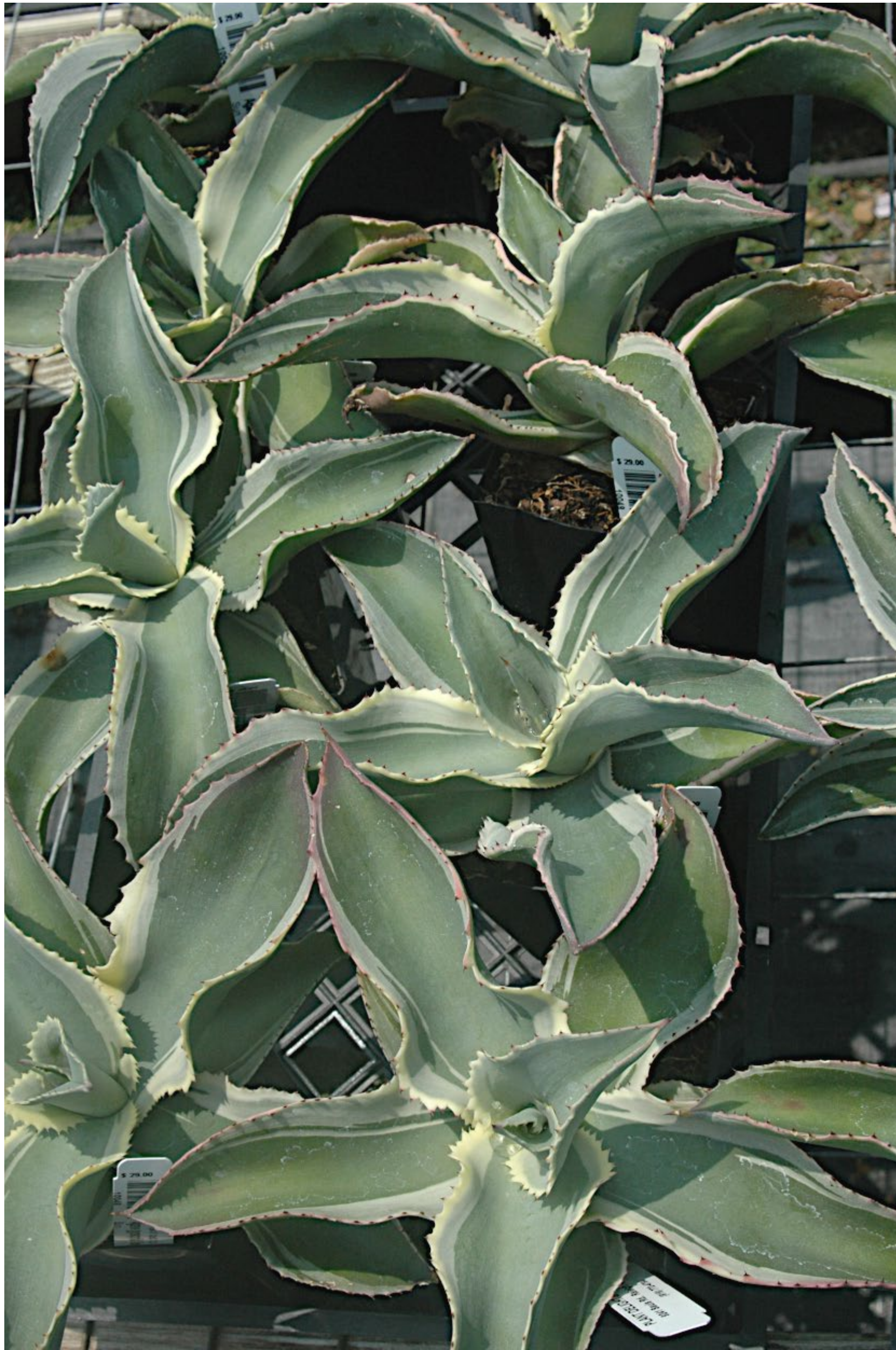
Agave gypsophila ssp. pablocarrilloi . 'Ivory Curls' develops a lovely twist and marginal undulate even a young plants. The combination of subtle frosty, powdery blue and a uniformly wide, ivory margin is absolutely perfect. Newest margins are light yellow. The margins often develop an internal, submarginal stripe or two. They don't offset too well