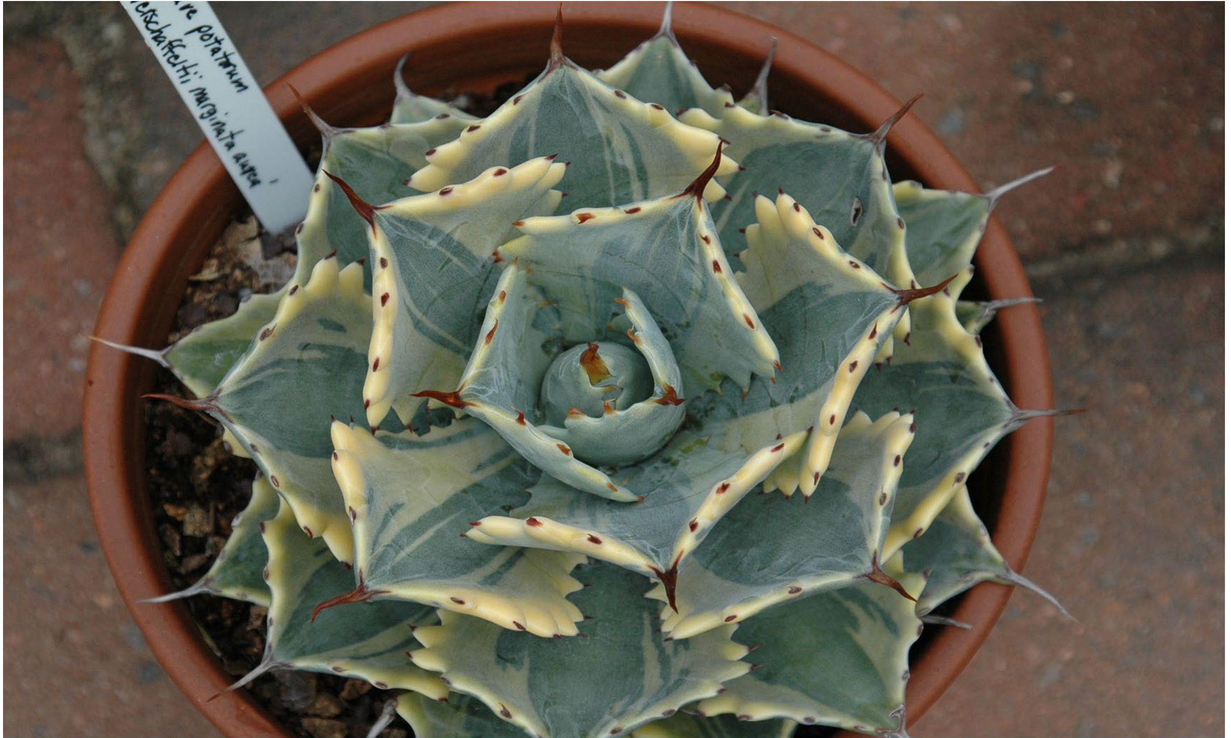
Agave potatorum var. verschaffeltii 'Marginata Aurea'

Agave 'Kissho Kan' ('Kichiokan', 'Kissyokan?', 'Kichijokan', A potatorum 'Variegata' in part)