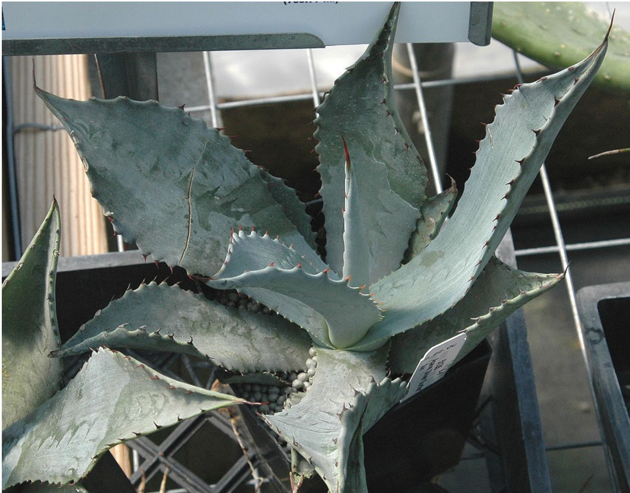
A lovely color as sold at PDN in March 2008.