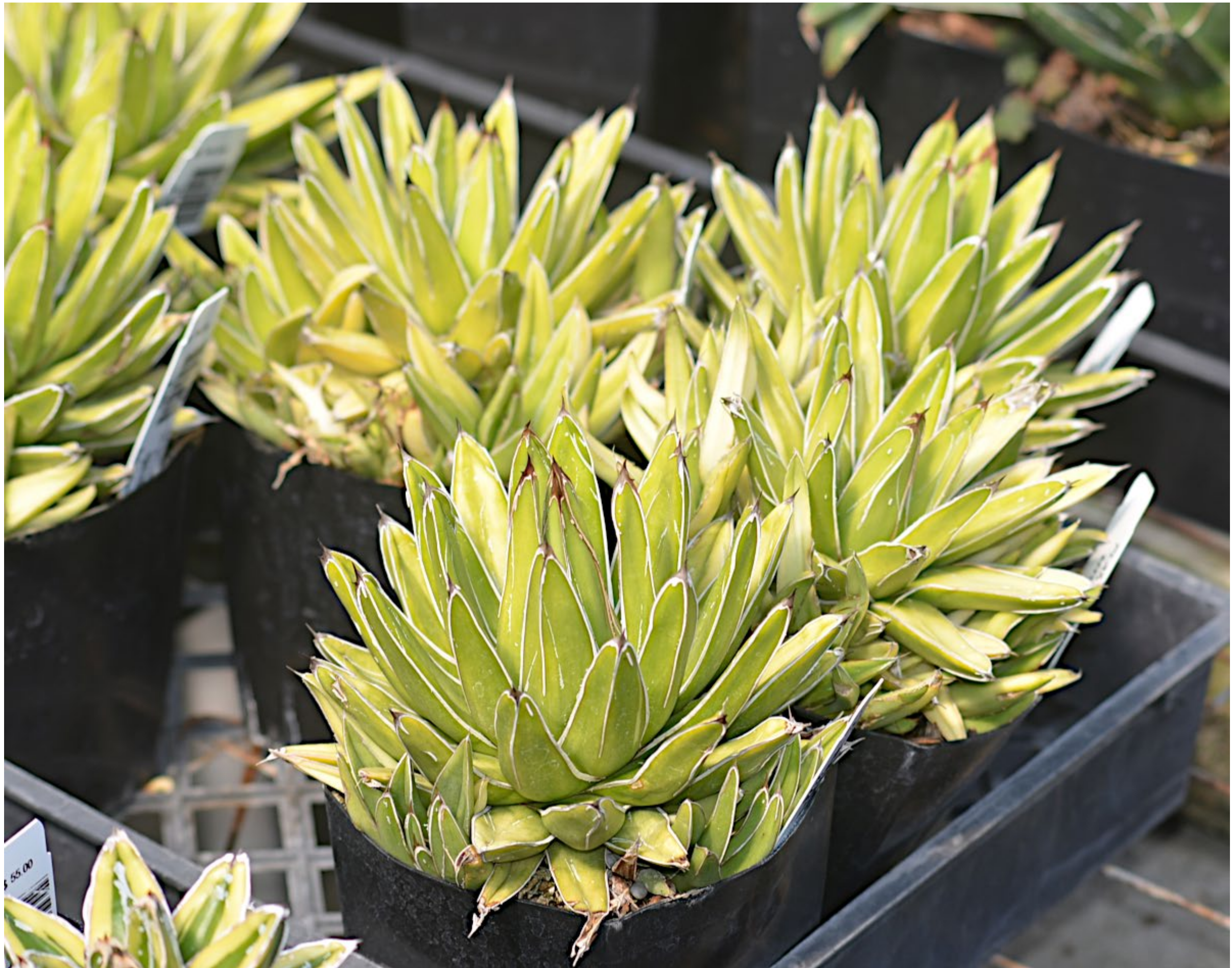
Agave victoria-reginae 'Golden Surprise' at Plant Delights sales yard.

Agave victoria-reginae 'Himesan-no-yuki' ('Himesanoyuki', literally "snow princess" http://media.huntington.org/ISI/ISI2019/2019-14.html )