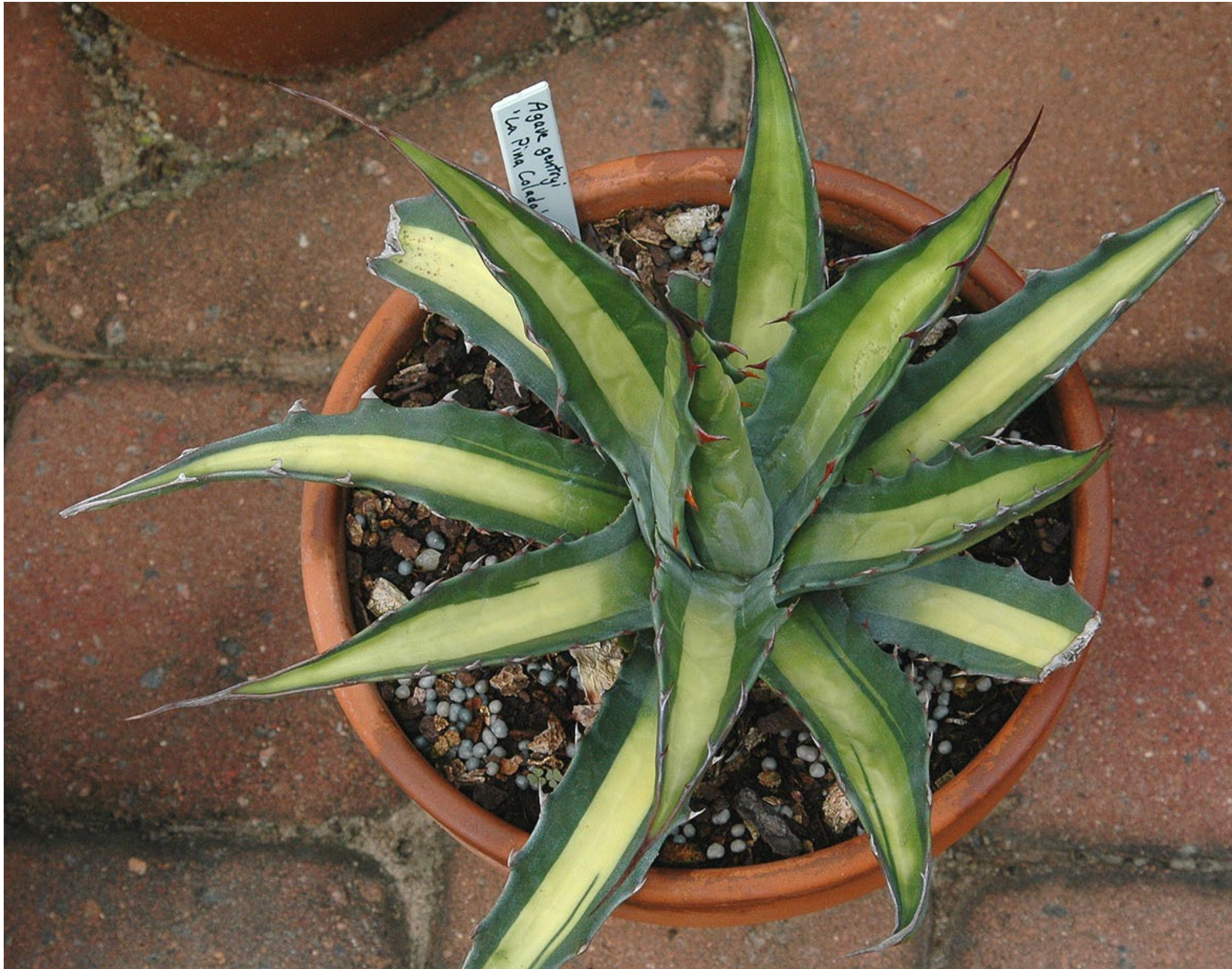
Agave gentryi 'La Pina Colata'

lc: center zone yellow to greenish-yellow at 30–40%, margins dark green, numerous glaucous flushes at leaf bases lm: numerous downward-facing dark red to brownish-red teeth, 6–10 per side