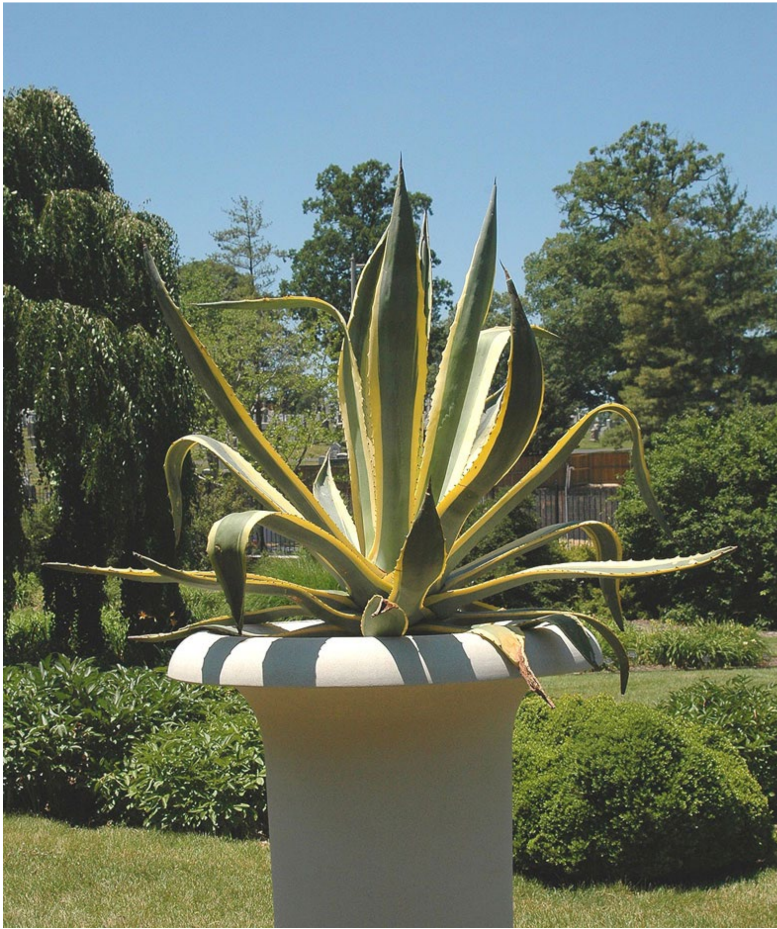
Perennial Trials, US National Arboretum. A lovely example in the traditional type of urn used for Agave for centuries. This plant was unnamed so perhaps it belongs to 'Marginata Aurea'.