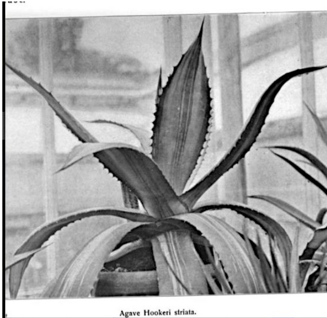
Agave Hookeri striata.

Agave potatorum var. verschaffeltii 'Striata' from Trelease 1908. Hard to place today but based on Trelease's image above clearly not a dwarf nor tiny clone.