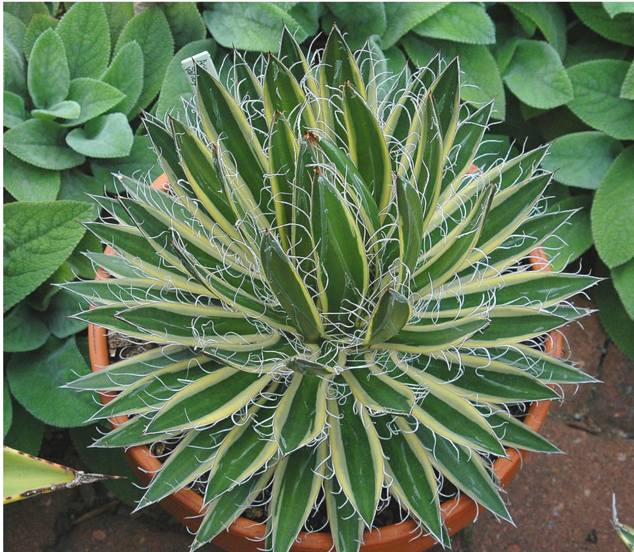
Agave filifera 'Variegata Compacta'

An outstanding small variegated clone. The name may not prove to be valid as many Latin names in this genus are recent. This may prove to be the same as A. schidgera 'Shira Ito no Ohi' (see below)