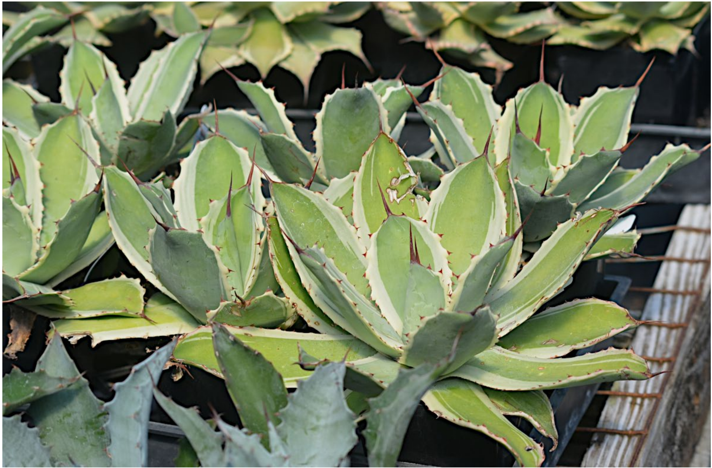
Agave potatorum 'Snowfall'. Plant Delights 2019.