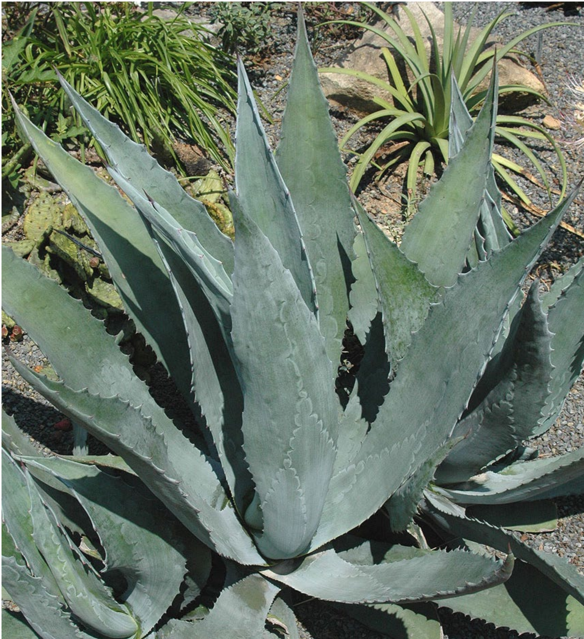
Juniper Level Botanic Garden. September 2006.

Agave americana subsp. protoamericana 'Miquihuana Silver' (11/4)