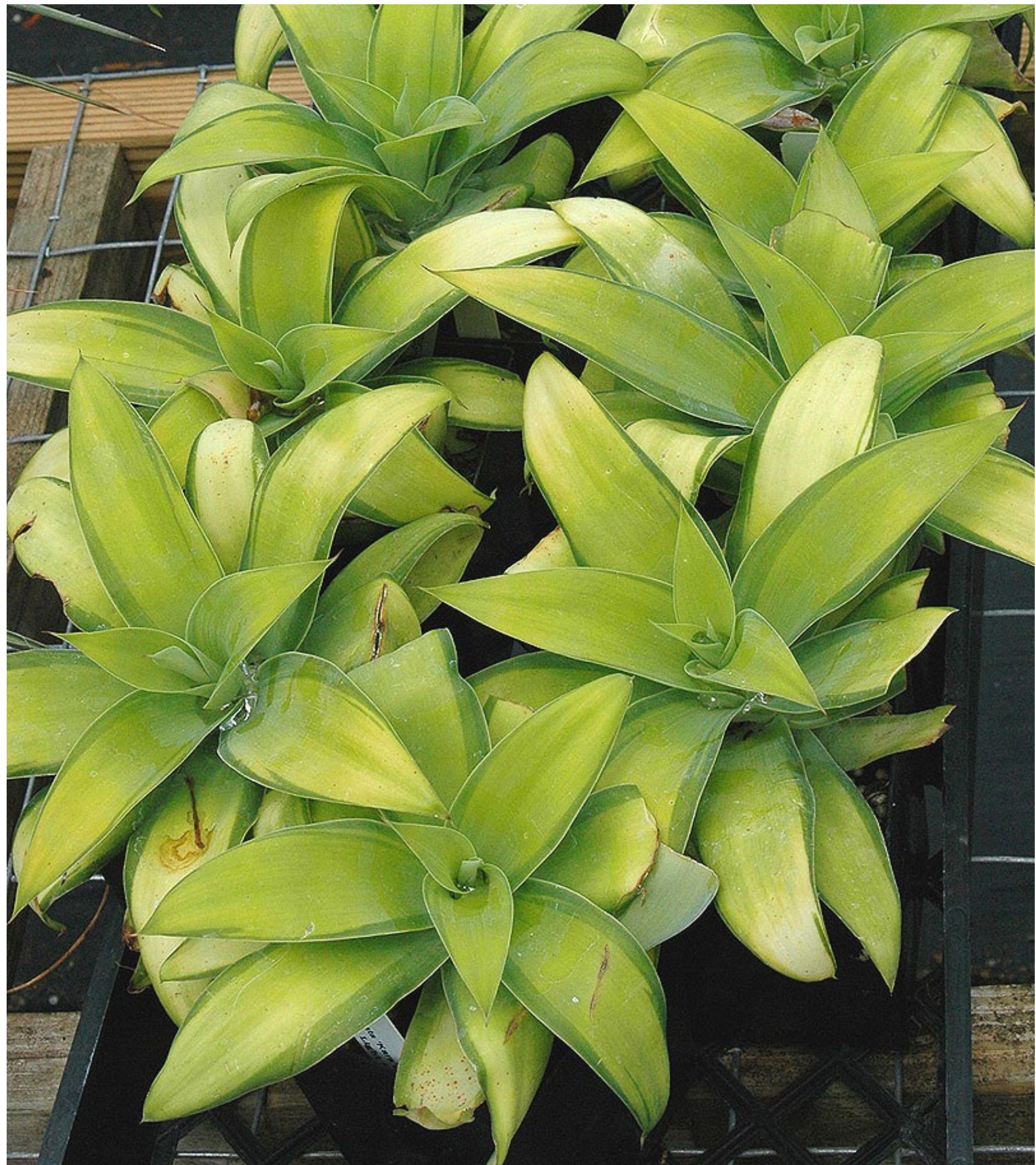
Plant Delights Nursery, 2007.