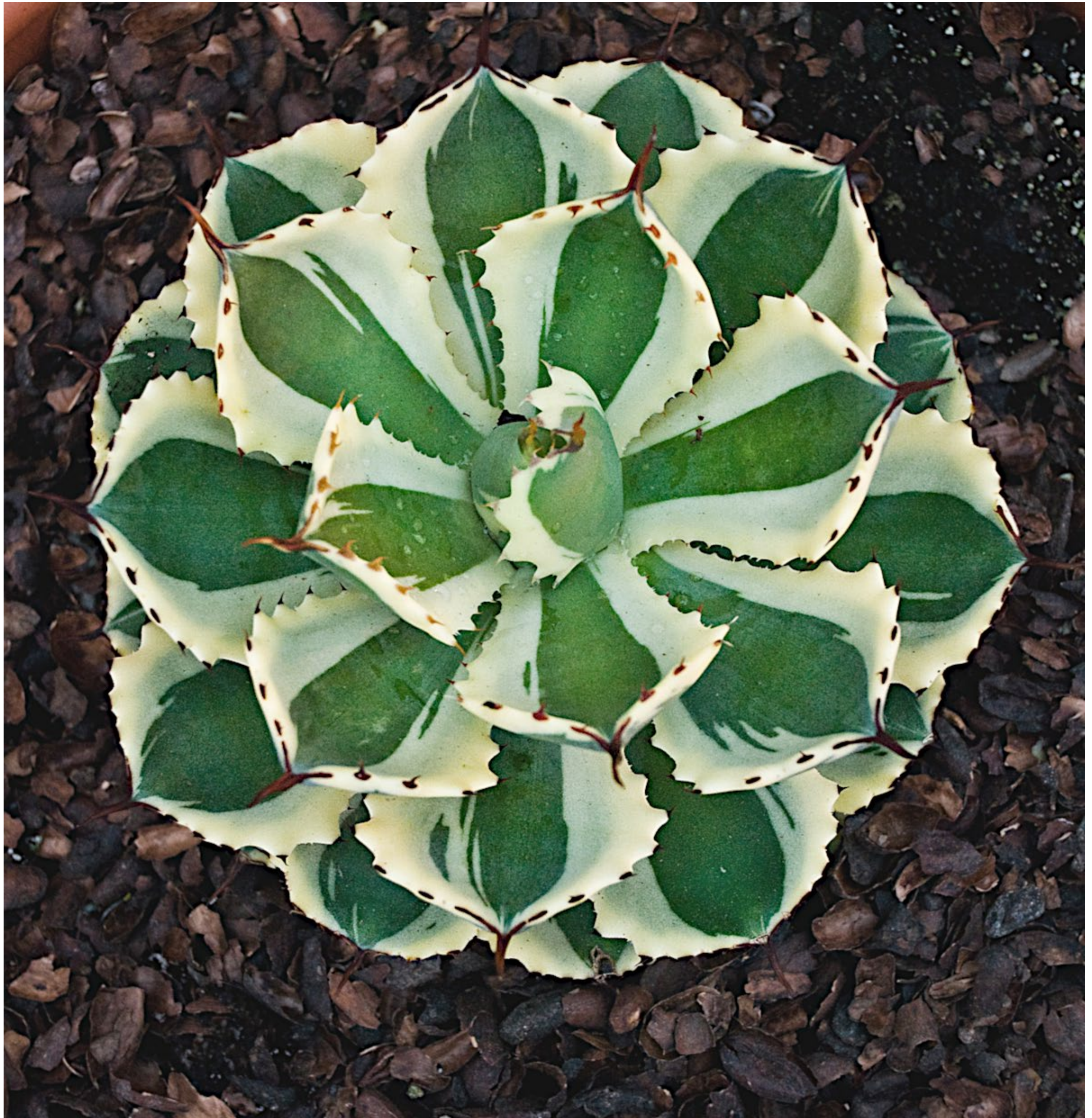
Agave 'Desert Diamond' is a mutant from 'Kissho Kan' (bluer, and edge more yellowish) and thus without a clearly known species or parentage. It was introduced by Hans Hansen of Walters Gardens in 2013 as more colorful clone and one that is a bit slower too. They become about 16 inches tall and wide, offsetting with rarity.