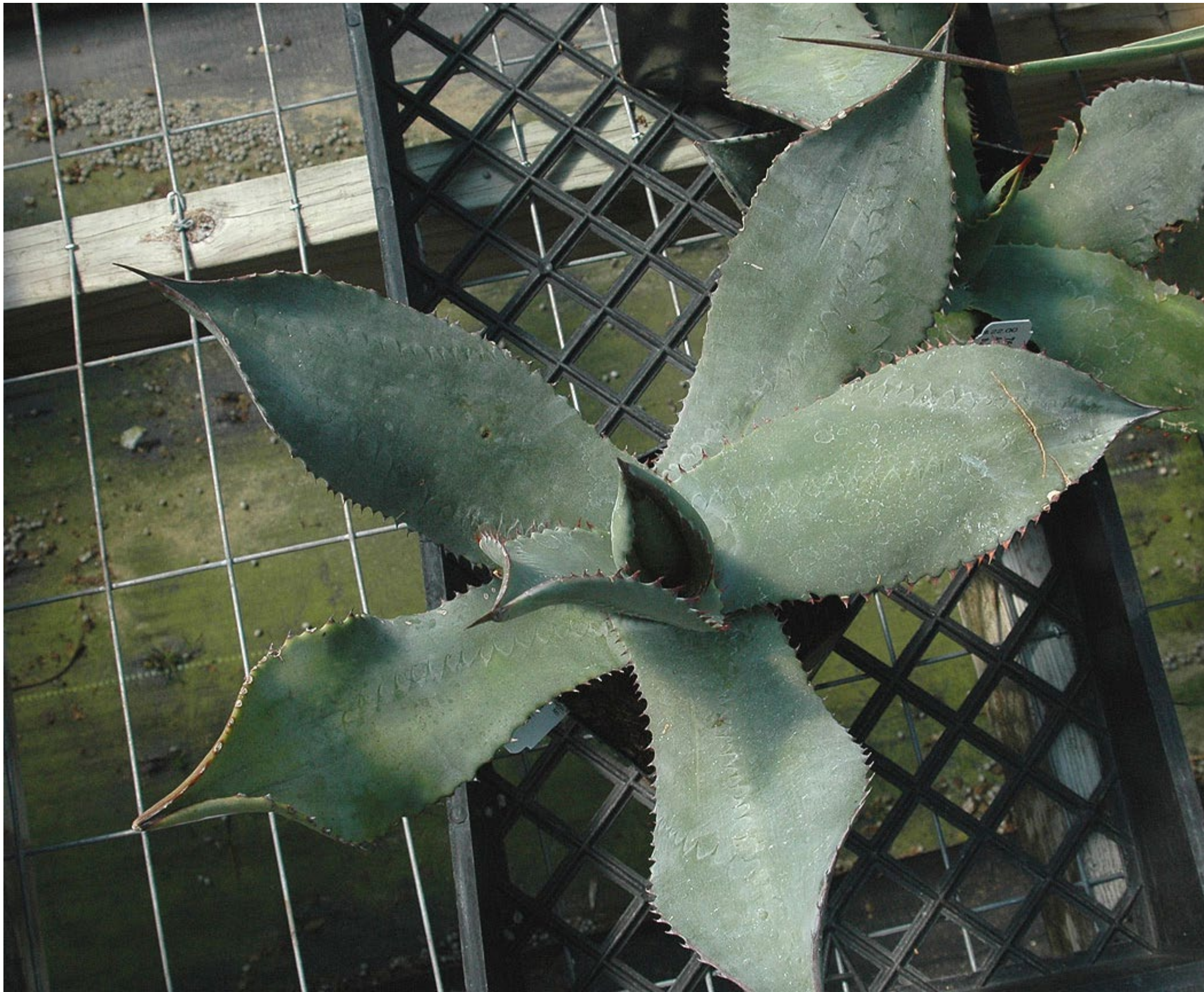
Plant Delights Nursery. March 2008.