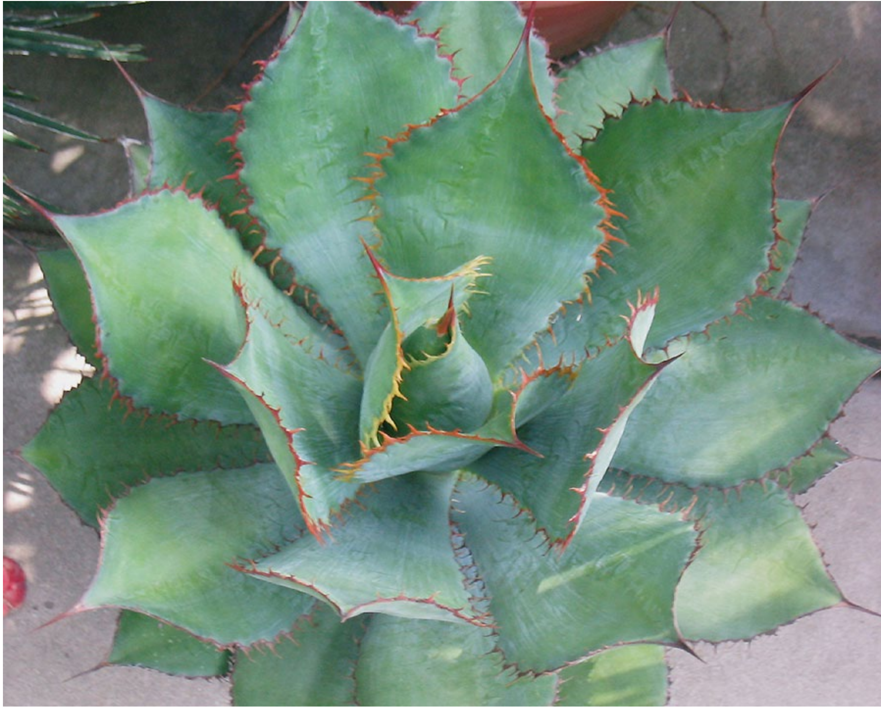
Agave bovicornuta REGGAE TIME® (11/8)