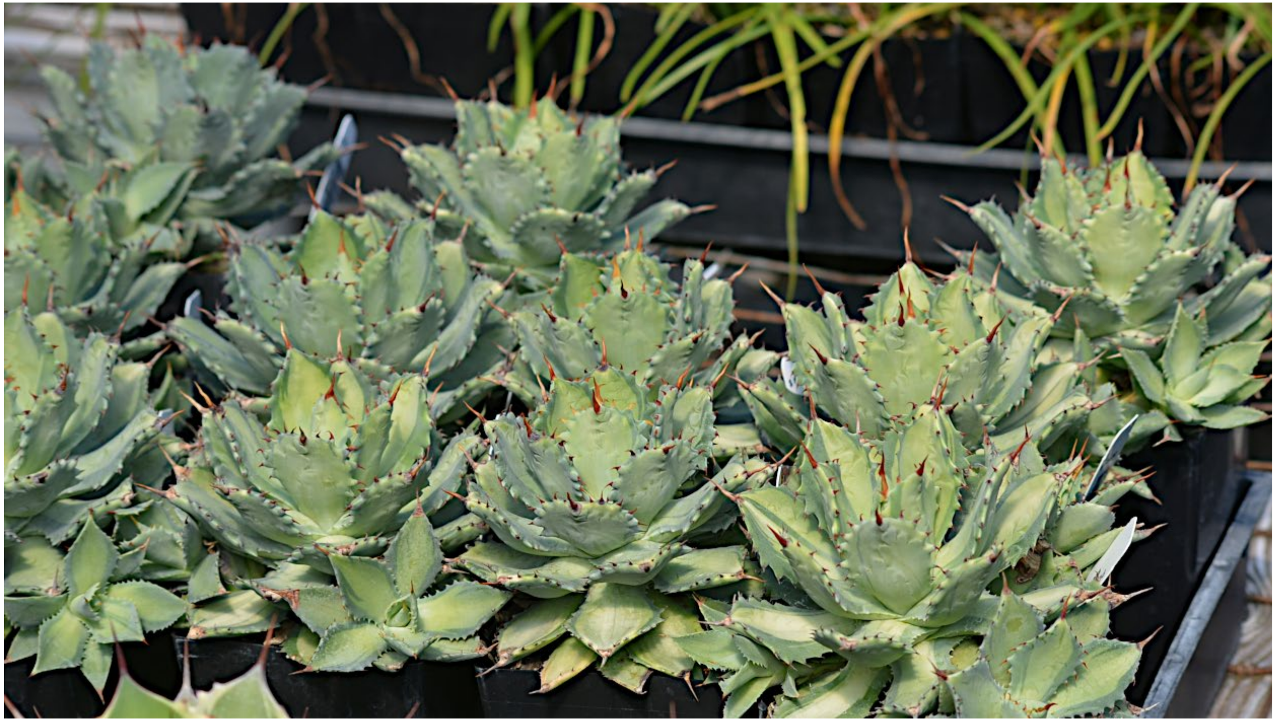
Agave potatorum 'Becky' at Plants Delights 2019.