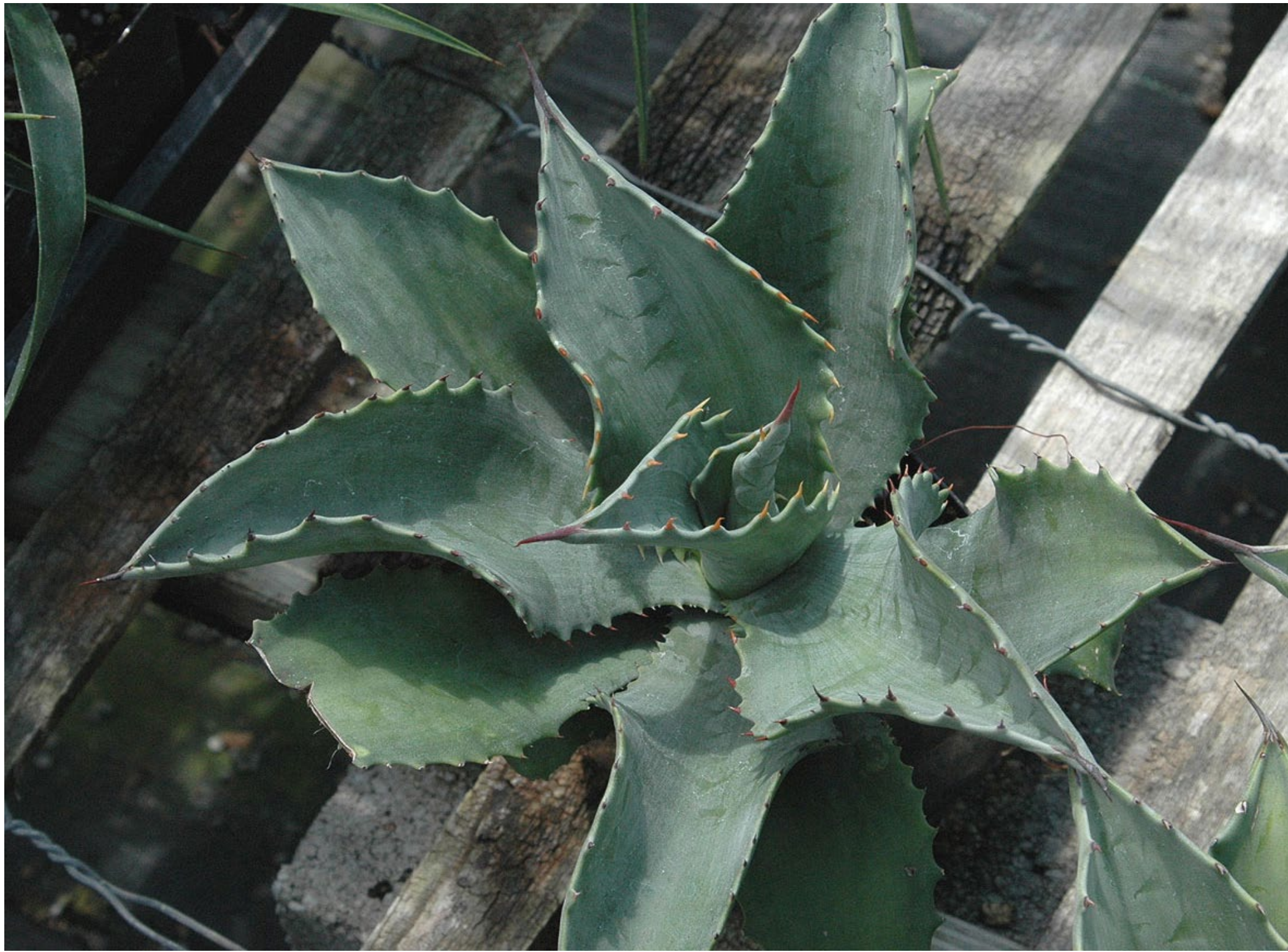
Plant Delights Nursery. September 2006. A pretty, informal and undulating clone

ht: 60 in. tall x 60 in. wide (one rosette)