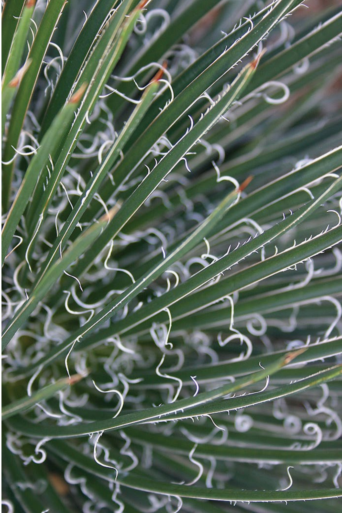
Agave geminifera RASTA MAN® (11/8)