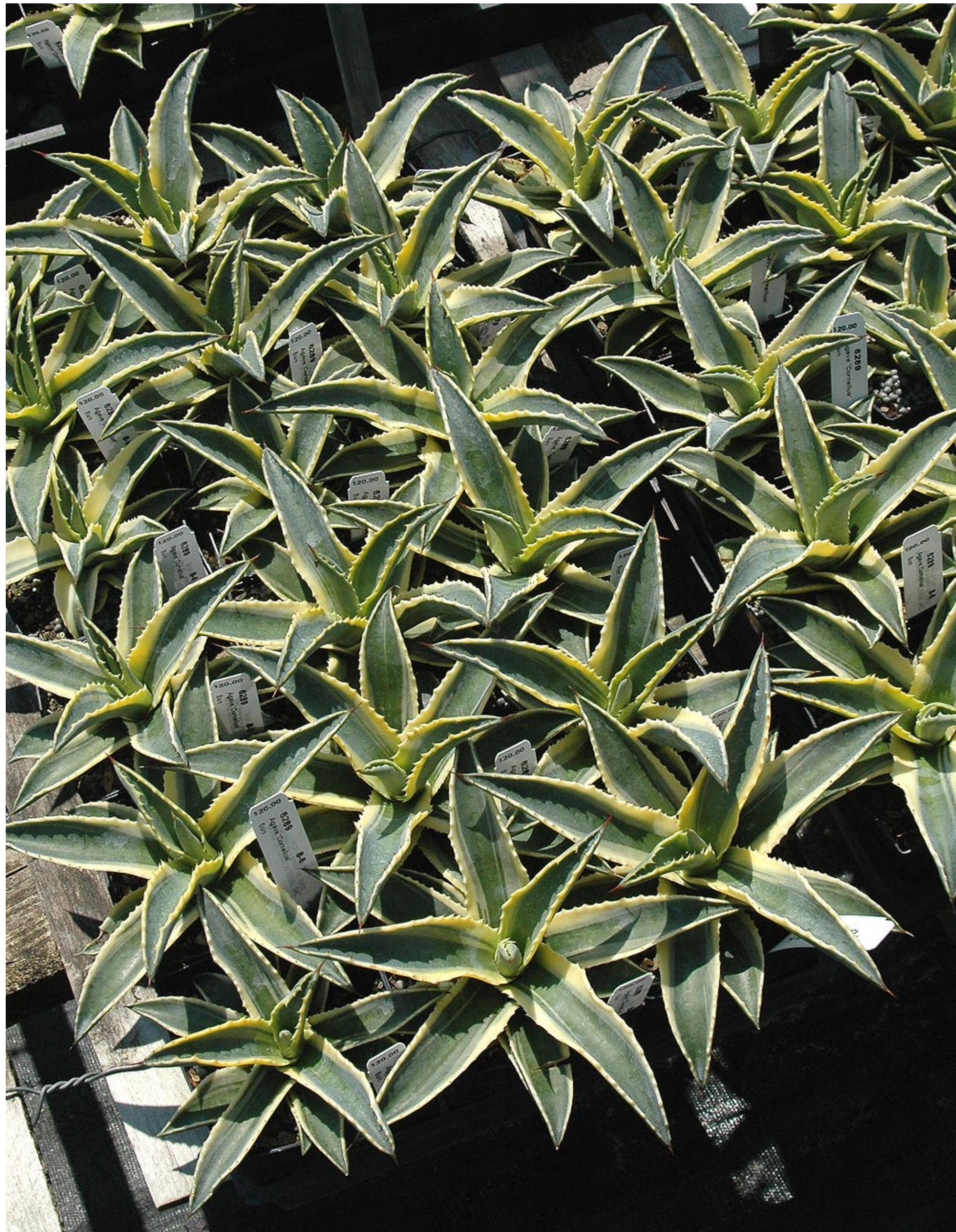
Plant Delights Nursery. May 2006. A nice sales block of this very showy plant.