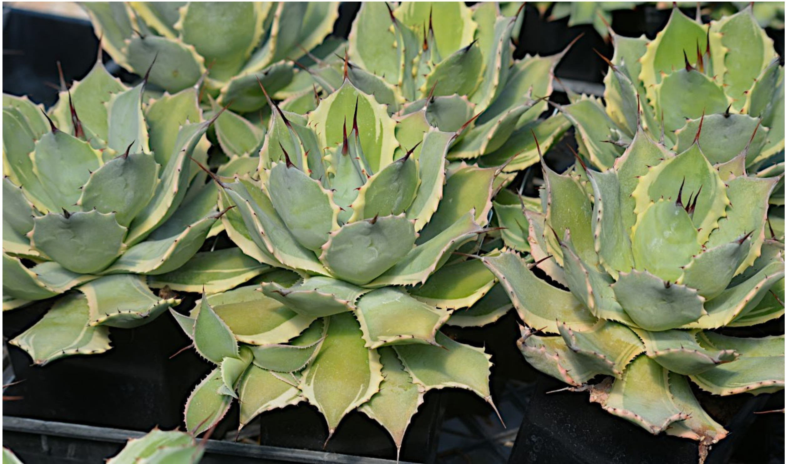
Agave potatorum 'Blue Winds'. Plant Delights 2019.

Agave potatorum 'Cherry Swizzle' San Marcos Growers, https://www.smgrowers.com/products/plants/plantdisplay.asp?strSearchText=agave&plant_id=4151&page=4 , accessed 9.26.2020