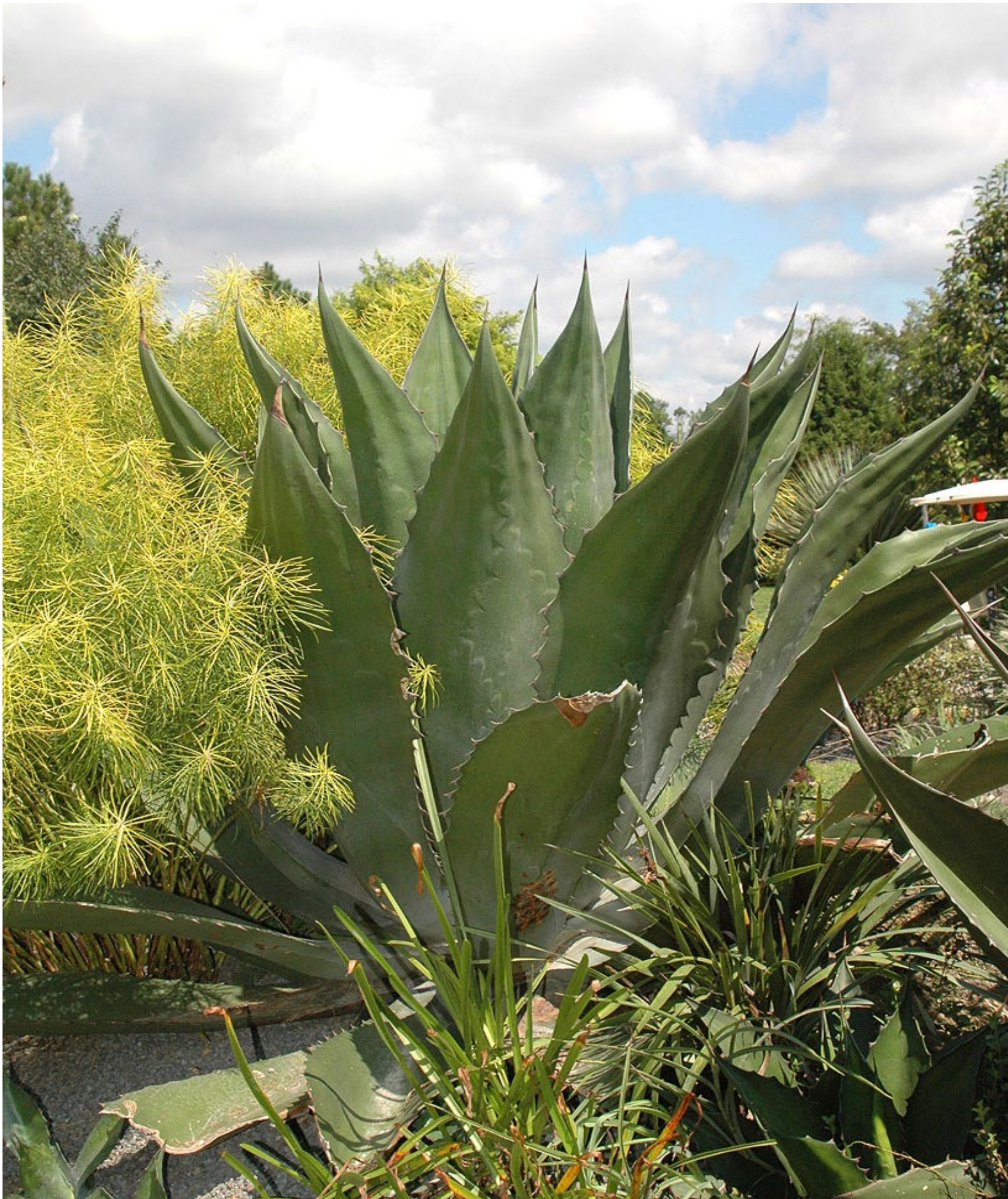
Juniper Level Botanic Garden. September 2006. A nicely developed plant about 30 inches tall showing the rich green colors and the plant's lovely shape. The blue sky and a golden, fading Amsonia give it nice contrast.