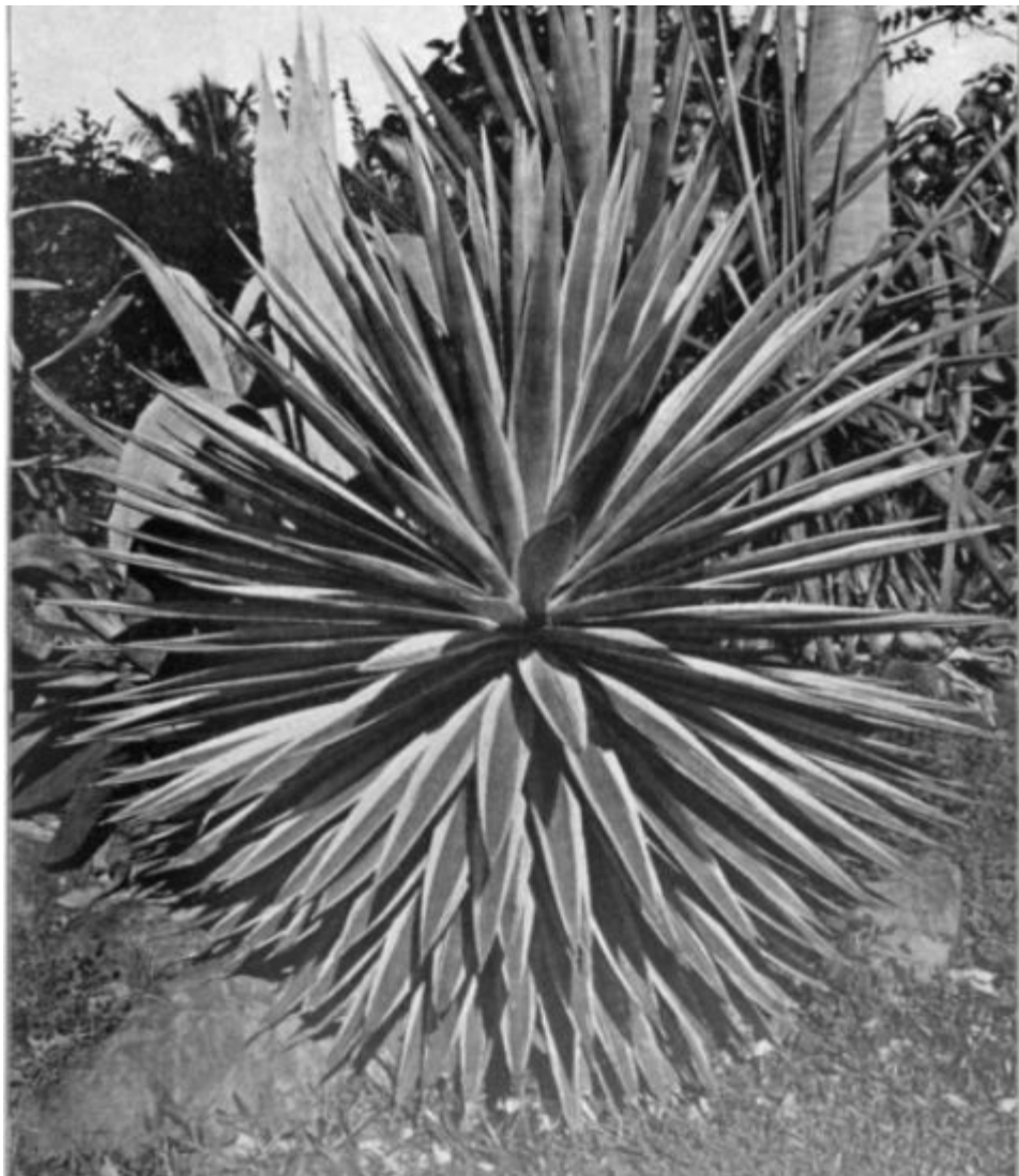
plate above from Trelease 1908, appearing very Yucca-like but he's not going to make that mistake!

lc: white margins on a blue-green base color, the margins often mottled