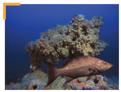
Many mesophotic coral reefs are located in Flower Gardens Bank National Marine Sanctuary, in the Gulf of Mexico.

Scientists have hypothesized that mesophotic coral ecosystems may serve as sources to replenish degraded shallow-water coral reefs impacted by climate change.