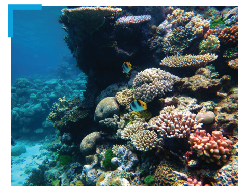
The Great Barrier Reef, located off the Northeast Coast of Australia, is the most expansive shallow-water coral reef system in the world.

Can range in size from a single polyp to a colony that is several meters tall.