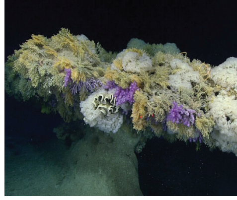
An unusual umbrella-shaped pillar feature covered in deep-sea corals and sponges found on the southeastern side of Jarvis Island in the Pacific Ocean.