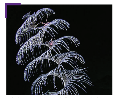
Color is not necessarily an indicator of health in deep-sea corals. Some species, like this Iridigorgia soft coral, can be white in color due to their lack of photosynthetic zooxanthellae.

Many live for hundreds of years, with some colonies living over 4,000 years. Over time, these slow-growing corals can build mounds that rise over 150 meters (500 feet) off the seafloor.