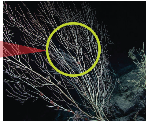
The coral colony creates a skeleton from calcium carbonate in the seawater. This skeleton gives deep-sea corals their shape, like the branching shape of the bamboo coral seen here. The skeletons also provide the overall architecture of deep-sea corals.