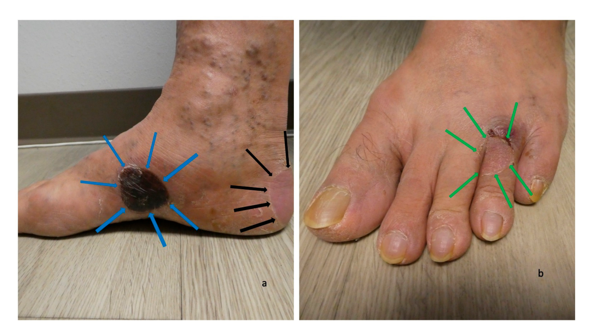
Figure 2. Blisters of dyshidrosiform bullous pemphigoid on the feet. A black-roofed and flattened blister on the instep (outlined in blue arrows) and another flattened blister that is primarily on the posterior heel and extends to the plantar foot (outlined in black arrows) on the medial foot ( a ) of a 61-year-old man. A deroofed blister is on the proximal fourth toe (outlined in green arrows) of the left dorsal foot ( b ). The figure and legend were originally published in Cureus under the Creative Commons (CC-BY): <a href="https://creativecommons.org/licenses/">https://creativecommons.org/licenses/</a> on 11 January 2020 (Cohen PR: Dyshidrosiform bullous pemphigoid: Case reports and review. Cureus. 2020 Jan 11:12(1):e6630) and are republished with permission.