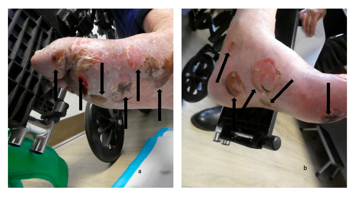
Figure 4. Blisters on the feet of a man with dyshidrosiform bullous pemphigoid. The plantar and medial surfaces of the right foot ( a ) and left foot ( b ) of a 65-year-old man with dyshidrosiform bullous pemphigoid show numerous flattened and deroofed blisters (black arrows). The figure and legend were originally published in Cureus under the Creative Commons (CC-BY): <a href="https://creativecommons.org/licenses/">https://creativecommons.org/licenses/</a> on 11 January 2020 (Cohen PR: Dyshidrosiform bullous pemphigoid: Case reports and review. Cureus. 2020 Jan 11:12(1):e6630) and are republished with permission.

In the third scenario, the acral blisters and classically-distributed bulla of bullous pemphigoid appear at the same time. The latter two scenarios occurred in 72% (26 of 36 individuals) dyshidrosiform bullous pemphigoid patients.