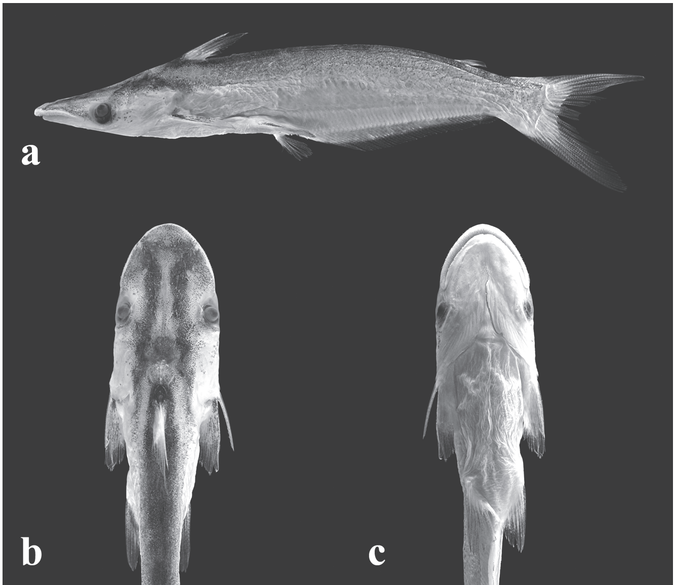
Fig. 1. Ageneiosus uranophthalmus , holotype, INPA 8945, 92.1 mm SL, Brazil, Amazonas State, Itacoatiara, rio Amazonas below Paraná da Eva, in lateral (a), dorsal (b), and ventral (c) views.

placed and dorsally oriented, more visible in dorsal view than in ventral view ( vs. more visible in ventral view than in dorsal view in all other Ageneiosus species). It can be further distinguished from A. atronasmus , A. magoi , A. piperatus , A. polystictus , A. valenciennesi and A. vittatus , by the larger number of anal-fin rays (41-49, mode 47 vs. 23-39). Differ further from A. inermis and A. marmoratus by the possession of forked caudal fin ( vs. truncate or emarginate). Differ further from A. brevis by the uniform coloration, with a brownish to black dorsolateral band ( vs. presence of dark dots along flanks); and larger number of anal-fin rays (41-49, mode 47 vs. 29-42). Differ from A. pardalis by the uniform coloration, with a brownish to black dorsolateral band ( vs. presence of midlateral and sublateral broken dark stripes); longer anal-fin base length (34.6-39.4 vs. 23.0-32.0% SL, according to Walsh, 1990); and larger number of anal-fin rays (41-49, mode 47 vs.