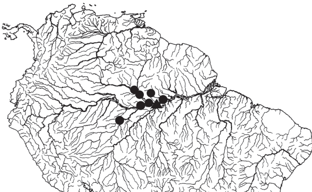
Fig. 4. Drainage map of northern South America illustrating the geographic distribution of Ageneiosus uranophthalmus . Type locality represented by triangle. Some symbols represent more than one locality or lot of specimens. Base map by Marilyn Weitzman.