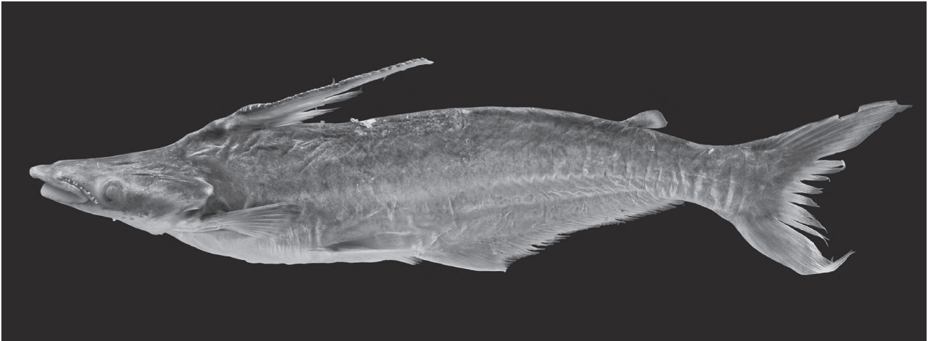
Fig. 3. Ageneiosus uranophthalmus , paratype, INPA 22723, 192.5 mm SL, nuptial male in lateral view.

Etymology. The specific epithet, uranophthalmus , is derived from the Greek ouranos (sky, heaven) and ophthalmos (eye) in allusion to the dorsally oriented eyes.