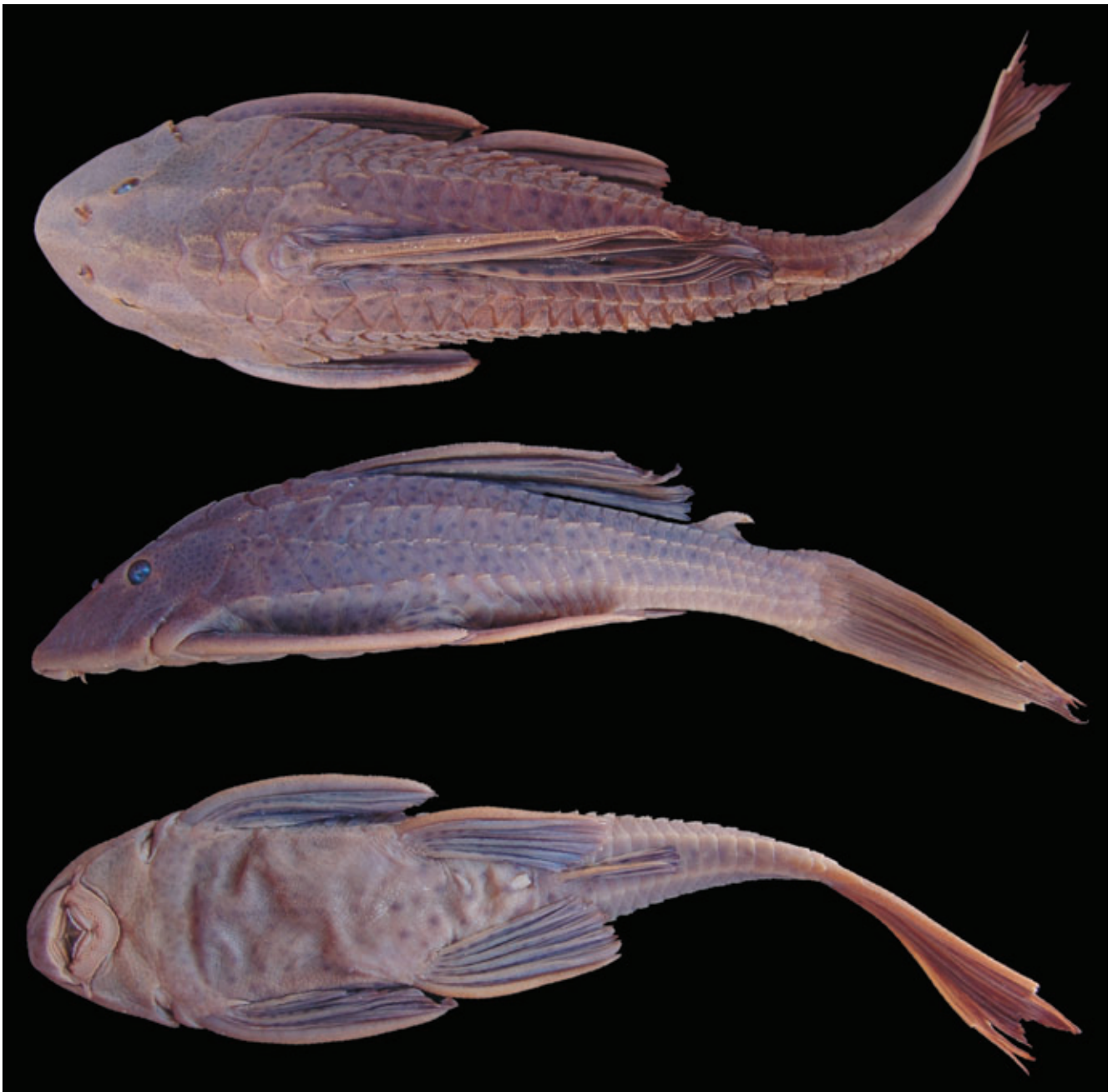
Fig. 2. Hypostomus commersoni , NUP552, 216.0 mm SL, Cavernoso reservoir, rio Cavernoso, tributary of rio Iguaçú, Municipality of Candói, Paraná, Brazil.

Description. Dorsal profile of head slightly curved from tip of snout to anterior orbit; supraoccipital profile high and curved to the dorsal-fin insertion. Head elevated and slightly compressed, totally covered by dermal bones with dense covering of odontodes. A conspicuous keel on posterior region of pterotic-supracleithrum behind orbit, followed by continuous keel of odontodes along each lateral series of plates to caudal peduncle; two inconspicuous and divergent keels from median region of supraoccipital; followed by dorsal series of plates along caudal peduncle, giving to upper caudal peduncle a