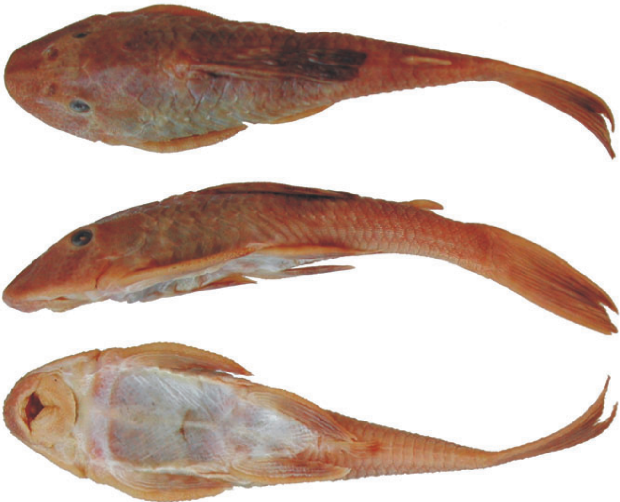
Fig. 3. Holotype of Hypostomus derbyi , FMNH 54246, 90.5 mm SL, Porto União da Victoria, currently Municipality of União da Vitória, rio Iguaçu, Paraná, Brazil.

1944, G. S. Myers & A. L. Carvalho. NUP 151, 2, 186.9-207.4 mm SL, mouth of rio Chopim, Municipality of Cruzeiro do Iguaçu/São Jorge do Oeste, 25°34'28"S 43°04'24"W, 5 Aug 1999, Copel. NUP 555, 1, 130.4 mm SL, Cavernoso reservoir, rio Cavernoso, Municipality of Virmond/Laranjeiras do Sul, 23-24 Aug 1999, Copel. NUP 585, 5, 184.6-268.0 mm SL, Jordão reservoir, rio Jordão, Municipality of Foz do Jordão/Reserva do Iguaçu, 25°45'13"S 52°05'09"W, 14 Oct 1995, Copel. NUP 586, 2, 234.0-240.0 mm SL, Jordão reservoir, rio Jordão, Municipality of Foz do Jordão/Reserva do Iguaçu, 25°45'13"S 52°05'09"W, 14 Oct 1995, Copel. NUP 587, 8, 149.0-207.3 mm SL, Jordão reservoir, rio Jordão, Municipality of Foz do Jordão/Reserva do Iguaçu, 25°45'13"S 52°05'09"W, 14 Oct 1995, Copel. NUP 677, 2, 228.3-230.6 mm SL, Salto Caxias reservoir, rio Iguaçu, Municipality of Capitão de Leônidas Marques/Nova Prata do Iguaçu, 25°32'12"S 53°29'11"W, 13 Aug 1997, Nupélia. NUP 679, 5, 274.0-339.0 mm SL, Salto Caxias reservoir, rio Iguaçu, Municipality of Capitão de Leônidas Marques/Nova Prata do Iguaçu, 25°32'12"S 53°29'11"W, 13 Aug 1997, Nupélia. NUP 715, 5, 47.9-58.0 mm SL, Salto Caxias reservoir, rio Iguaçu, Municipality of Capitão