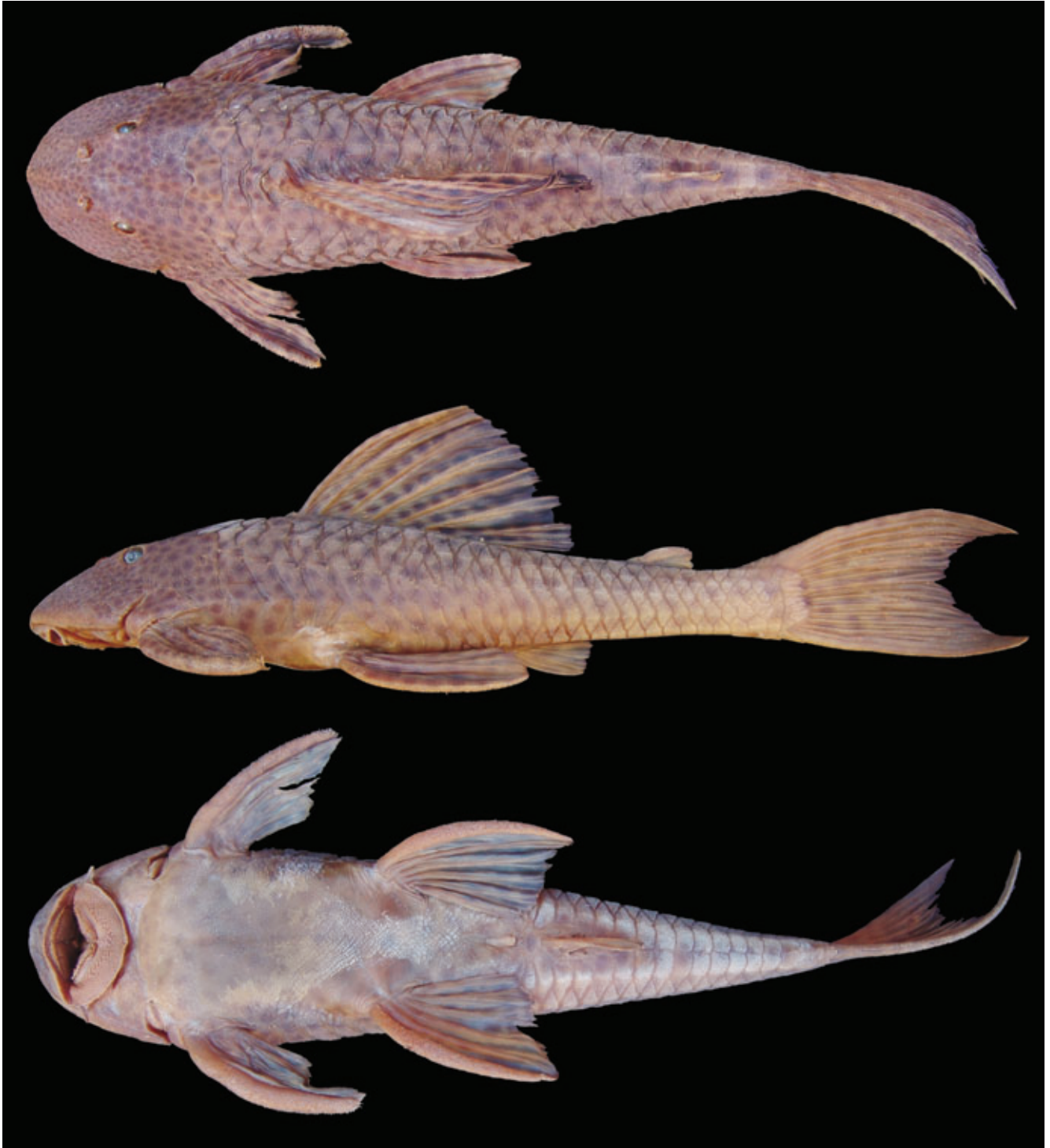
Fig. 4. Hypostomus derbyi , NUP 677, 230.6 mm SL, Salto Caxias reservoir, rio Iguaçu, Municipality of Capitão de Leônidas Marques/Nova Prata do Iguaçu, Paraná, Brazil.

near its foz at Caxias reservoir, Municipality of Cruzeiro do Iguaçu/Nova Prata do Iguaçu, 25°34'27"S 53°05'49"W, 20 Jan 1999, Nupélia. NUP 1828, 7, 184.0-224.0 mm SL, Salto Caxias reservoir, rio Iguaçu, Municipality of Capitão de Leônidas Marques/Nova Prata do Iguaçu, 25°32'12"S 53°29'11"W. Nupélia. NUP 2541, 6, 129.8-270.0 mm SL, Foz do Areia reservoir, rio Areia, Municipality of Cruz Machado/Bituruna, 26°00'05"S 51°39'23"W, 27 Oct 1998, Nupélia. NUP 2542,