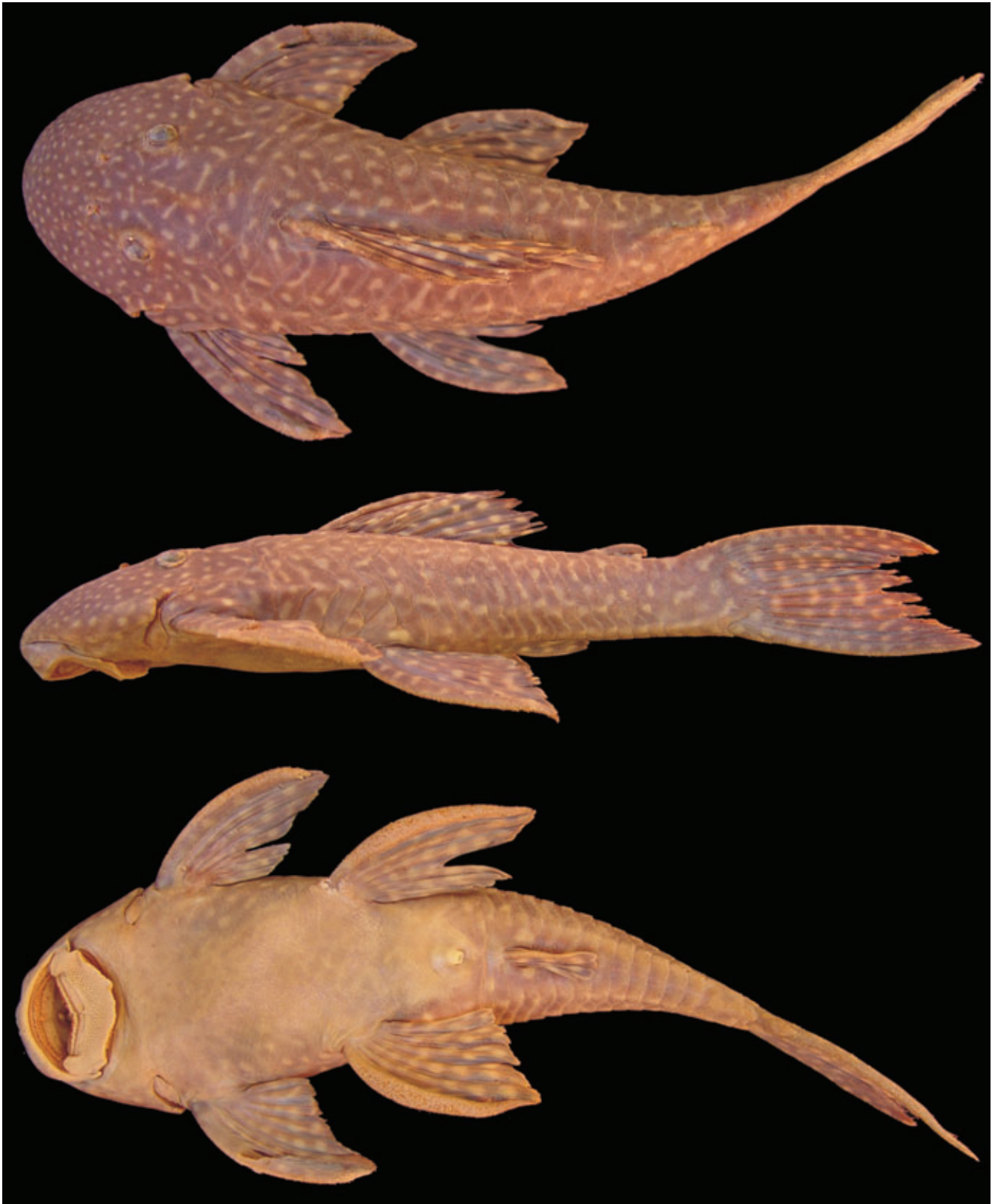
Fig. 1. Hypostomus albopunctatus , NUP 593, 108.2 mm SL, córrego Passo do Aterrado, tributary of rio Jordão, Municipality of Foz do Jordão, Paraná, Brazil.