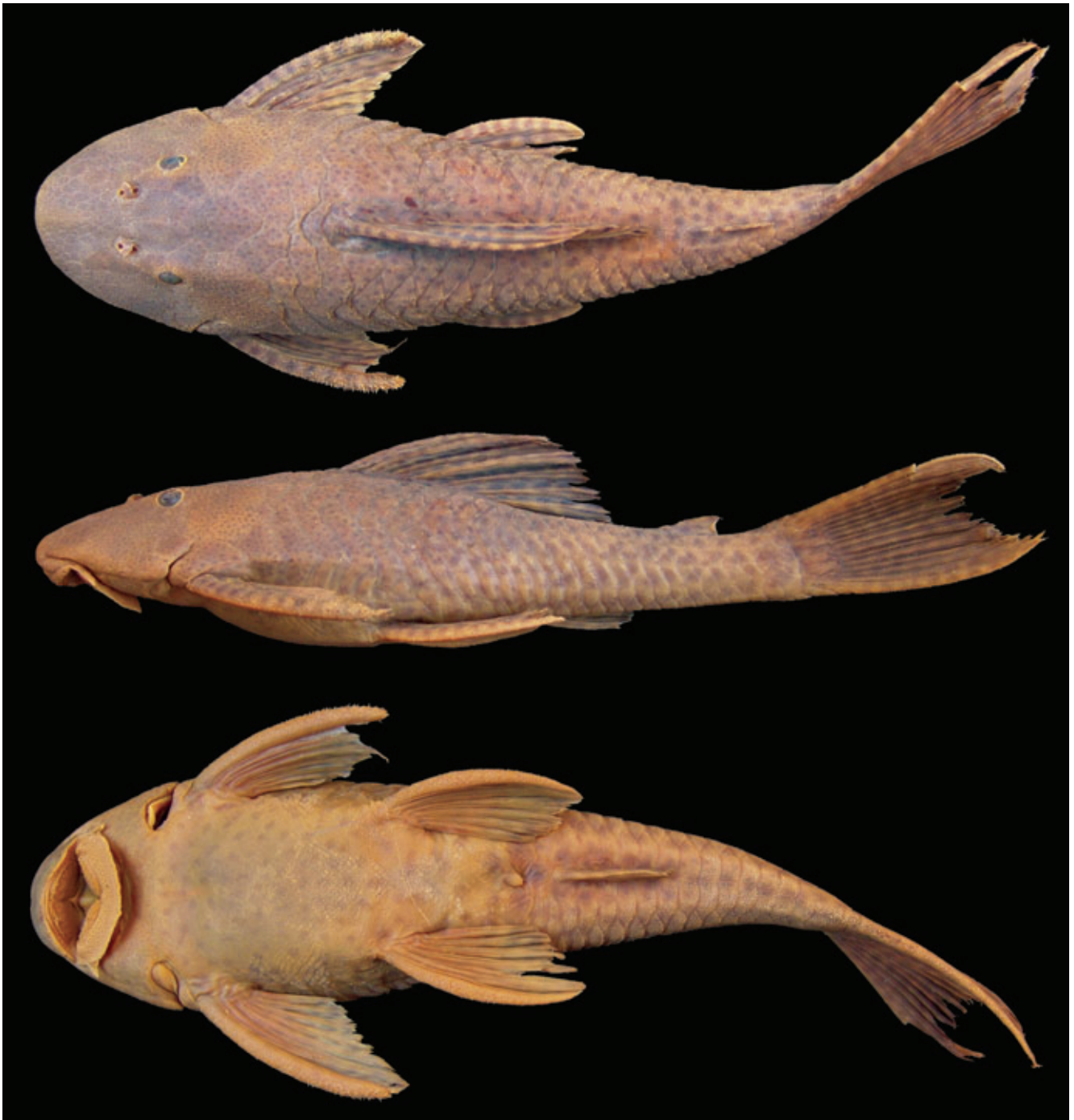
Fig. 7. Holotype of Hypostomus nigropunctatus n. sp., MZUSP 106072, 184.4 mm SL, rio Iguaçú, Municipality of Mangueirinha/ Reserva do Iguaçú, Paraná, Brazil.

H. brevicauda , H. brevis , H. derbyi , H. garmani , H. goyazensis , H. heraldoi , H. hermanni , H. iheringii , H. johnii , H. lima , H. luetkeni , H. macrops , H. nigromaculatus , H. ternetzi , H. topavae and H. wuchereri , by the absence of keels on pterotic-supracleithrum, pre-dorsal plates and on lateral series of plates (vs. having moderate to developed keels on pterotic-supracleithrum, pre-dorsal plates, and lateral series of plates). From H. agna , H. brevicauda , H. heraldoi , H.