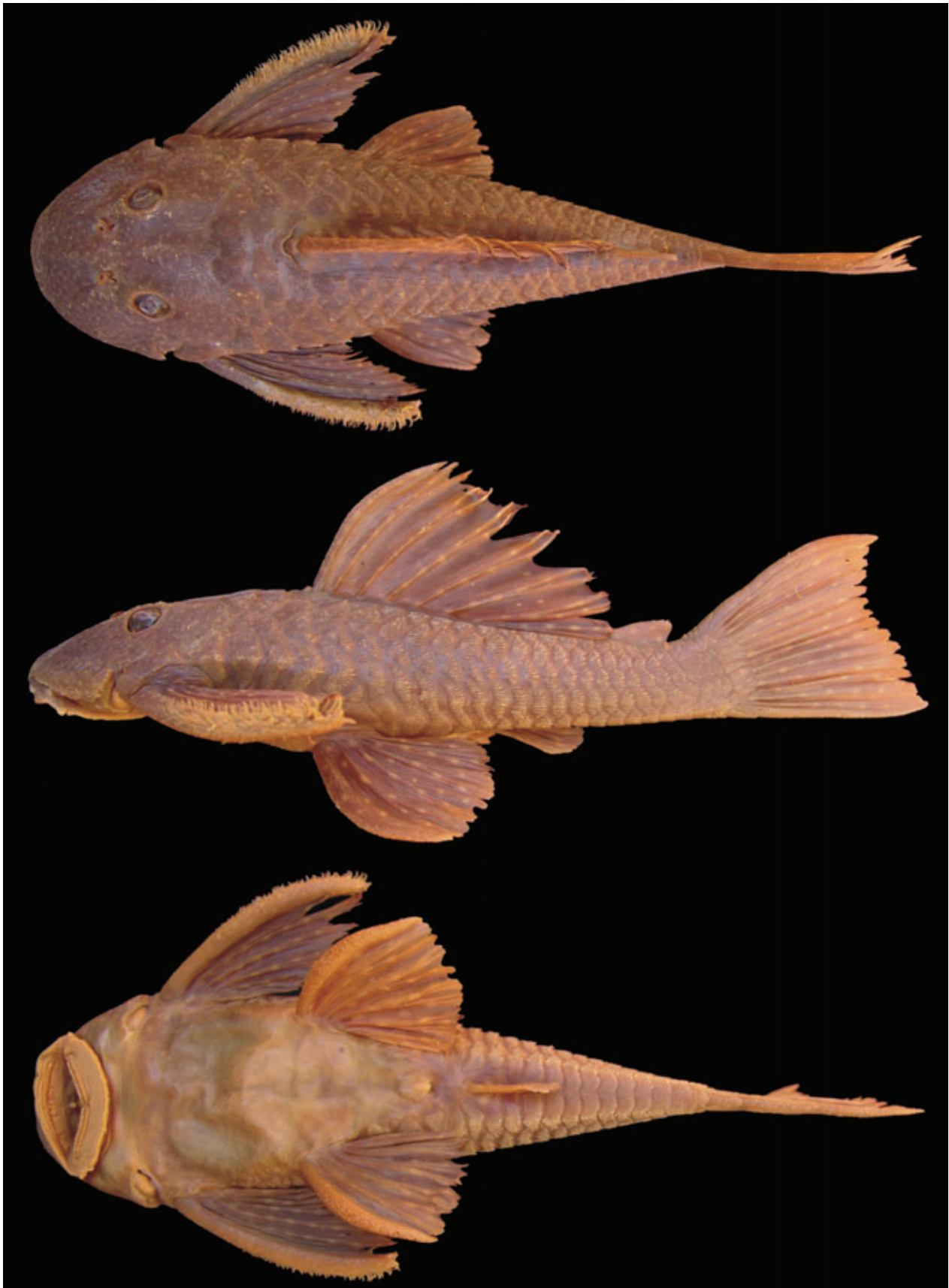
Fig. 6. Hypostomus myersi , NUP 680, 146.2 mm SL, Salto Caxias reservoir, rio Iguaçu, Municipality of Capitão Leônidas Marques/Nova Prata do Iguaçu, Paraná, Brazil.