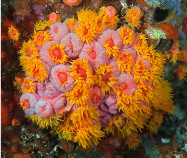
FIGURE 1 Gross skeletal and soft tissue morphology of Tubastraea coccinea

its native habitat (designated offshore O-T6 and inshore I-T6), while a second fragment was transplanted to the alternate study site (Figure 2, designated offshore to inshore OI-Tx and inshore to offshore IO-Tx). The third fragment of each colony (designated offshore O-T0 and inshore I-T0) was taken to the Centro de Biologia Marinha (CEBIMar) and stored at -80^{\circ}\text{C} . At completion of the field experiment, T. coccinea fragments from original and transplanted offshore and inshore sites were recovered and stored also at -80^{\circ}\text{C} for subsequent proteomics analyses. The gross morphological features of each coral fragment were photographed at the beginning and end of the transplant experiment.