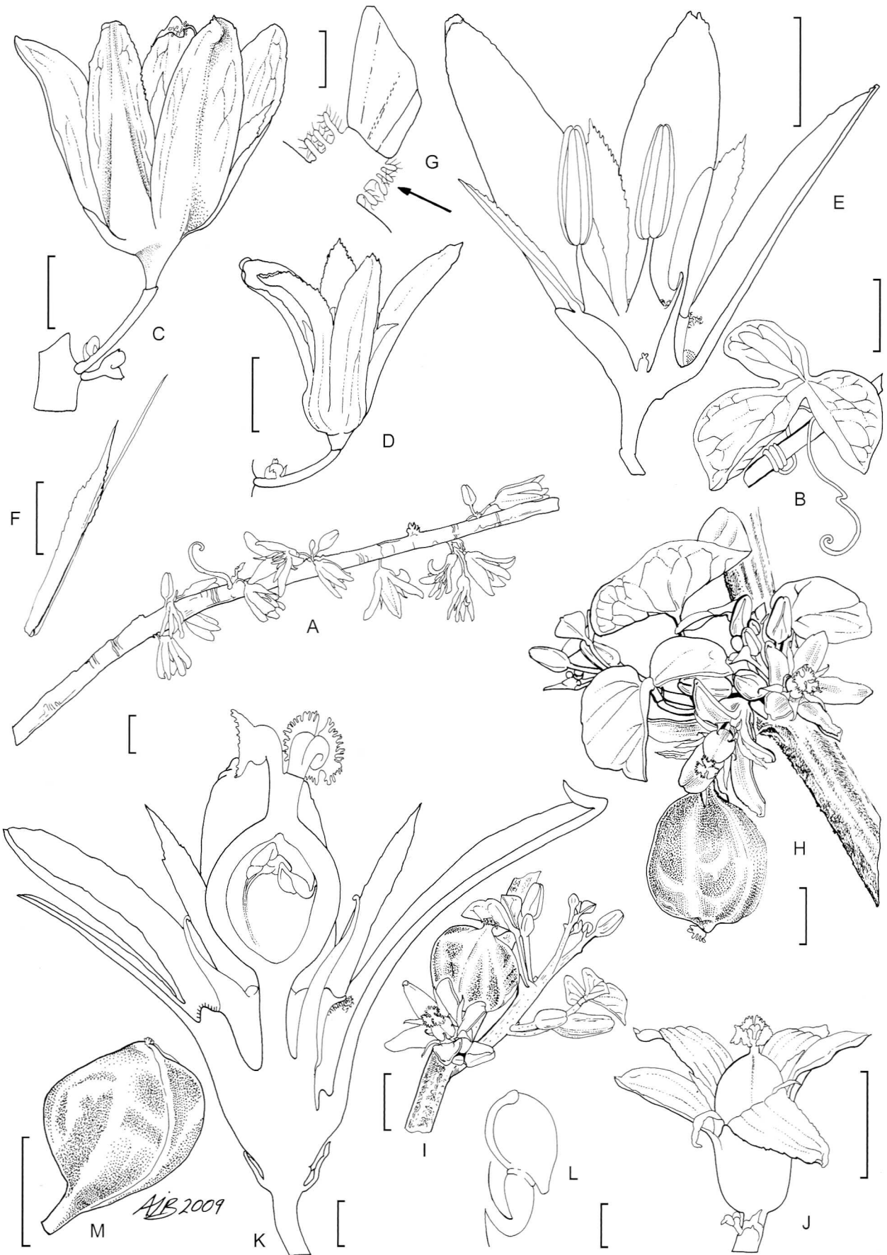
FIGURE 21.— Adenia fruticosa subsp. trifoliolata . A, habit; B, leaf; C, ♂ flower (large form); D, ♂ flower (small form); E, ♂ half-flower diagram; F, petal: reduced lamina with awn; G, connective of ♂ flower (arrowed); H, ♀ inflorescence with leaves; I, ♀ inflorescence structure; J, ♀ flower; K, ♀ half-flower diagram; L, ovule; M, mature fruit. Scale bars: A, M, 10 mm; B–E, H–J, 5 mm; F, G, 2 mm; K, 1 mm; L, 0.2 mm. Artist: Angela Beaumont.