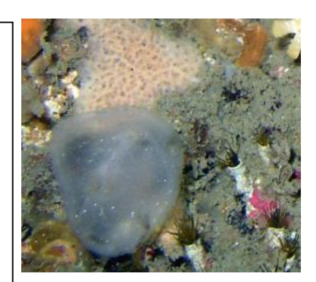
Photo by Derek Holzapfel http://naturediver.com/Gallery/Chordata/Brooding-Transparent-Tunicate-Corella-inflata

Fun Fact : Solitary tunicates are hermaphrodites. Some species may even self-fertilize!