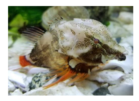
Grunt Sculpin (Rhamphcottus richardsonii)

Fun Fact : This species can survive out of water for quite a while as long as they are moist!