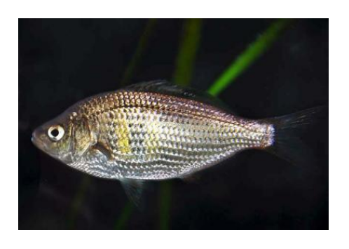
Shiner Perch (Cymatogaster aggregata)

Fun Fact : They use their spiny pectoral fins to crawl on the sea floor. They can often be seen taking shelter in giant barnacle shells. A female grunt sculpin will chase a male into a barnacle shell, trapping him there until she lays her eggs.