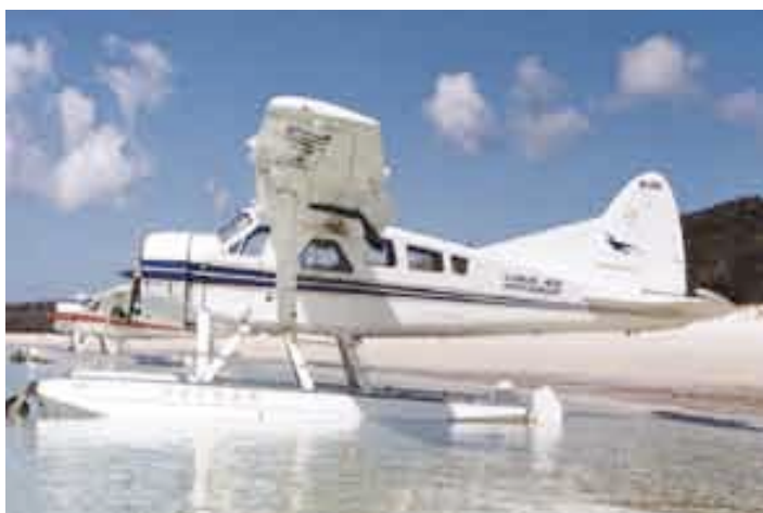
VH-AWZ operates in the Whitsunday Islands

While De Havilland's later owners stopped manufacture of the Beaver in the mid-1960s,