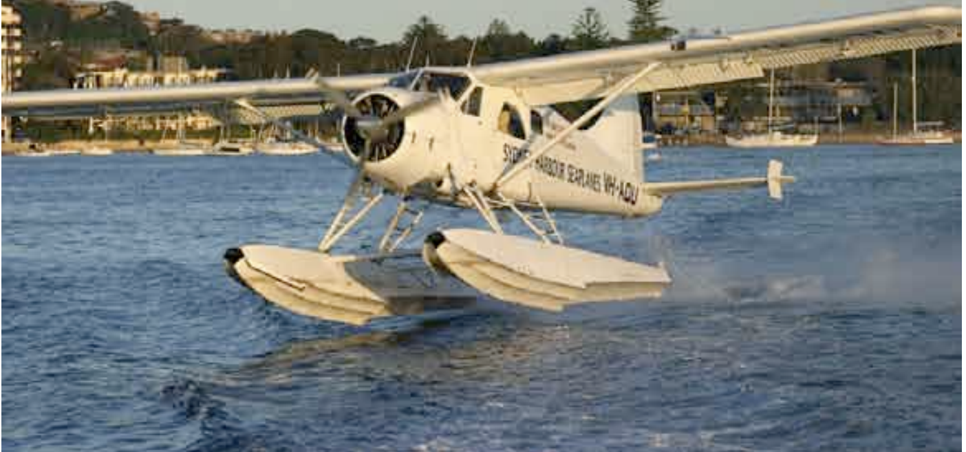
The DHC2-Beaver VH-AQU: A Canadian Aviation Engineering Success