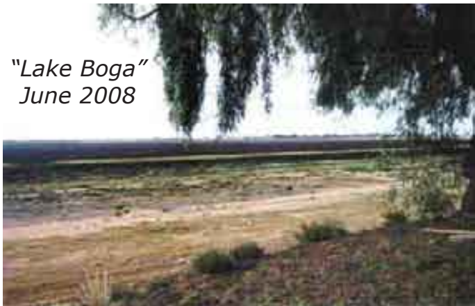
"Lake Boga" June 2008

Brett is the author of Lake Boga at War & is now publishing a new book called Rose Bay Revisited . You can contact Brett on ph 0408 575 845 catalina@hotmail.net.au