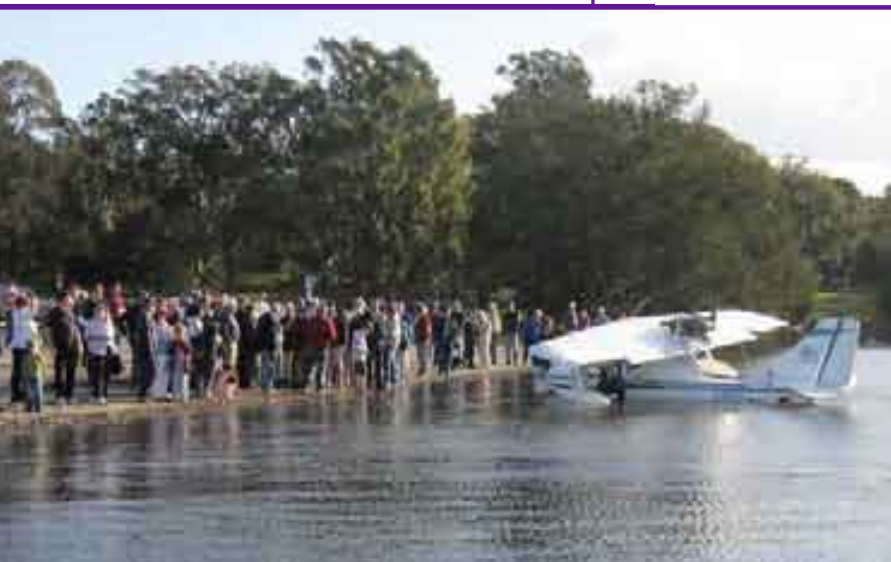
The crowd gathers - Eager to see VH-PAZ up close