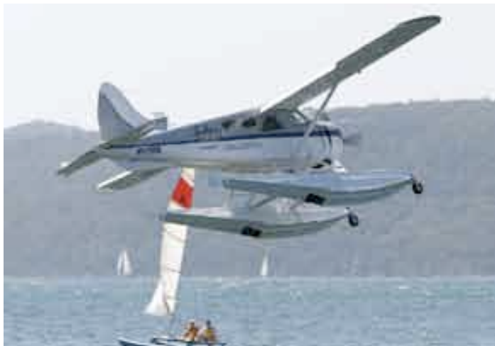
VH-SWB operates in the Sydney Area

A trusted and reliable airplane, the Beaver is loved by its pilots, whether fitted with wheels, floats or skis. Beavers have hauled almost everything, from military troops and supplies, to food, medicine, timber, and almost anything else one could imagine. From 1947 to 1967, De Havilland Canada built nearly 1,700 Beaver aircraft.