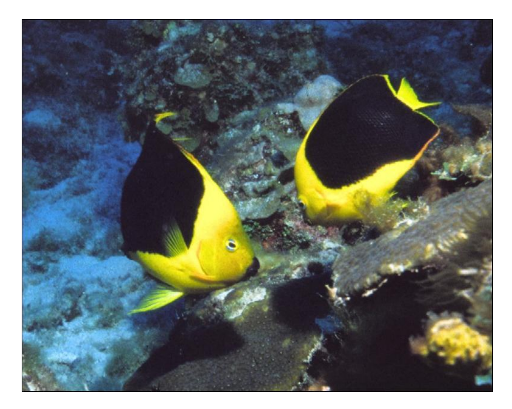
Fig. 5. Two rock beauty angelfish swimming near a coral reef.