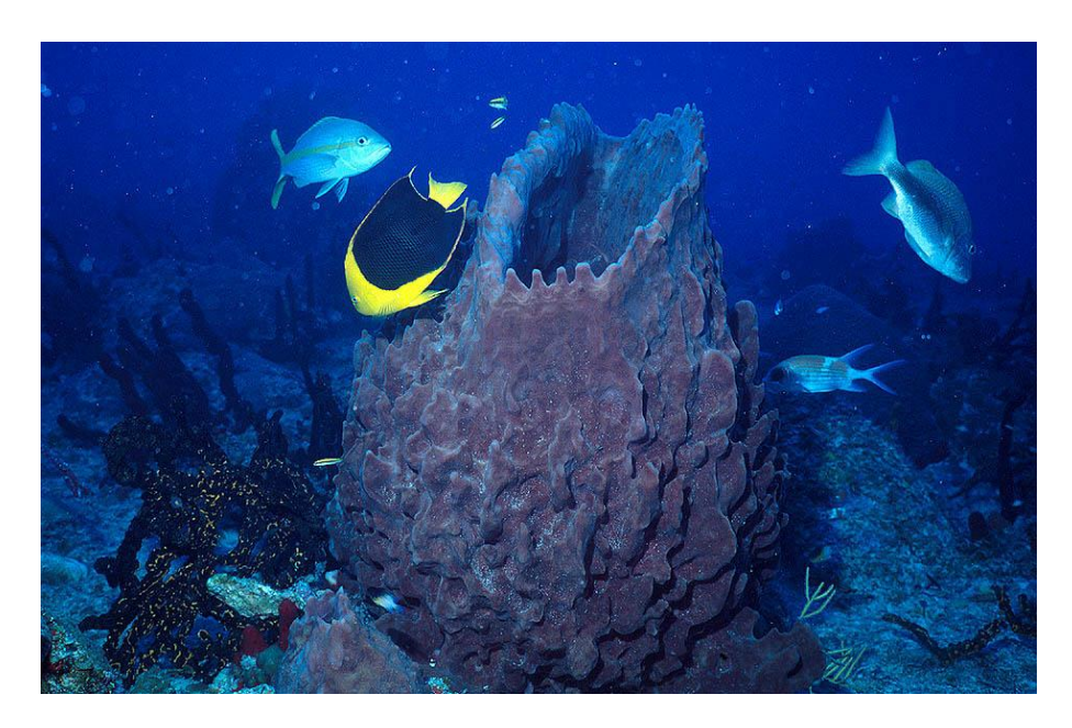
Fig. 4. Adult rock beauty swimming around a coral reef in Bimini, Bahamas. [http://www.reefnews.com/reefnews/photos/bimini/rockbty1.jpg, downloaded 18 March 2015]