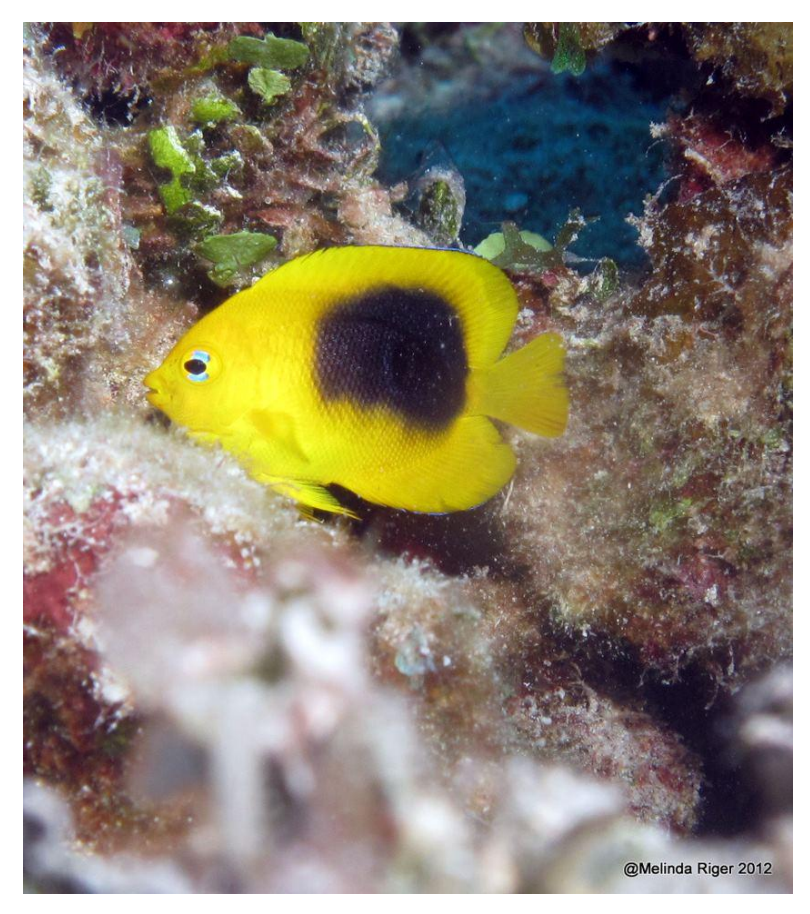
Fig. 2. Juvenile rock beauty hiding in a coral crevice.