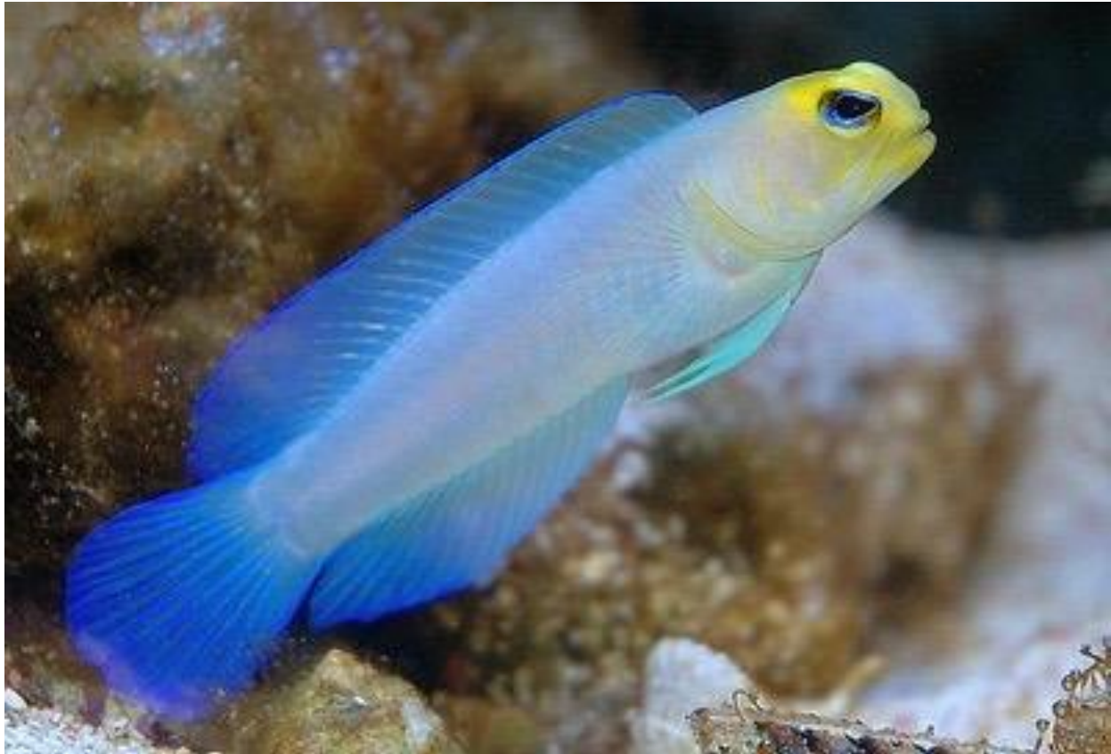
Fig. 1. Yellow-headed jawfish, Opistognathus aurifrons .

[ http://rockncritters.co.uk/index.php?main_page=index&cPath=17_21_85 , downloaded 22 October 2016]