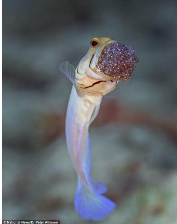
Fig. 4. Male yellow-headed jawfish holding fertilized eggs in its mouth.