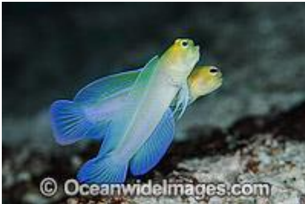
Fig. 5. A pair of yellow-headed jawfish swimming together.