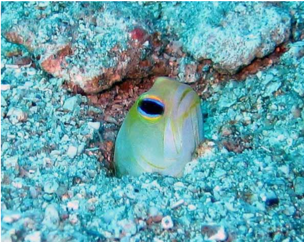
Fig. 3. Yellow-headed jawfish inside its burrow, with its head sticking out.

[ http://www.discoverlife.org/nh/maps/Vertebrata/Fish/Opistognathidae/Opistognathus/map_of_Opistognathus_aurifrons.jpg , downloaded 22 October 2016]