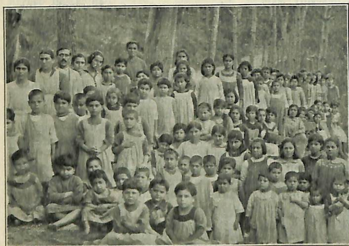
GROUP OF FRIENDS OF ARMENIA ORPHANS AND WORKERS UNDER THE PINES, BRUMMANA.

I am enclosing some more names of S. C. Fund children; you have now up to 155. It is not possible to send all together. I am waiting now for the names from Tripoli, Damascus, and Adana; in each of these