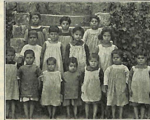
"FRIENDS OF ARMENIA" ORPHANS AT BRUMMANA.

Jesus said, "Feed My lambs," and what must He feel as He looks down on some homes to-day, and