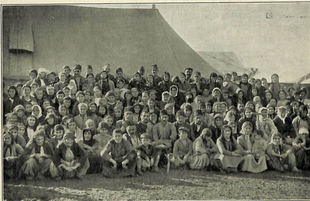
BEYROUT REFUGEE CAMP.

Marquee in Background sent by "Friends of Armenia."