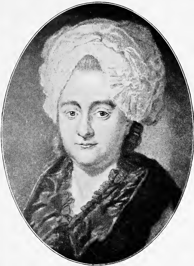
Frau Rat Goethe