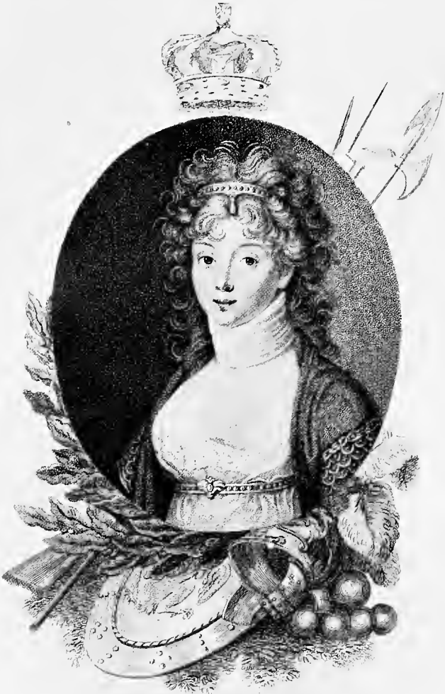
Queen Luise (1805)