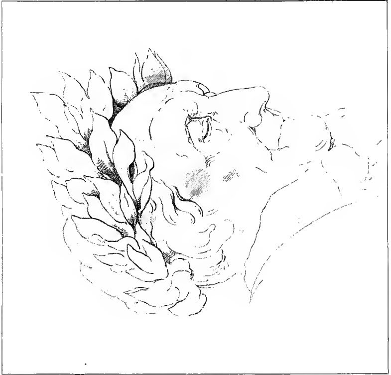
Goethe (on his Deathbed)