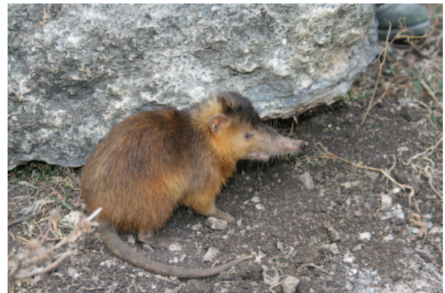
Fig. 1. —An adult male Solenodon paradoxus at Mencía, Pedernales Region, southwest Dominican Republic.

and Cuban solenodons 25 million years ago (Roca et al. 2004). Nomenclatural uncertainties surround this species that has historically been placed in the unresolved Insectivora. Members of this order have been provisionally divided into 6 orders, but currently no consistent phylogeny exists at this taxonomic level (Hutterer 2005). The name Solenodon comes from the Greek solenos meaning channel or pipe, and odontos meaning tooth, referring to the deeply grooved 2nd lower incisor. The specific name is derived from the Greek paradoxos meaning contrary to all expectation (Woods and Ottenwalder 1992). The species is often locally known