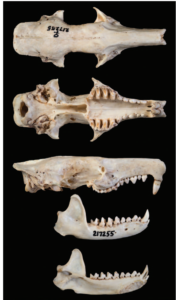
Fig. 2.—Dorsal, ventral, and lateral views of skull and lateral views of right and left mandible, respectively, of an adult female Solenodon paradoxus (Smithsonian Institution United States National Museum 217255) from near La Vega, Dominican Republic. The channel for the transport of venom is evident in i2 in the lower panel. Greatest length of skull is 86.6 mm.

The subspecies, S. p. woodi , is smaller overall than S. p. paradoxus . Ranges (mm) of select cranial characters and bones of S. p. paradoxus specimens from central, northeastern, and eastern Dominican Republic and S. p. woodi specimens from southwestern Dominican Republic and southwestern Haiti were: greatest length of skull, 80.9–91.5 ( n = 75 ) versus 72.3–82.5 ( n = 37 ); condylo-basal length, 75.5–86.6 ( n = 73 ) versus 67.1–79.4 ( n = 37 ); palatal length, 34.8–40.4 ( n = 75 ) versus 30.8–37.0 ( n = 41 ); length of maxillary tooththrow, 23.6–27.6 ( n = 74 ) versus 21.6–25.7 ( n = 43 ); maximum width of M3, 5.2–7.7 ( n = 75 ) versus 4.4–7.2 ( n = 41 ); greatest mandible length, 50.9–58.1 ( n = 78 ) versus 45.2–52.6 ( n = 43 ); length of mandibular tooththrow, 23.3–28.9 ( n = 78 ) versus 23.5–27.4 ( n = 44 ); alveolar length of p4–m3, 14.9–18.5 ( n = 76 ) versus 14.6–17.3 ( n = 44 ); angular condylar height, 12.2–17.1 ( n = 78 ) versus 11.9–15.1 ( n = 44 ); maximum length of p4, 3.7–4.9 ( n = 75 ) versus 3.5–4.9 ( n = 43 ); maximum width of femur, 12.3–14.6 ( n = 44 ) versus 11.4–13.4 ( n = 42 ); and total length of humerus, 43.9–50.7 ( n = 43 ) versus 40.6–46.8 ( n = 37 ).