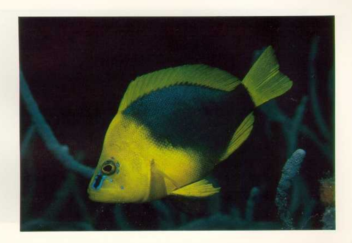
Figure 1.--Adult <u>Hypoplectrus guttavarius</u> (the shy hamlet) approximately 11 cm in length.

the Buck Island Channel outside Teague Bay Reef on the northeast coast of St. Croix. Observations were made from February 20 to March 3, 1980. Further site descriptions are given by Neudecker and Lobel, 1982.