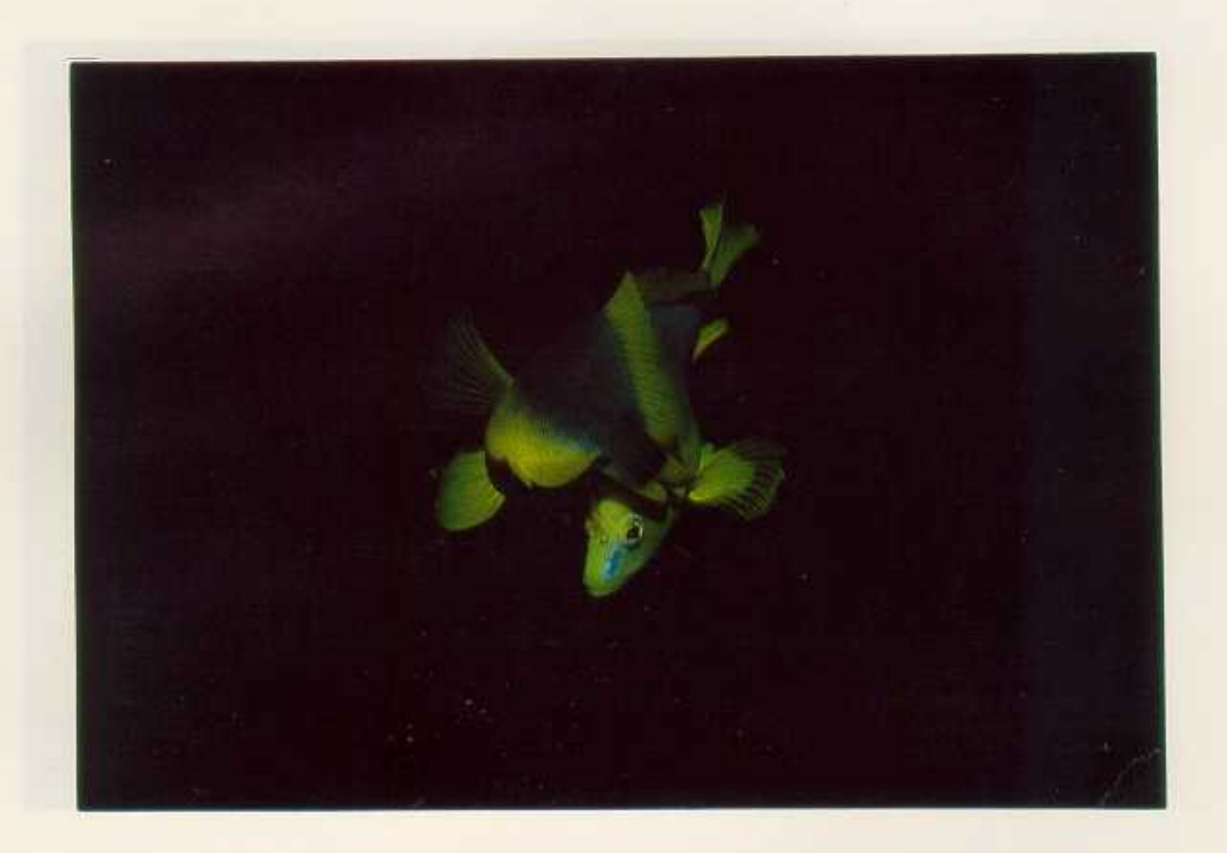
Figure 3.--Hypoplectrus guttavarius embraced in the spawning clasp. The individual facing head-down has bent body in an S-shape.