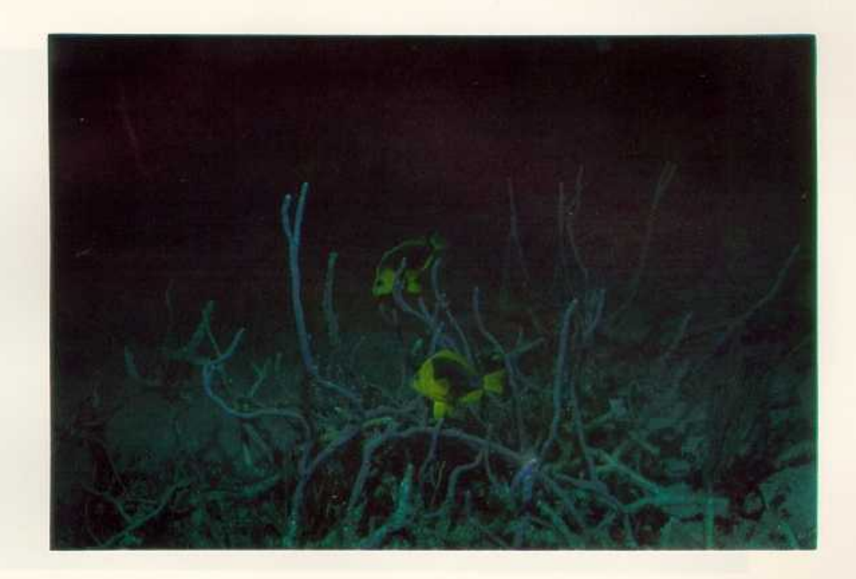
Figure 2.--A pair of <u>Hypoplectrus</u> <u>guttavarius</u> engaged in courtship at a typical spawning site (Deep Reef at East Wall of Salt River Canyon, HYDROLAB site).

The disturbance manipulations were conducted the day after baseline spawning behavior was determined. The manipulation was to disrupt the spawning act each time the fish attempted it. As the pair began to enter the spawning clasp, the observer swam rapidly toward the pair (in an attempt to mimic a predator's behavior). The pair was harassed repeatedly this way for as long as spawning was attempted. When mates parted, close watch was maintained until it was certain that spawning had ceased for the night. Occasionally, a pair would separate, swim several meters apart, return several minutes later, rejoin and attempt to spawn again. Follow-up observations were made on the same pair the day after the manipulation. Data analysis of treatments used the nonparametric Mann-Whitney U test statistic.