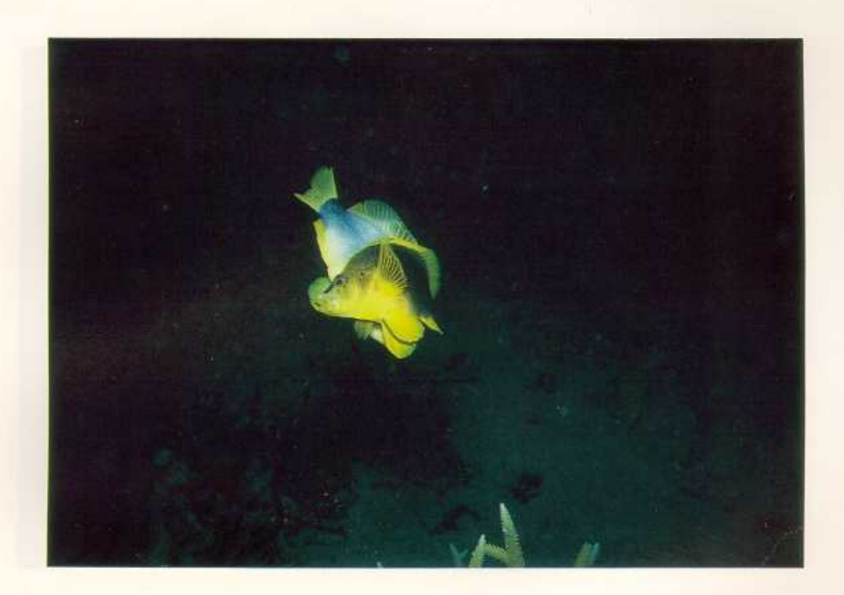
Figure 4.--Hypoplectrus guttavarius embraced in the spawning clasp. The individual folded around the other one facing head-down opens its mouth while quivering and spawning.

as both fish quiver. Quivering lasts for 2-3 sec. The individual folded around the other often opens its mouth while quivering (fig. 4). Following consummation, the fish cease embracing and quickly descend to the bottom. The embracing behavior of hamlets when spawning has been termed the spawning clasp (Fischer, 1980a) and occurs many times throughout an evening. Infrequently, fish would embrace but not quiver, and the release of gametes was not evident. Fischer (1980a) has described the similar spawning behavior and sexual role of H. nigricans.