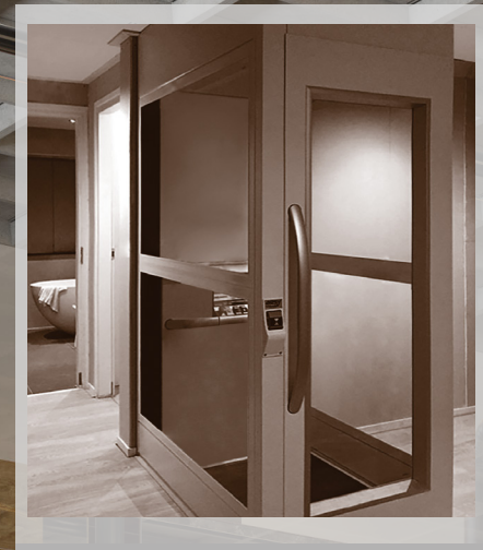
Cibes A4000 Small size platform lift - low back