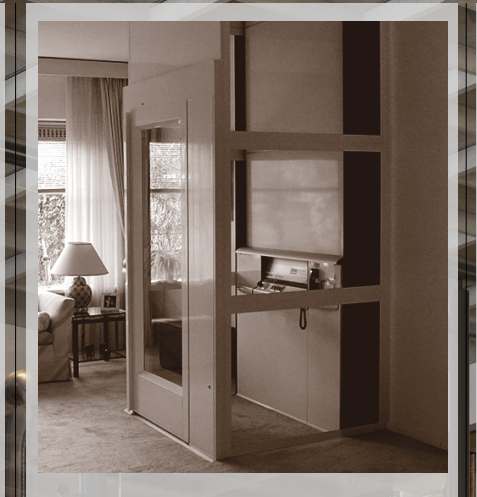
Cibes A5000 Platform lift - low back