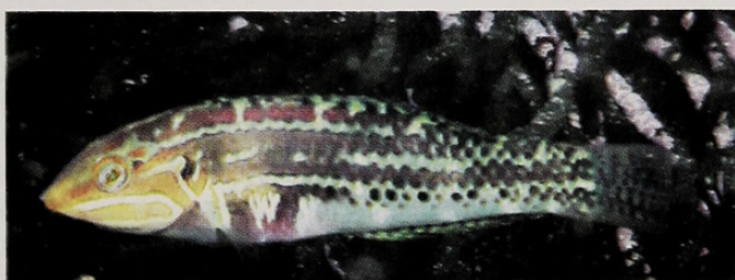
I. Underwater photo of female of Halichoeres zulu , in a rock pool with Caulerpa sp., KwaZulu-Natal.