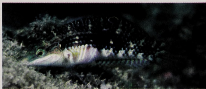
B. Underwater photo of female of Halichoeres margaritaceus , Taiwan (J. E. Randall).