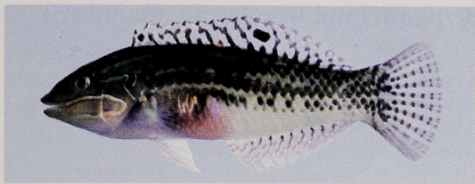
A. Paratype of Halichoeres zulu , SAIAB 82005, female, 79 mm SL, KwaZulu-Natal.