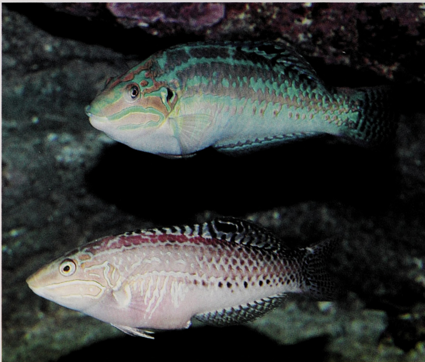
Fig. 1. Male and female of Halichoeres zulu , uShaka Marine World, Durban (D. R. King).

Table I gives the measurements of the new species as percentages of the standard length. Proportional measurements in the text are rounded to the nearest 0.05. Data in parentheses in the description refer to the paratypes.