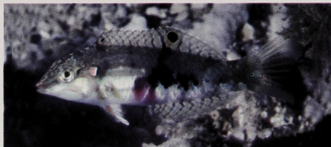
D. Underwater photo of female of Halichoeres nebulosus , Mauritius (J. E. Randall).