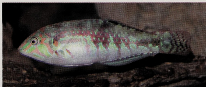
F. Photo of male of Halichoeres nebulosus, uShaka Marine World, Durban.