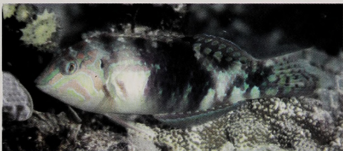
E. Underwater photo of male of Halichoeres nebulosus , Mauritius (J.E. Randall).