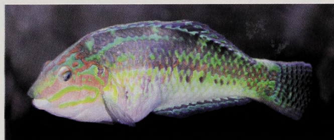
J. Photo of large male of Halichoeres zulu, uShaka Marine World, Durban.