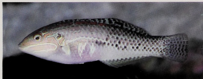
H. Photo of female of Halichoeres zulu, uShaka Marine World, Durban.