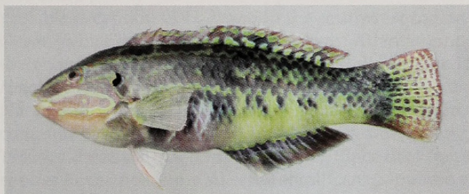
G. Holotype of Halichoeres zulu , SAIAB 83176, male, 135 mm SL, KwaZulu-Natal (D. R. King).