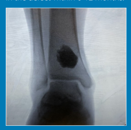
Intra op image of CERAMENT filling the harvest site.

CERAMENT provides the surgeon confidence that native bone will fill in the defect within 6-12 months.