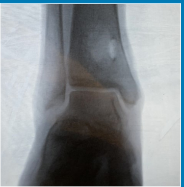
Harvest site created by the Avitus® Bone Harvester.