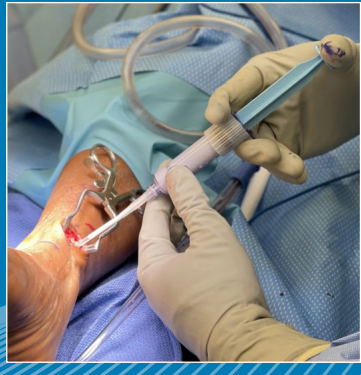
Injecting CERAMENT into Avitus® harvest site.