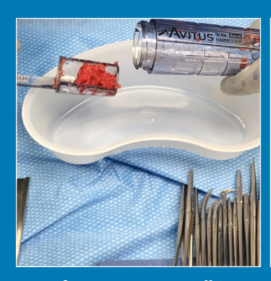
15cc of autogenous cancellous bone harvested with Avitus®.